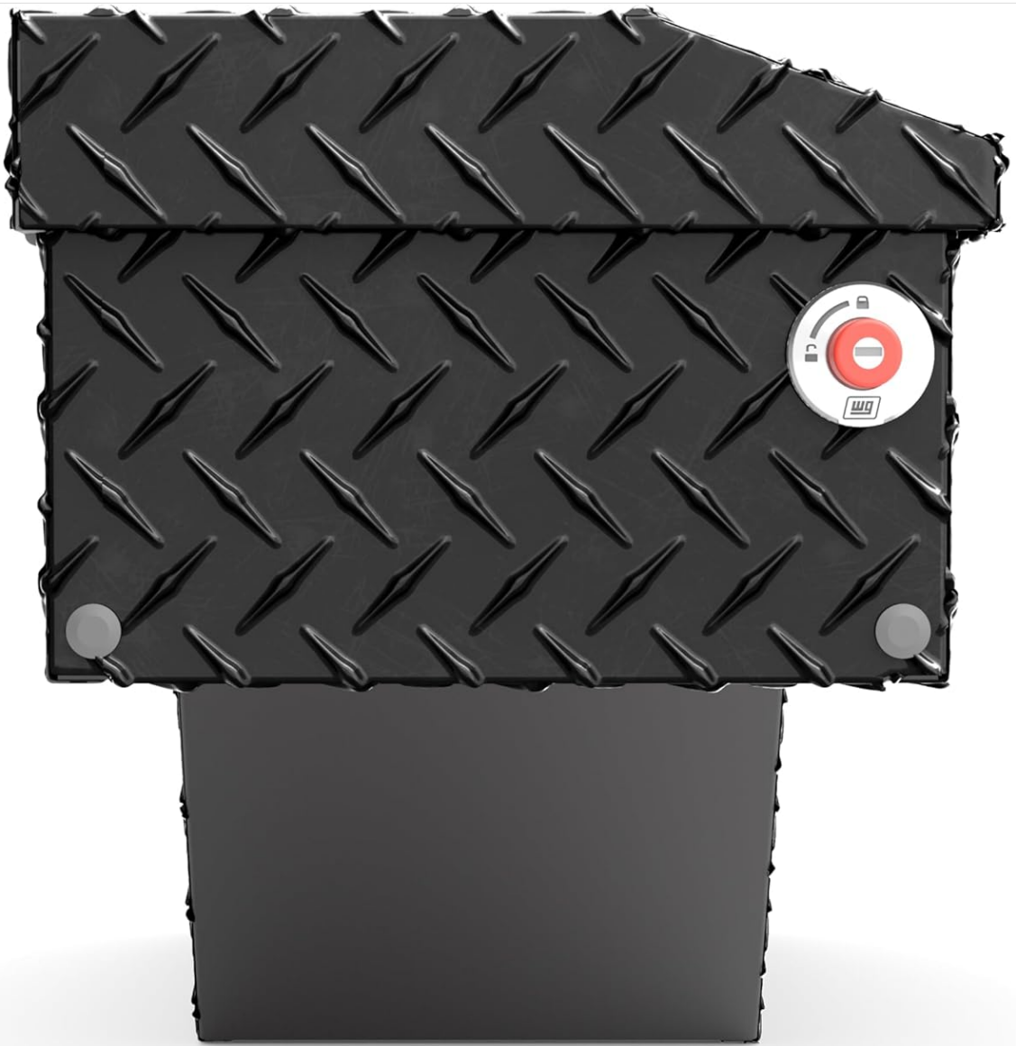
Image: Front view of the Weather Guard 172-5-04 tool box, highlighting the red push-button lock mechanism.