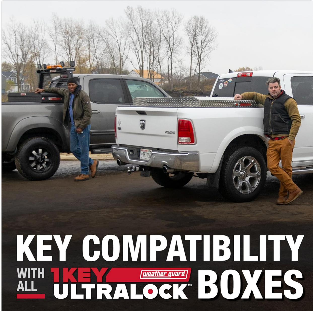
Image: Illustration of the 1KEY ULTRALOCK™ system, showing compatibility across multiple Weather Guard boxes.

This tool box features the 1KEY ULTRALOCK™ system, allowing you to manage multiple Weather Guard truck boxes with a single key. Consult your Weather Guard dealer or the official website for instructions on re-keying or coding your boxes to a single key.