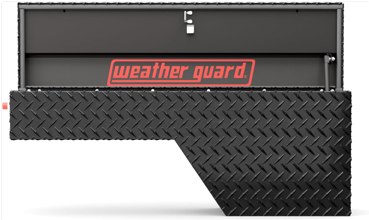
Image: Interior view of the Weather Guard 172-5-04 tool box, showing the Weather Guard logo and internal latching mechanism.

Your browser does not support the video tag.