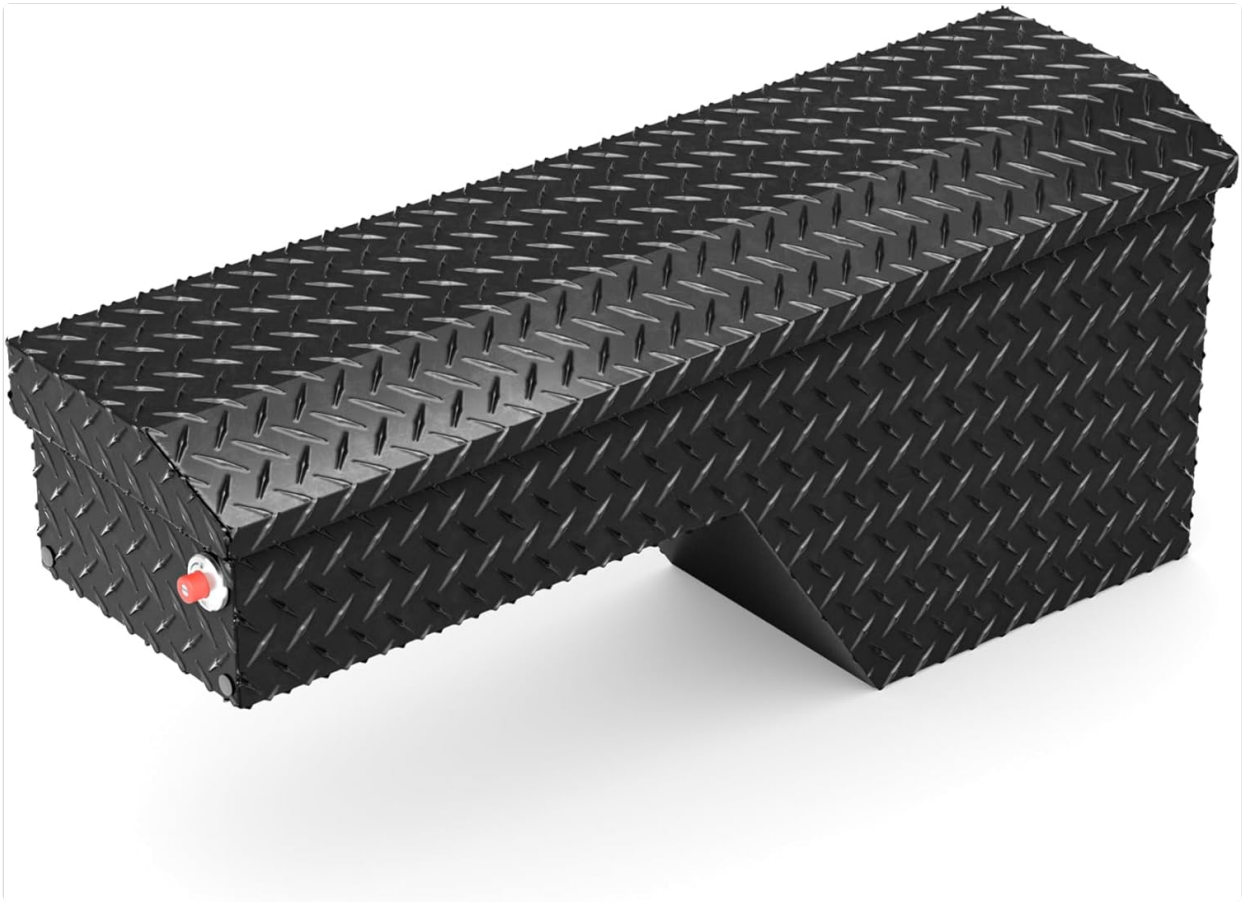
Image: Driver side view of the Weather Guard 172-5-04 tool box, showcasing its design for wheel well placement.