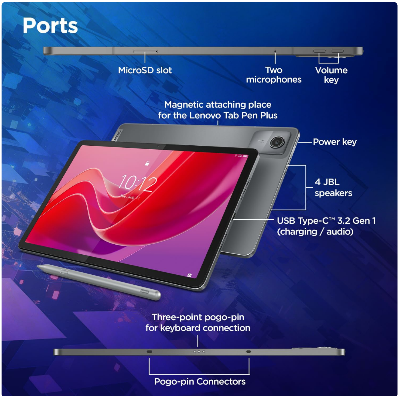
Figure 3: Visual representation of the tablet's sharp 2.5K display and clear quad speakers with Dolby Atmos support.