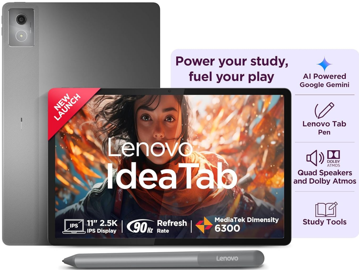
Figure 1: Lenovo Idea Tab with included Pen, highlighting key features like AI Powered Google Gemini, Lenovo Tab Pen, Quad Speakers with Dolby Atmos, and Study Tools.