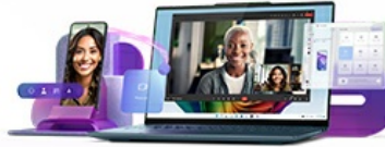
Use Tablet as a High Quality Webcam for PC