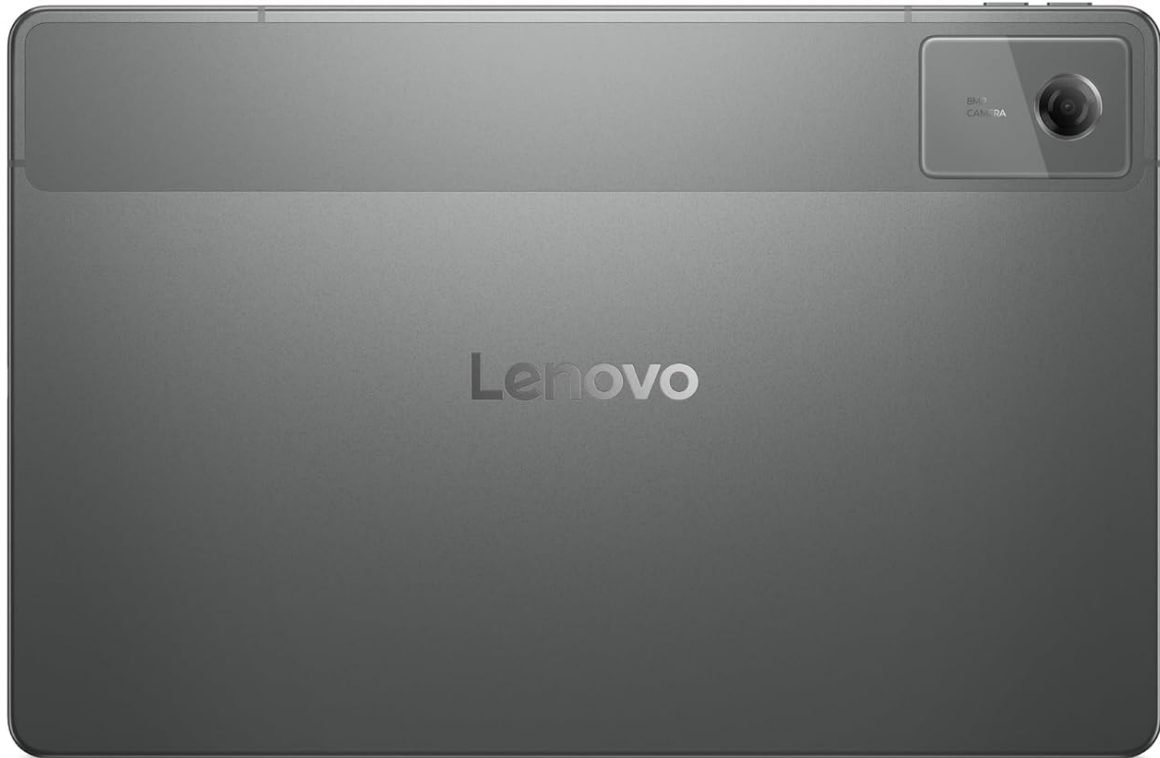
Figure 5: Diagram showing the various ports and physical features of the Lenovo Idea Tab, including the USB Type-C port, MicroSD slot, volume keys, power key, and pogo-pin connectors.