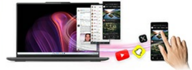
Streaming Android apps to Windows PC