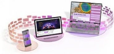
Instant Copy Paste with Smart Clipboard