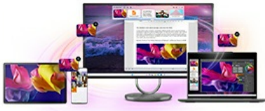
Effortless File Sharing via Share Hub