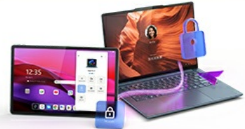
Lock your PC with a Tap