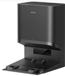
Base station x 1