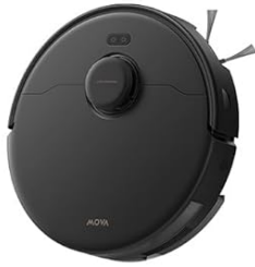
Robot Vacuum x1