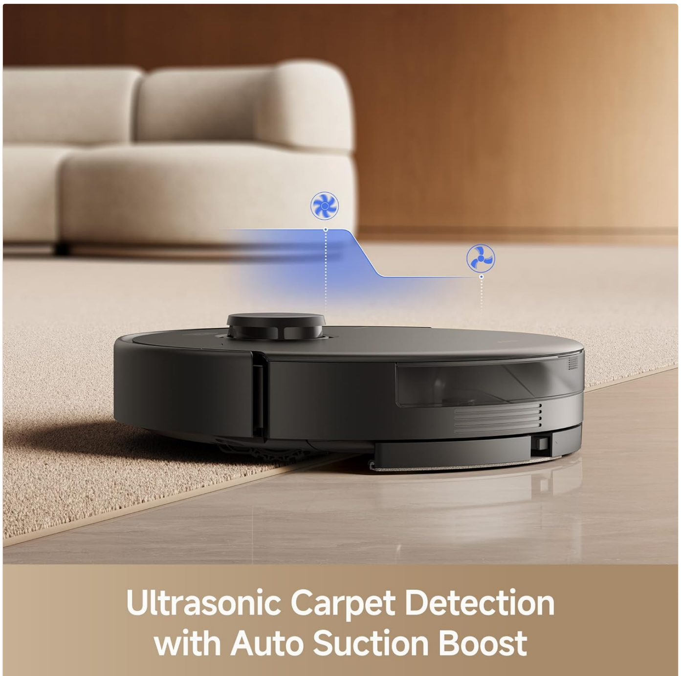
Image: The Mova E30 Pro Plus robot vacuum detecting a carpet and automatically boosting suction for deeper cleaning.

Video: A mopping test of the Mova E30 Pro Plus Robot Vacuum and Mop, showcasing its ability to clean hard floors effectively.