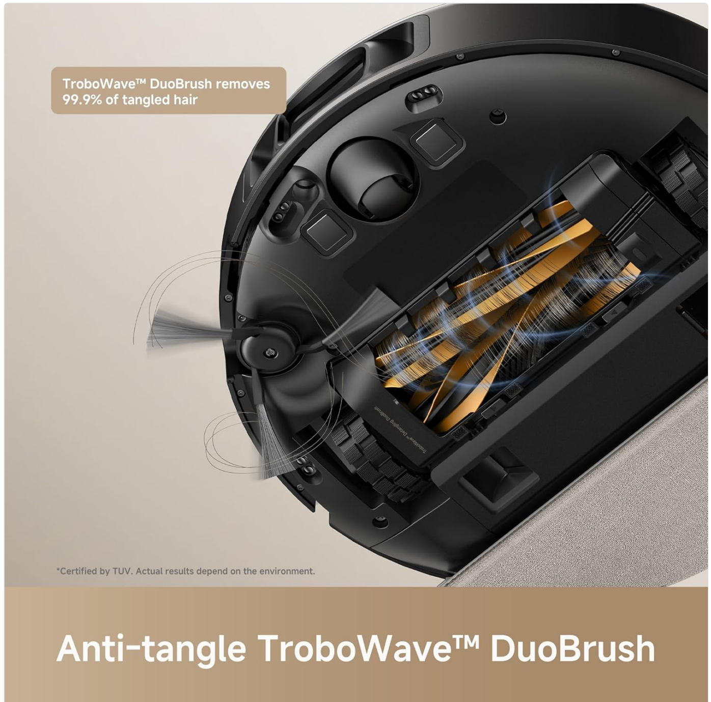
Image: Close-up of the Mova E30 Pro Plus's Anti-tangle TroboWave DuoBrush system.

The anti-tangle DuoRoller brush combines TPU and bristled rubber brushes. Periodically remove the main brush and brush guard to inspect and clean any tangled hair or debris. Use the cleaning tool provided to cut and remove hair wrapped around the brushes.