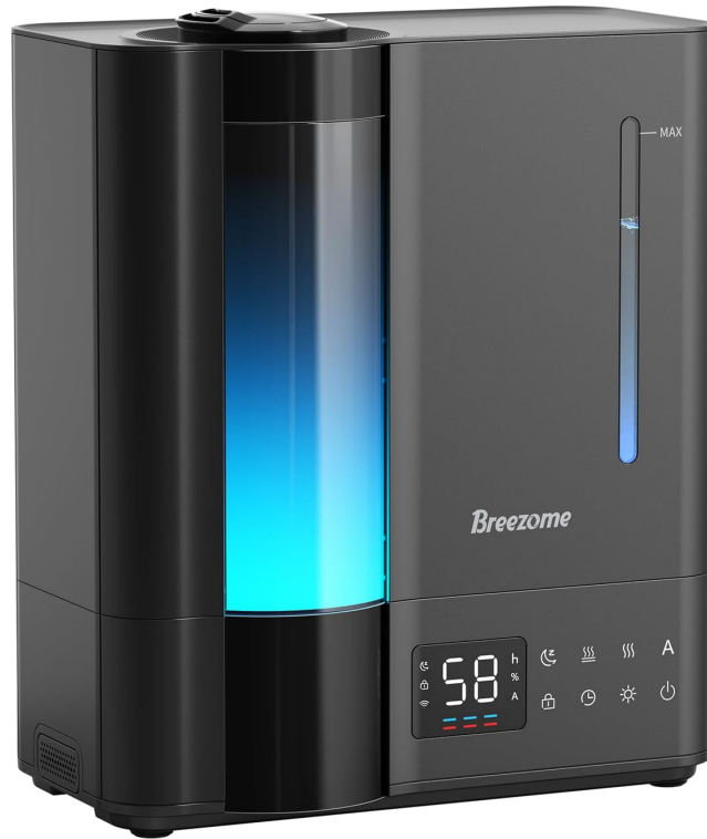
Image: The BREEZOME 8L Humidifier unit, black in color, with a transparent water tank showing a blue light. The control panel is visible at the bottom front.