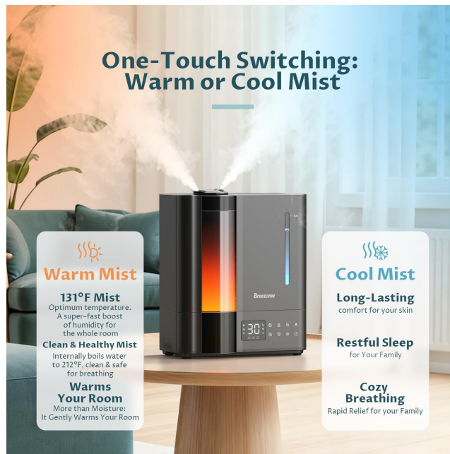
Image: The humidifier displaying both warm mist (orange light) and cool mist (blue light) options, highlighting its dual functionality.