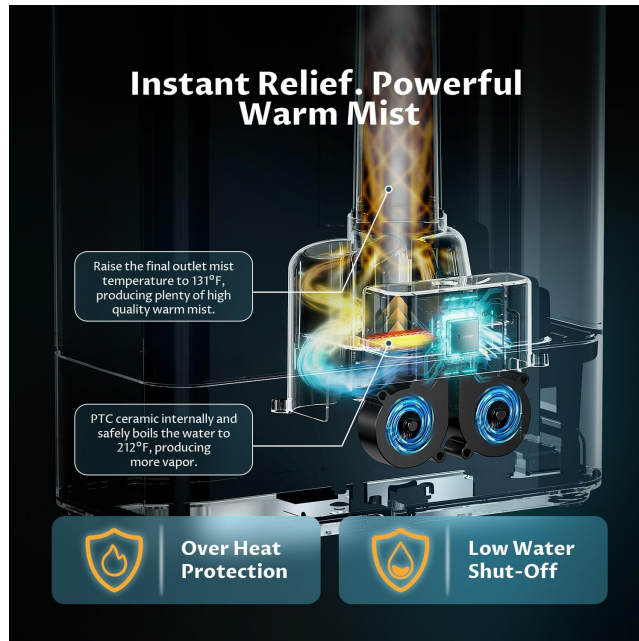
Image: An internal diagram of the humidifier illustrating the PTC ceramic heating element boiling water to 212°F to produce warm mist.