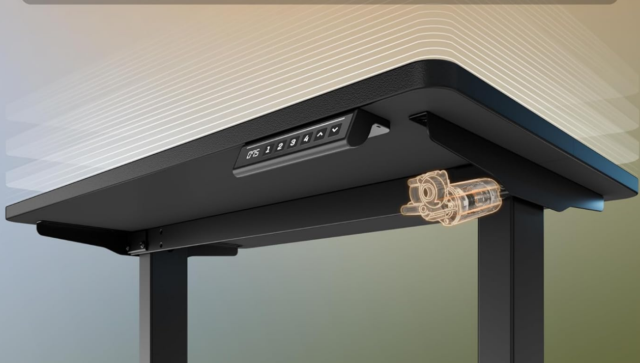
Image: A visual comparison demonstrating the ease of the desk's smart one-press lift system compared to traditional manual knob controls.