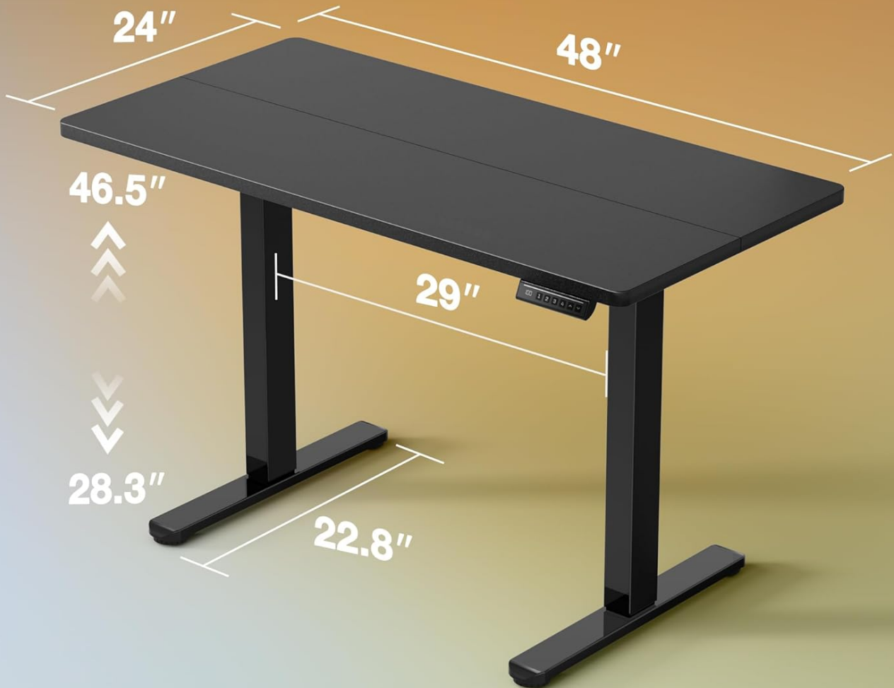
Image: A detailed diagram illustrating the dimensions of the desk, including height range (28.3" to 46.5"), width (48"), and depth (24").