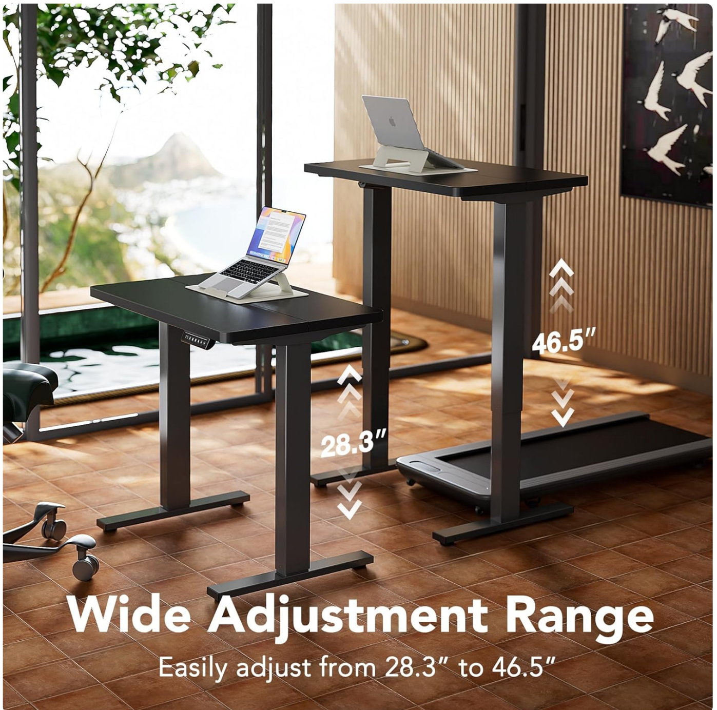
Image: Visual representation of the desk's height adjustment capabilities, demonstrating its range from a seated position (28.3") to a standing position (46.5").