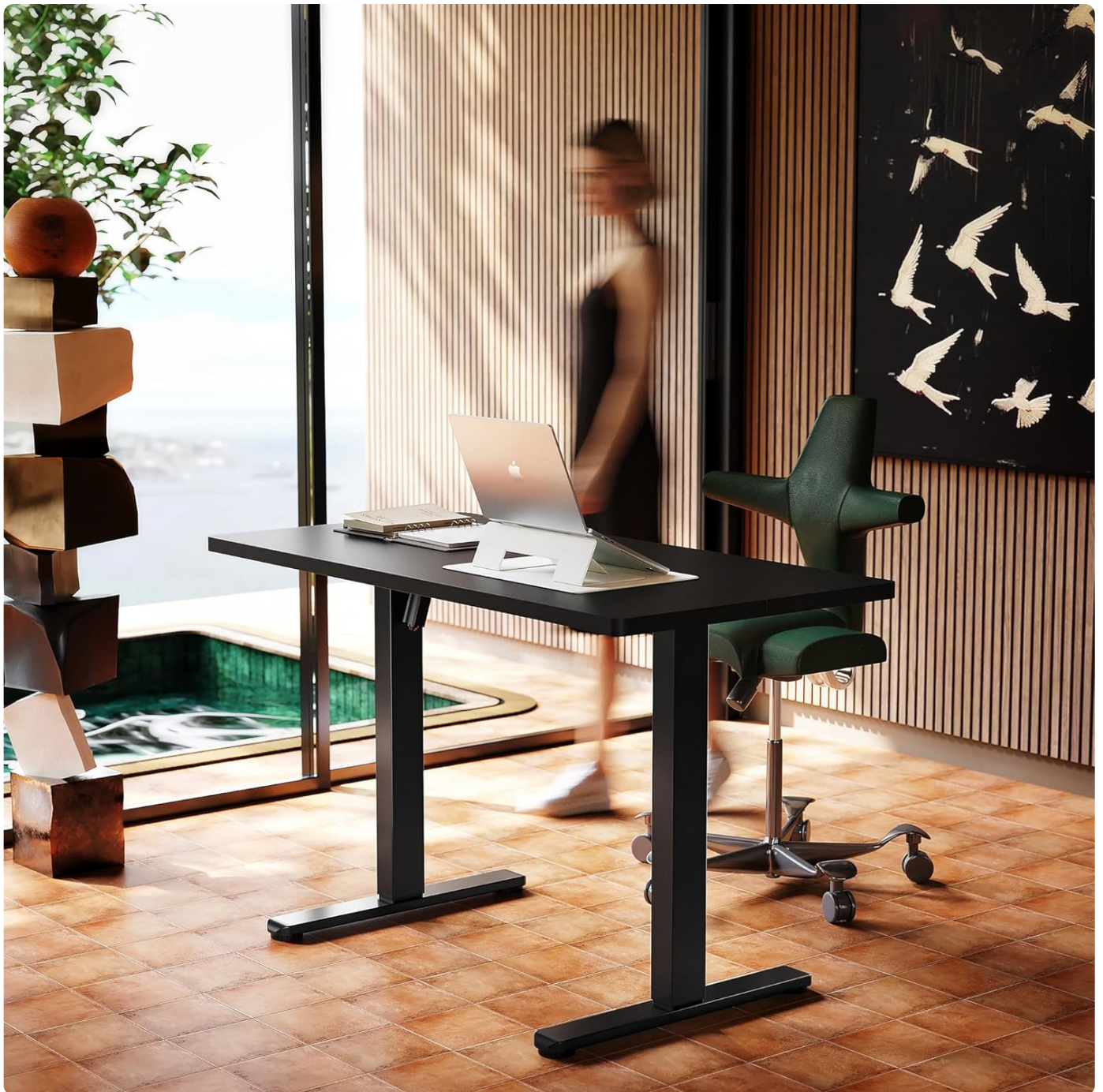
Image: The HUANUO Electric Standing Desk, showcasing its sleek design and integration into a contemporary workspace.