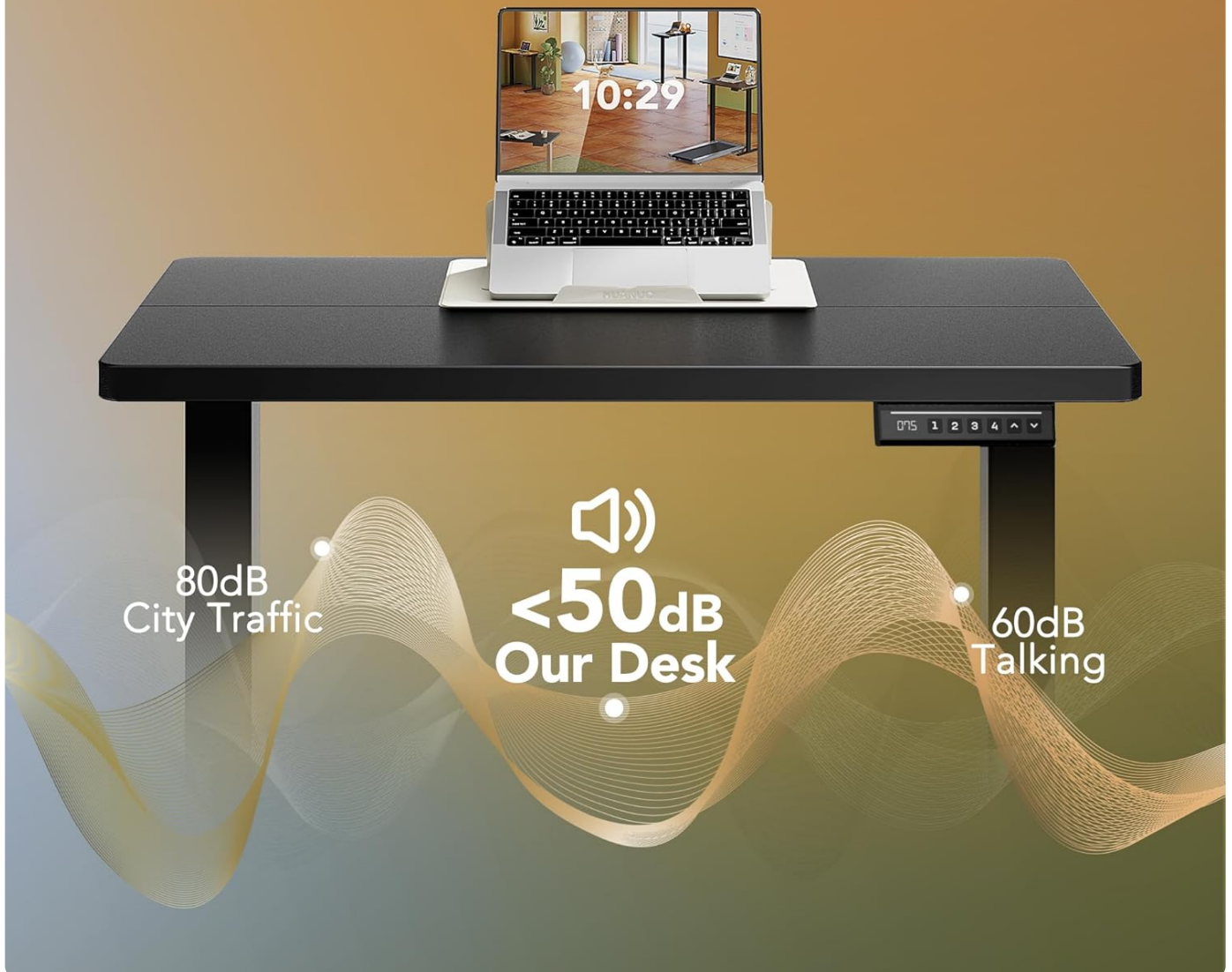
Image: A graphic illustrating the ultra-quiet performance of the desk, comparing its sound level (less than 50dB) to common environmental noises like city traffic and talking.

keep you in the zone without distractions