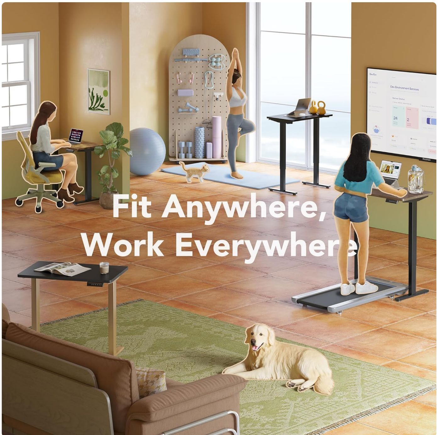
Image: A collage of images demonstrating the versatility of the HUANUO Electric Standing Desk, showing it integrated into various home and office settings, including a yoga space and a treadmill workstation.