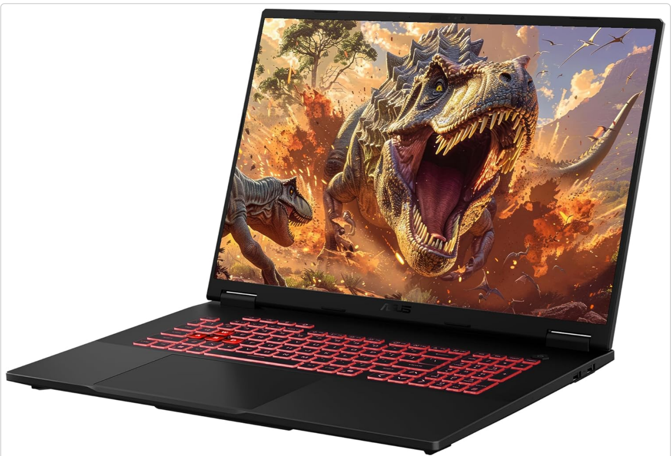
Image: Side view of the ASUS TUF A18 laptop, highlighting the power jack and various connectivity ports for easy identification.

Connect the power adapter to the ASUS Slim Power Jack on the laptop's side and then plug it into a functional power outlet. The laptop can be used while charging.