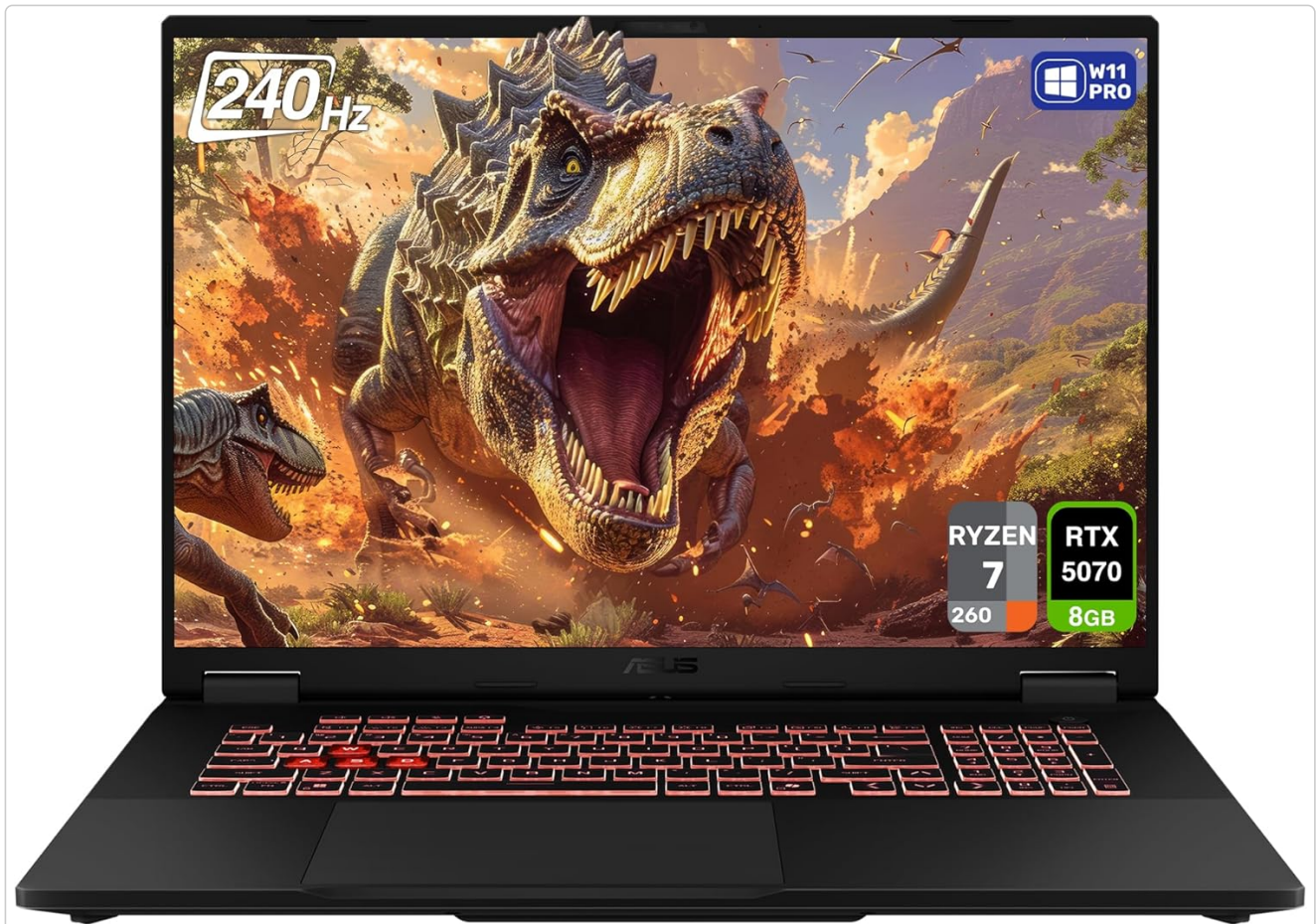
Image: The ASUS TUF A18 Gaming Laptop, showcasing its sleek design and large display.

The ASUS TUF Gaming A18 is engineered for high performance and durability. This gaming laptop features a robust design, an expansive 18-inch WQXGA (2560x1600) display with a 240Hz refresh rate, and advanced thermal management. It integrates Dolby Atmos and Hi-Res Audio for an immersive sound experience.