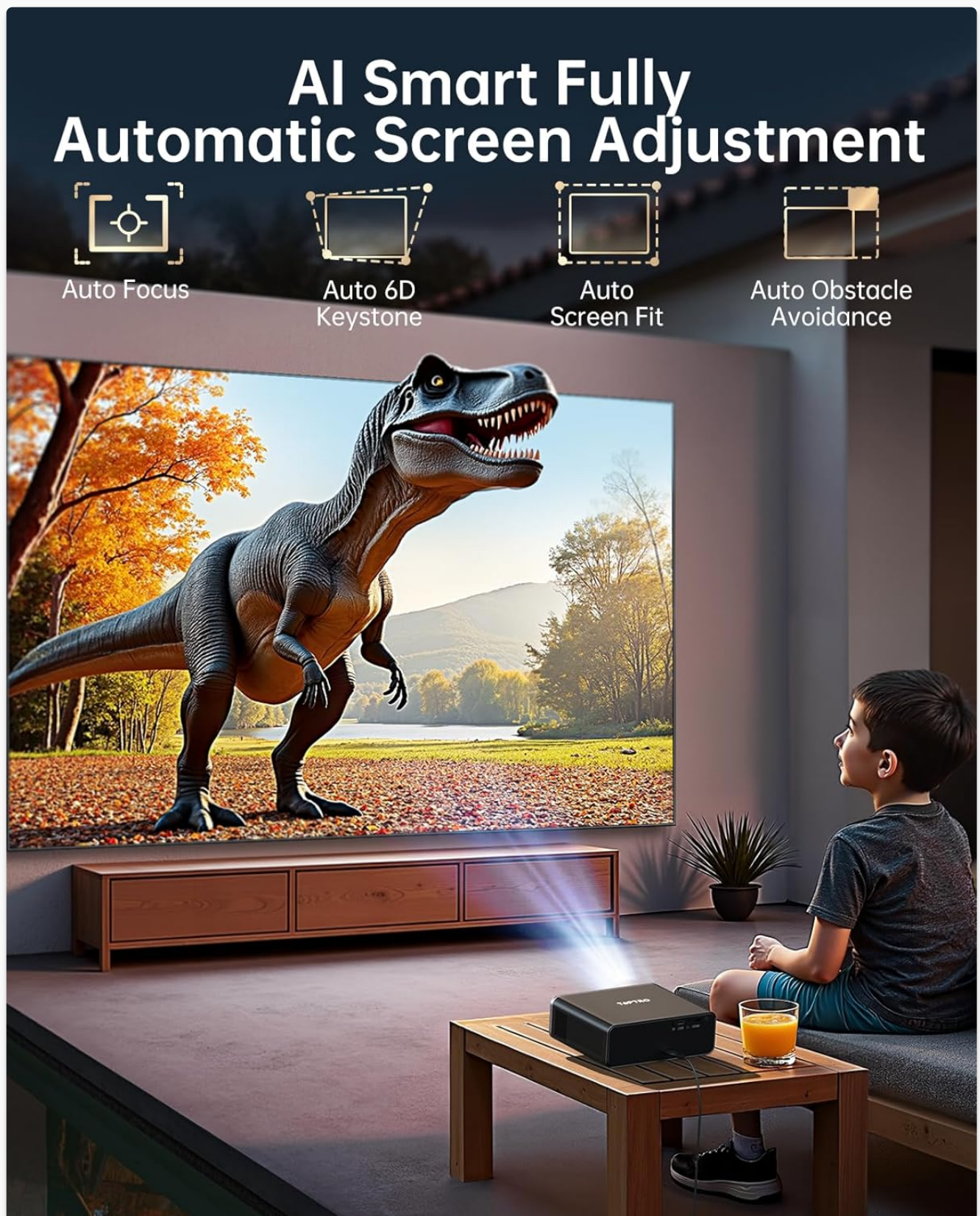
Image 2.1: Visual representation of the AI auto-adjustment capabilities.

These adjustments occur automatically upon startup or when the projector is moved, providing a clear image in approximately 1 second.