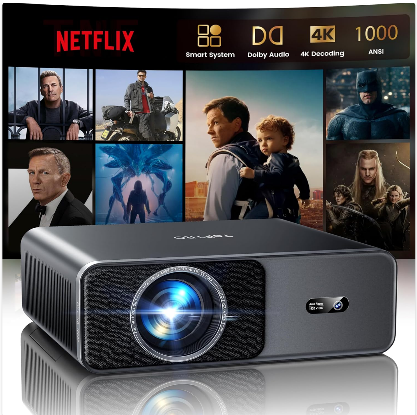
Image 1.1: TOPTRO A1 Smart Projector displaying a streaming service interface.