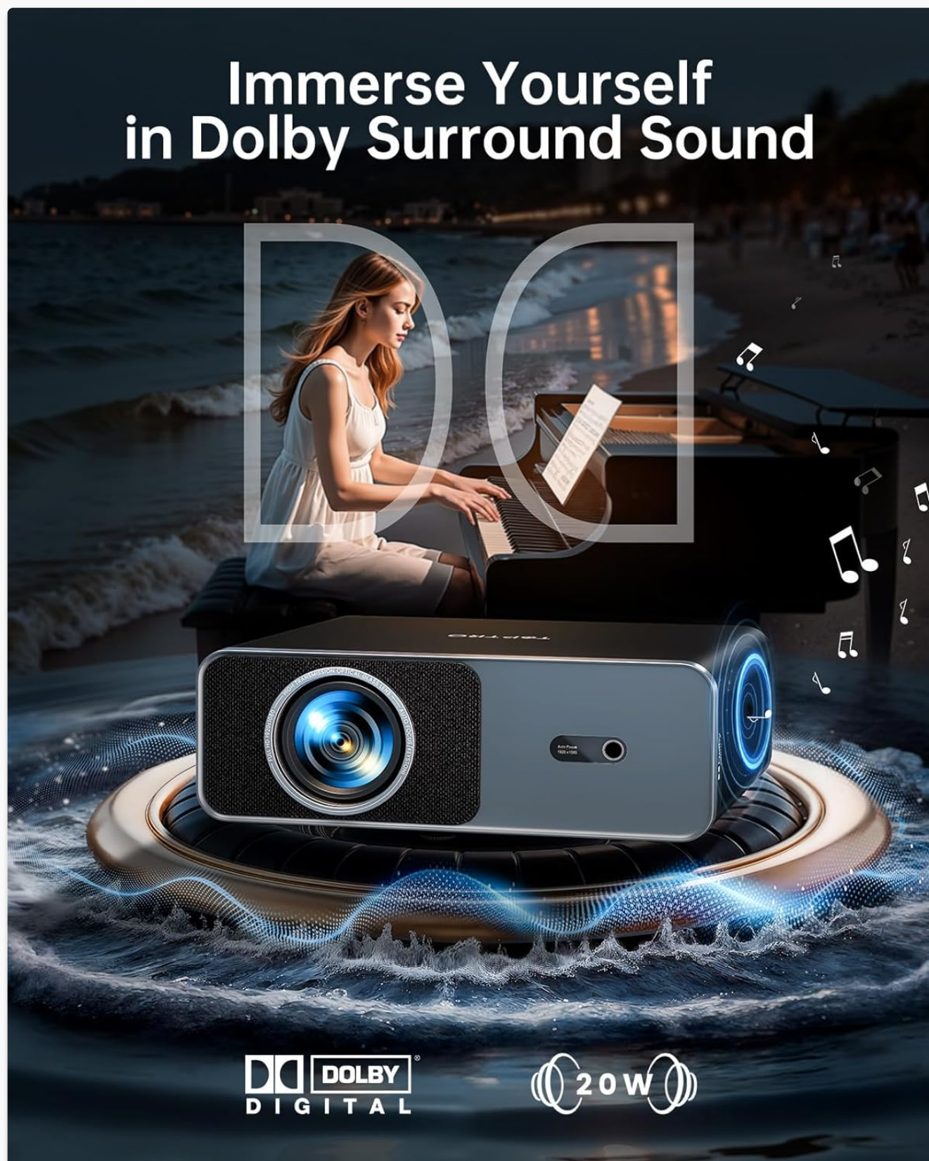
Image 3.3: Projector highlighting its Dolby Audio and 20W speaker capabilities.

Equipped with powerful 20W speakers and Dolby Audio technology, the projector provides an immersive 3D sound experience. Advanced AI sound balance ensures clear vocals and natural instrumental sound. The two-way Bluetooth functionality allows it to function as a standalone speaker.