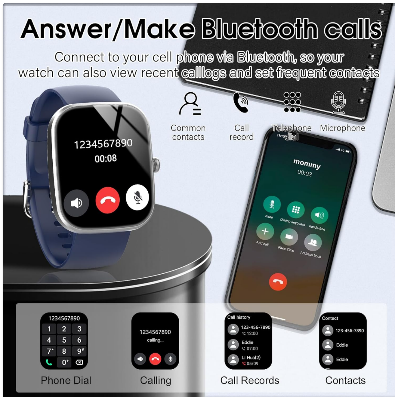
Image: Smartwatch interface for making and answering calls.