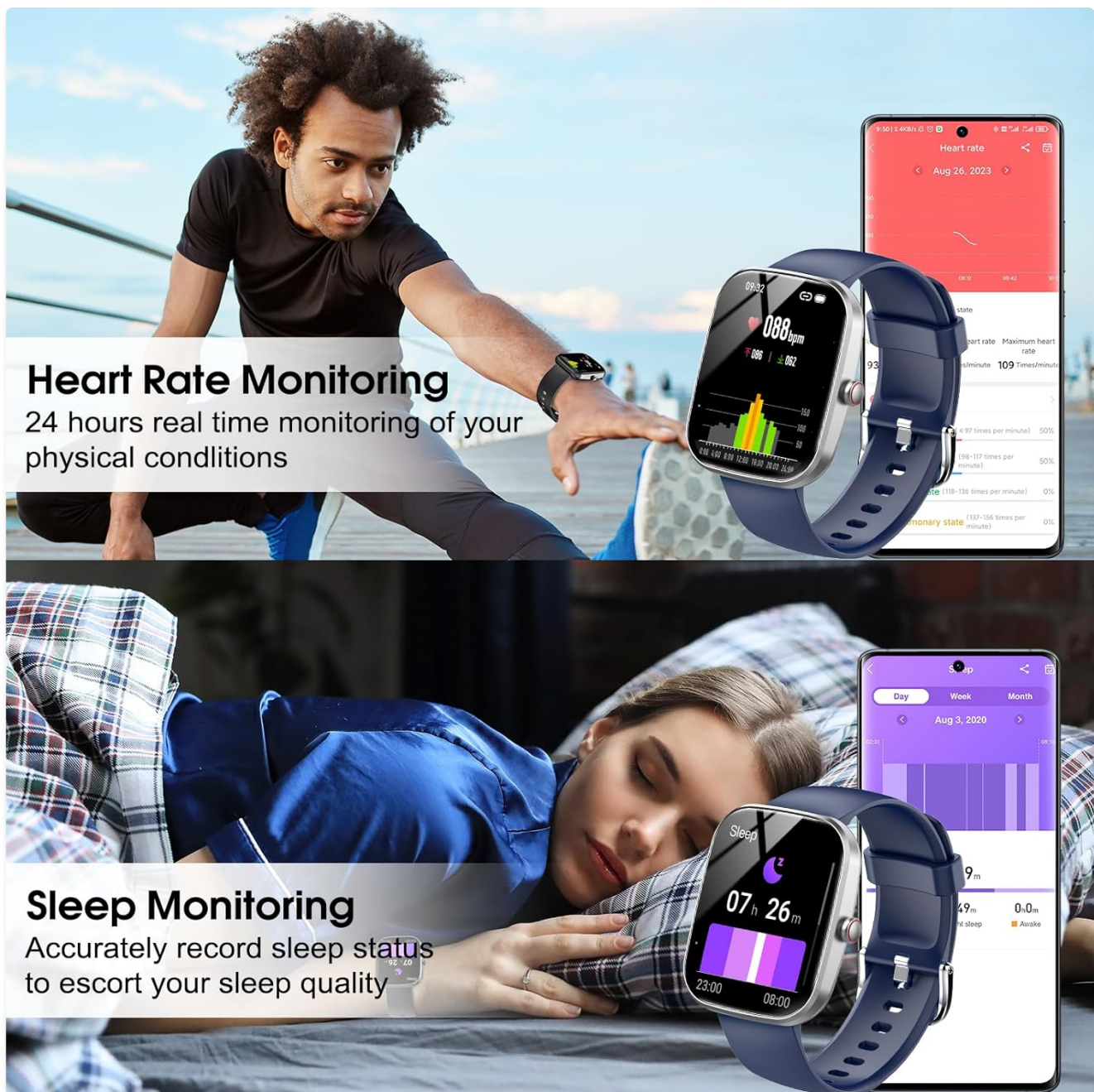
Image: Heart rate and sleep monitoring features.