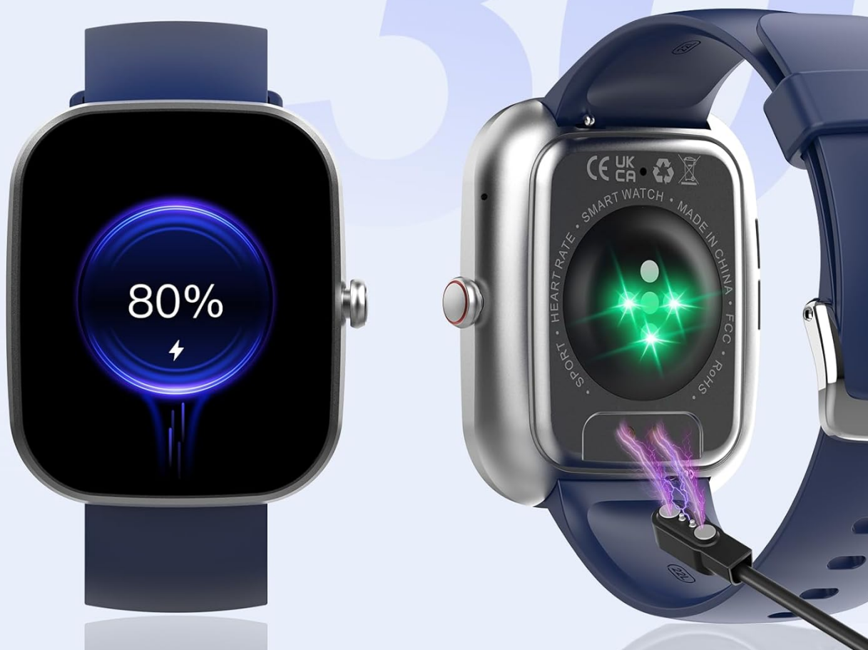
Image: Smartwatch connected to its magnetic charger.