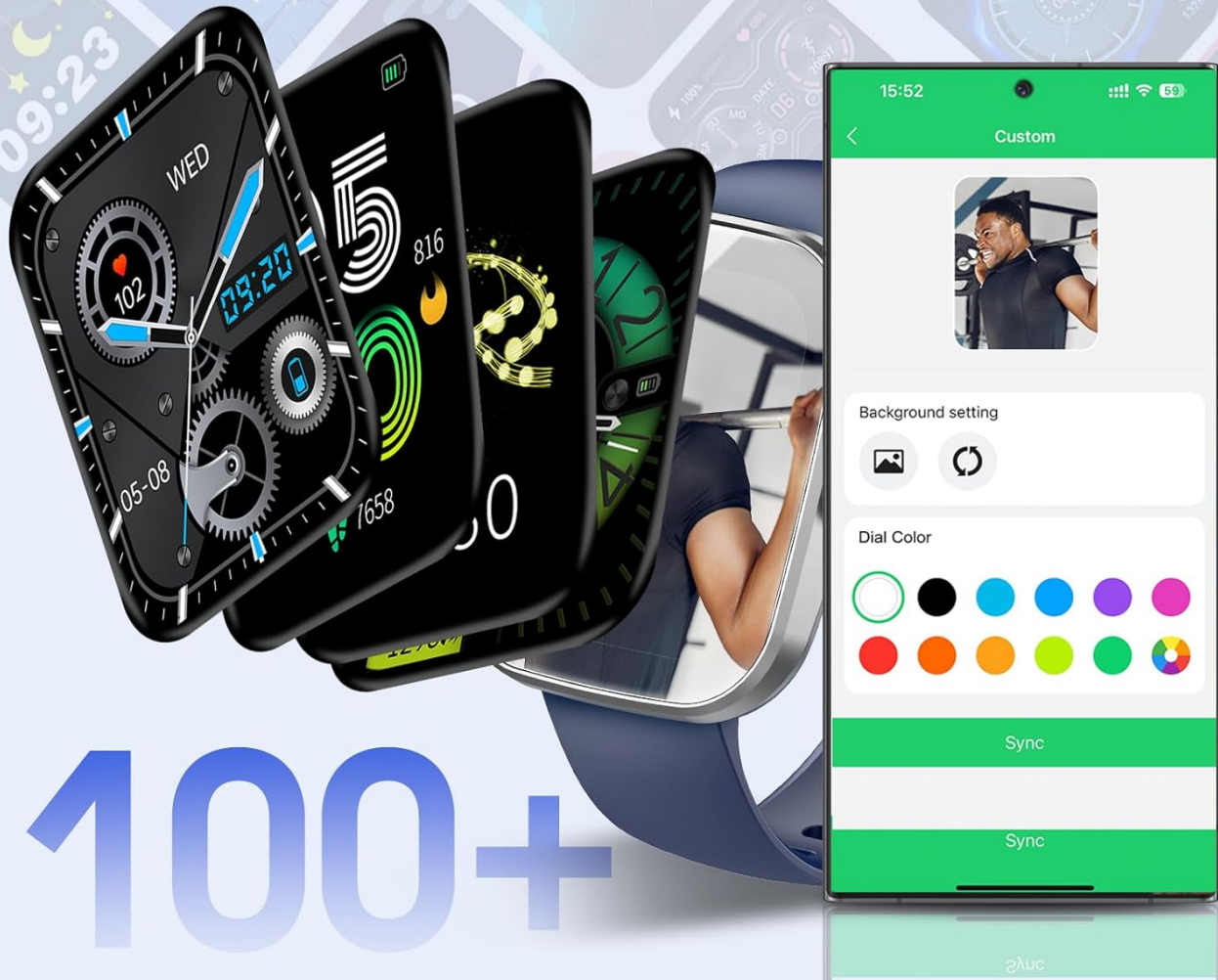
Image: Customizable watch faces and app interface.

Built in 100+ Watch faces in GloryFit app detachable watch band DIY your smartwatch wallpaper