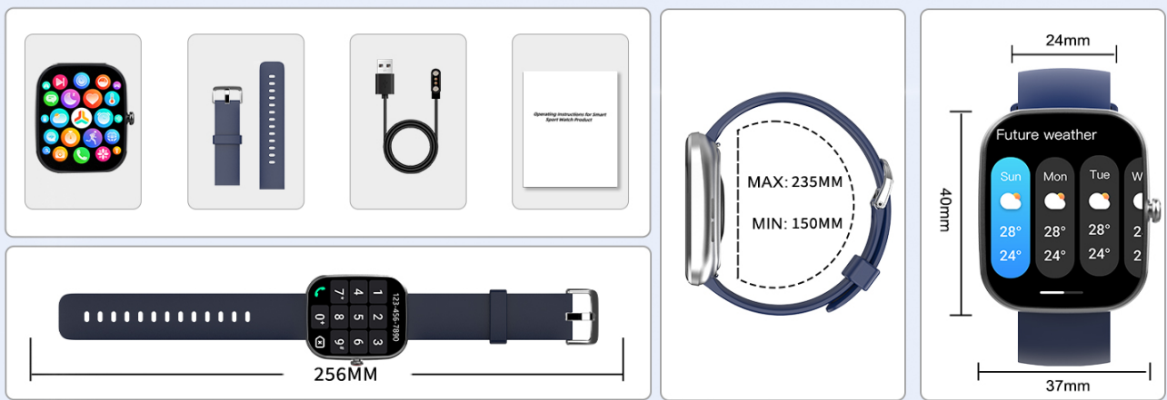
Image: Contents of the Csasan Smart Watch T70 package.