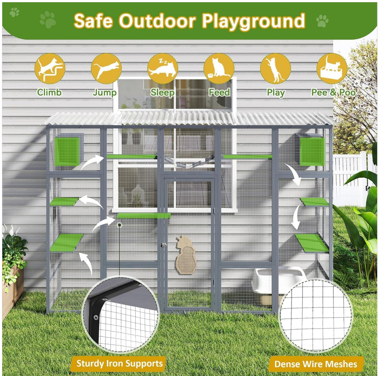
Image 5.2: The catio provides a safe outdoor playground with sturdy iron supports and dense wire meshes, featuring multiple levels for activity.