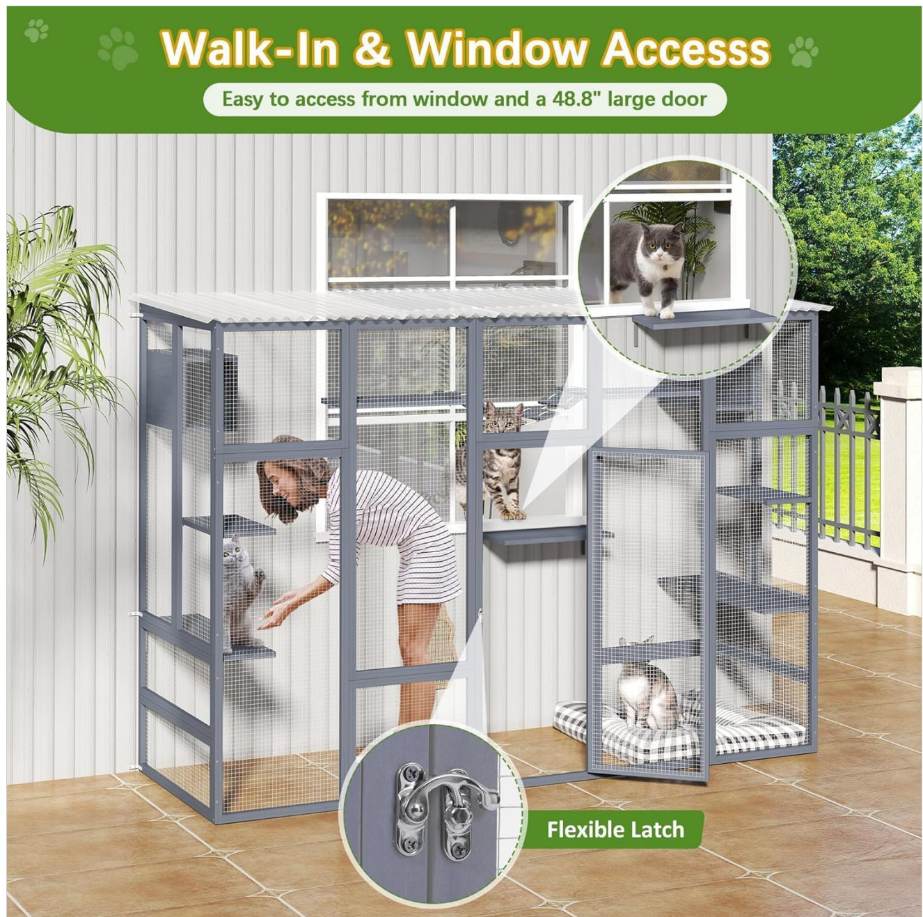
Image 5.1: The catio features a large walk-in door and a window access point for convenient interaction and pet entry/exit.

The catio is designed to connect to your house's window, allowing your cats safe and easy access to the outdoor enclosure. Ensure the window connection is secure and free of gaps to prevent escape or entry of unwanted animals.