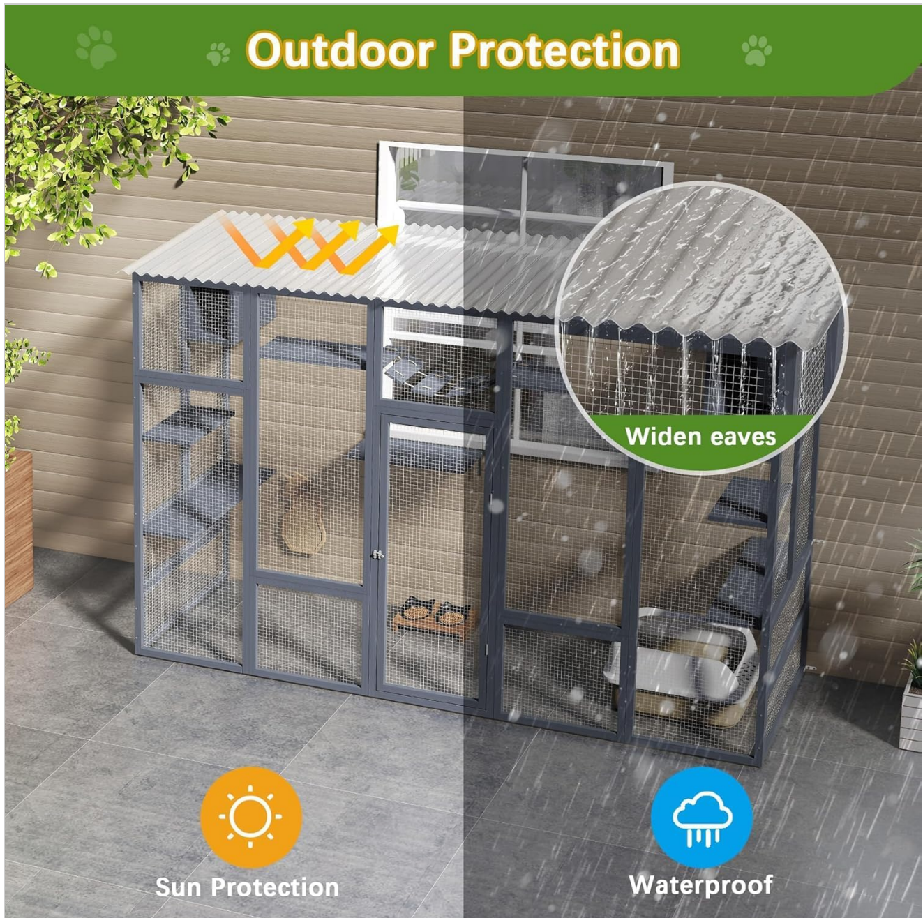
Image 6.1: The PVC roof offers protection from sun and rain, ensuring a comfortable environment for your cats.

Video 6.2: This video highlights the asphalt roof feature of a catio, providing insight into weather protection.