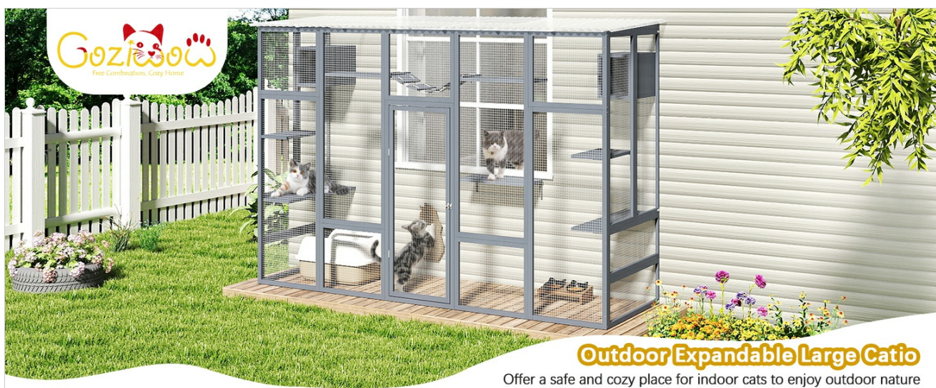
Image 1.1: The COZIOWOW 104-inch Large Outdoor Cat Enclosure providing a safe outdoor space for cats via window access.

Thank you for purchasing the COZIOWOW 104-inch Large Outdoor Cat Enclosure. This manual provides essential information for the safe assembly, operation, and maintenance of your new catio. Designed to connect to your home's window, this spacious enclosure offers a secure outdoor space for multiple cats to enjoy fresh air and sunlight. Please read these instructions carefully before assembly and retain them for future reference.