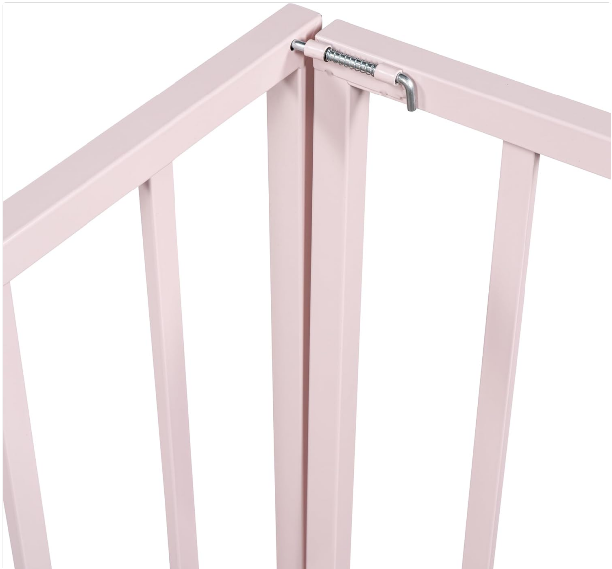
Image: A detailed view of the latch mechanism on the bed frame's door. The sliding bolt ensures the door remains securely closed when engaged, providing a safe enclosure.