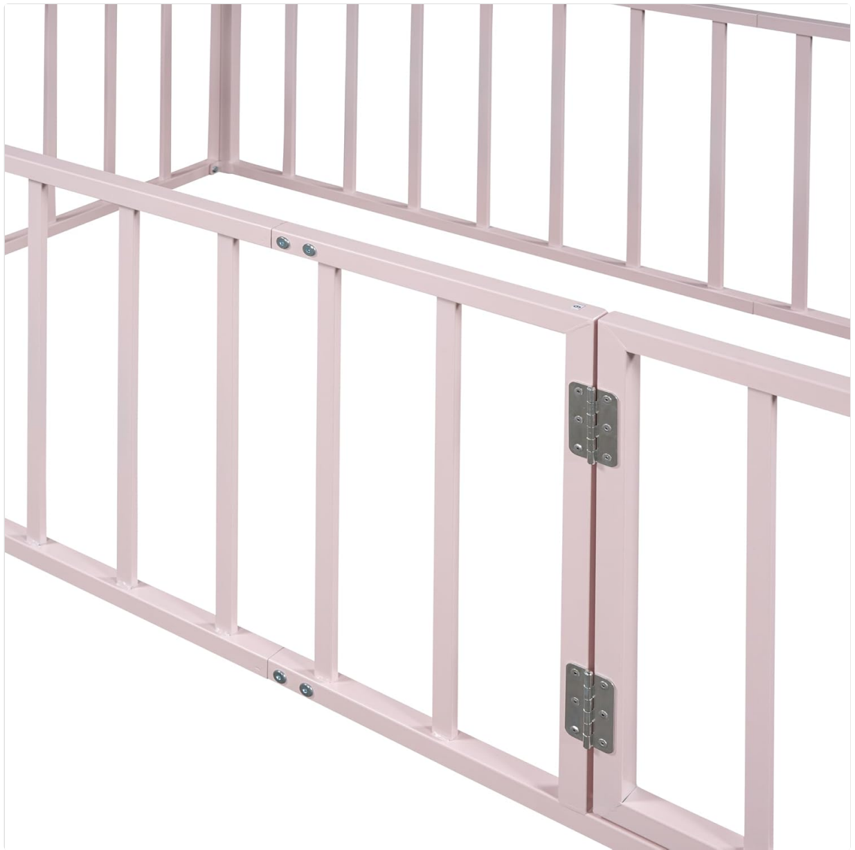
Image: A close-up view of the hinges on the bed frame's door. This detail shows how the door is attached to the main frame, indicating a secure and functional pivot point for opening and closing.