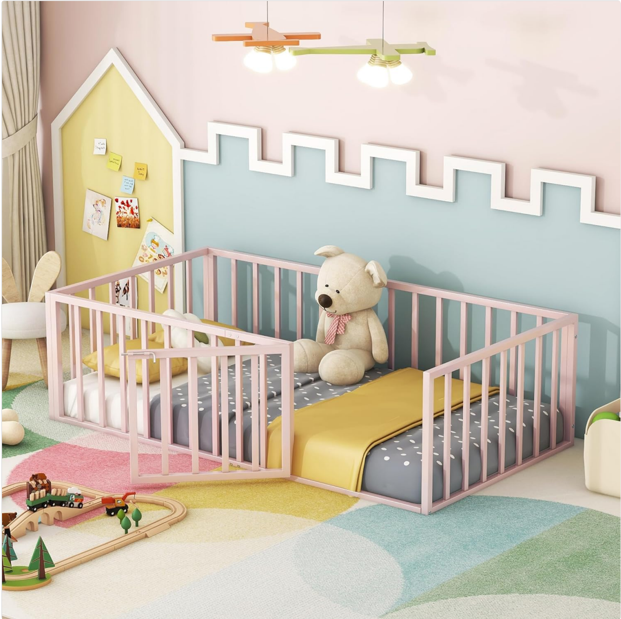
Image: The MERITLINE Twin Floor Bed Frame, shown in a child's bedroom setting with a mattress and bedding. The pink metal frame features guardrails on all sides and a small door at the front, providing a safe and accessible sleeping area.