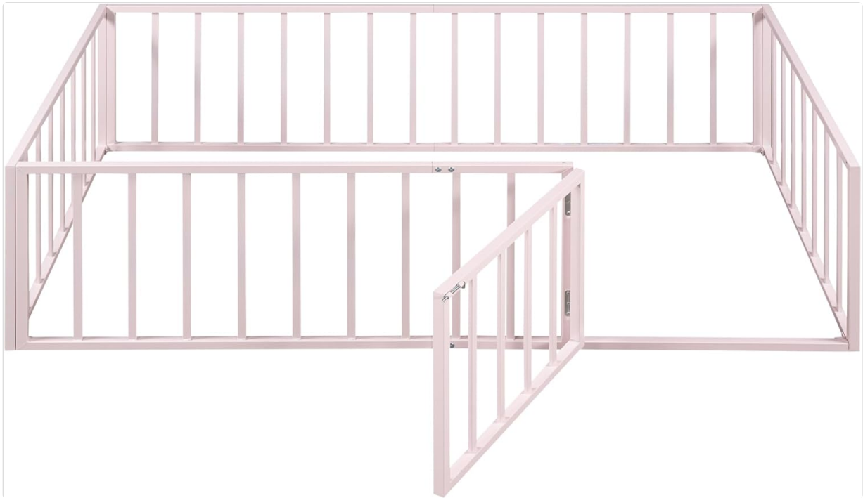
Image: The MERITLINE Twin Floor Bed Frame with its door in the open position. This demonstrates the accessibility feature of the bed, allowing easy entry and exit.