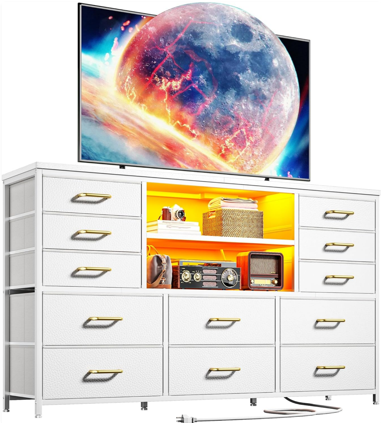
Front view of the Romorgniz 12-Drawer TV Stand, featuring a white finish, 12 fabric drawers, two open central shelves with LED lighting, and a top surface suitable for a television.