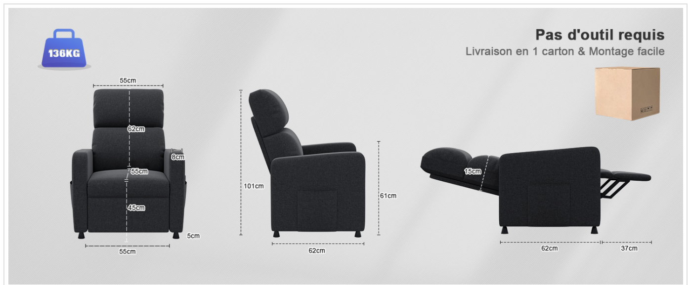
Image showing the recliner's dimensions, 136kg weight capacity, and indicating delivery in one carton with easy assembly.

Note: The recliner is delivered in one carton and requires assembly.