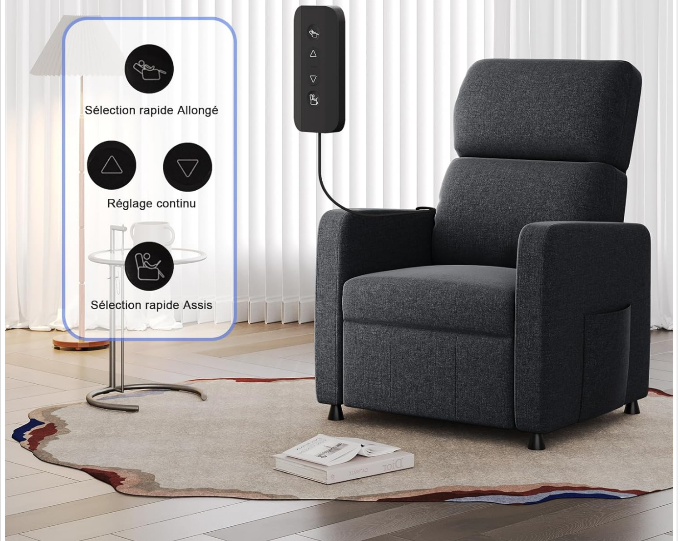
Image illustrating the remote control for the electric recliner, with buttons for continuous adjustment and quick selection for sitting or lying down positions.

Que ce soit pour un réglage continu ou une sélection rapide assis/allongé