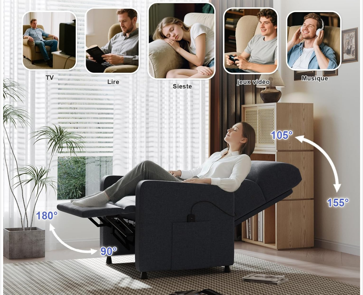
Image showing different scenarios for using the recliner, including watching TV, reading, napping, playing video games, and listening to music, with angle indicators.