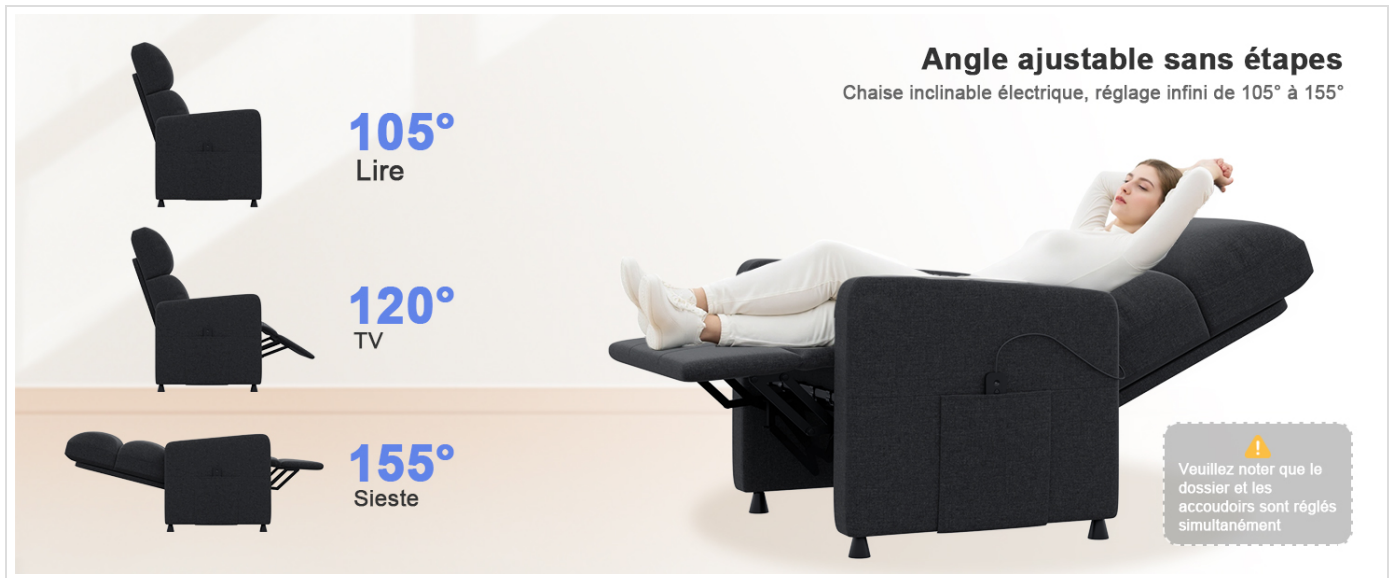
Image demonstrating the adjustable angles of the electric recliner: 105° for reading, 120° for TV, and 155° for napping. It also notes that the backrest and armrests adjust simultaneously.