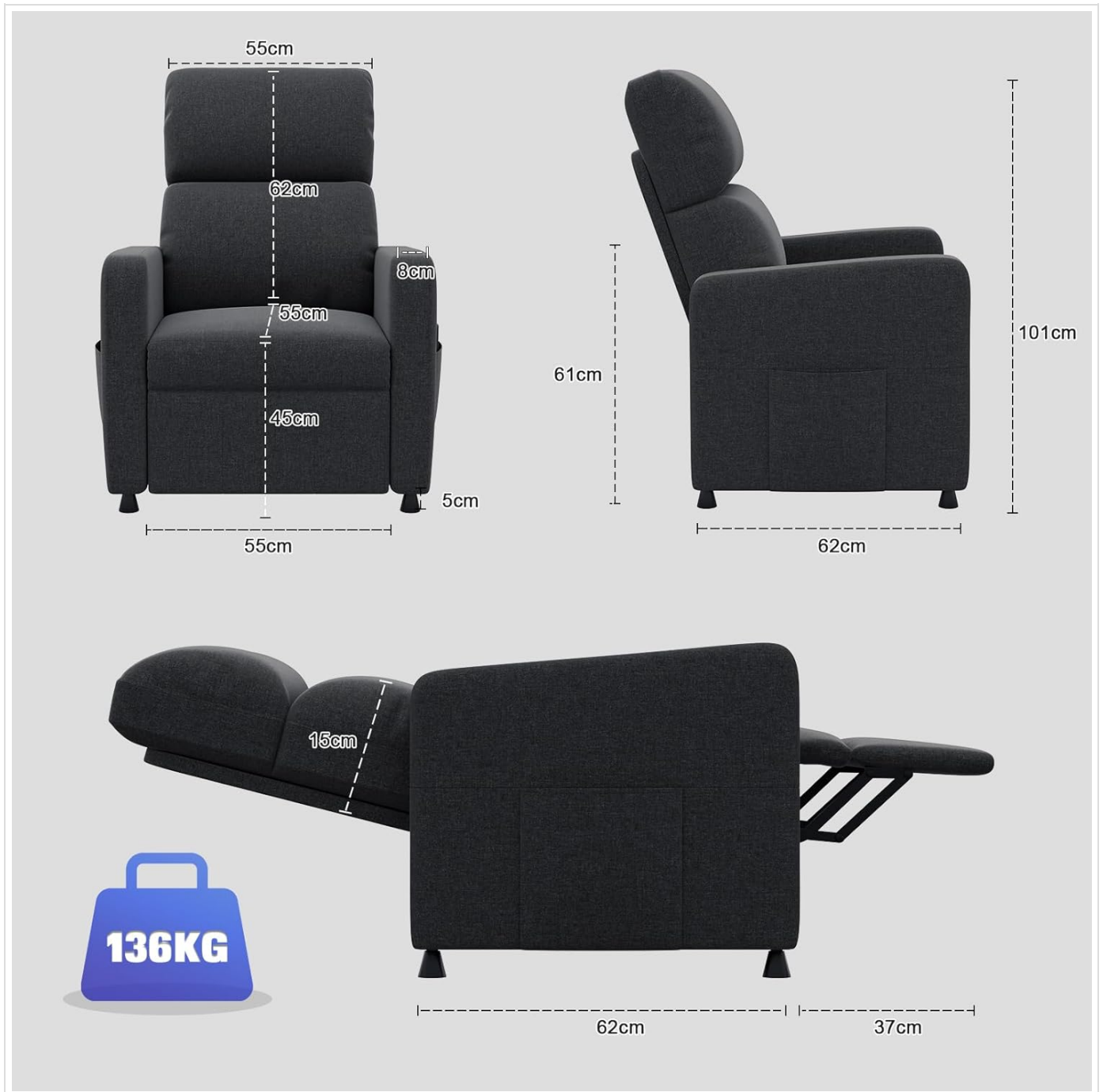
Image displaying detailed measurements of the recliner in both upright and fully reclined positions, including seat depth, backrest height, and overall length when extended.