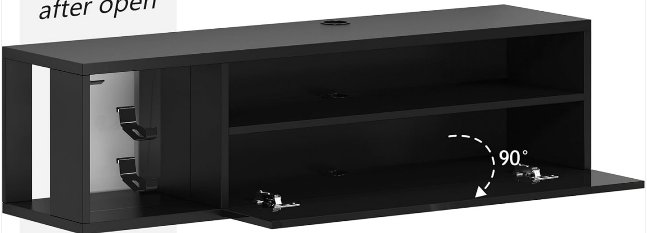
Image: The hidden locker compartment with a flip-down door. The top view shows the door closed, and the bottom view shows it open, revealing internal storage and an adjustable shelf.