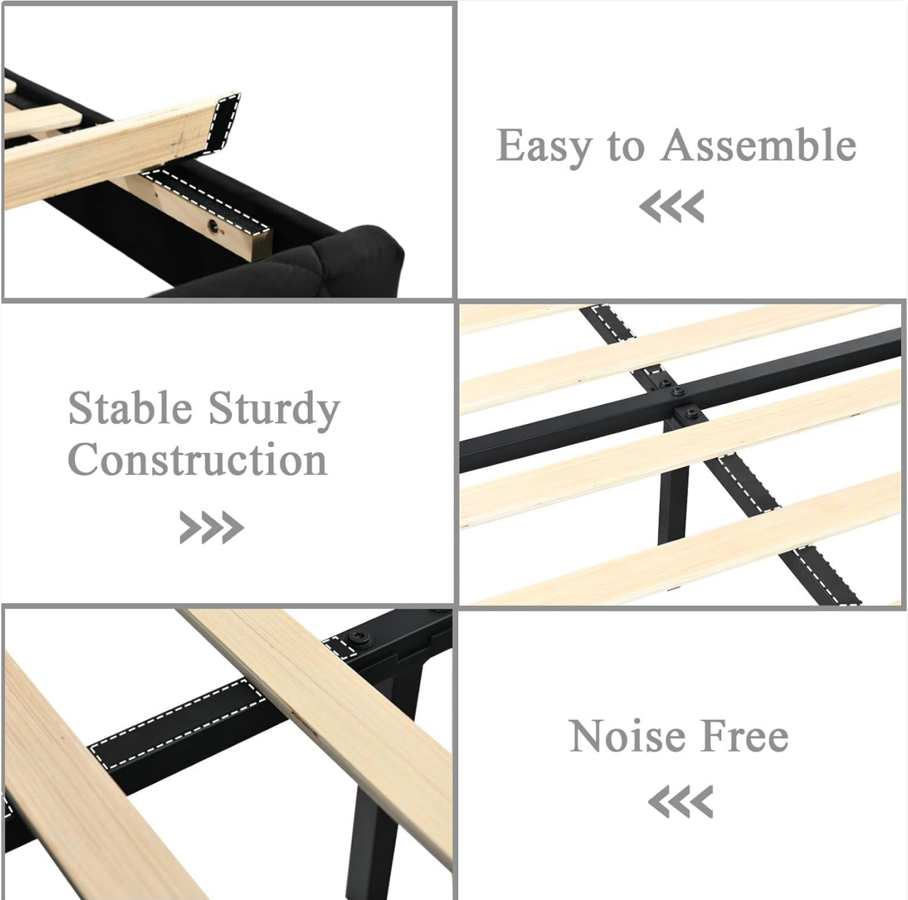
Figure 2: Key Assembly and Structural Features

Follow the step-by-step instructions provided in your product's assembly guide. Ensure all bolts are securely tightened, but do not overtighten until all components are aligned. The bed frame features a stable, sturdy construction with wooden slats designed for direct mattress support, eliminating the need for a box spring.