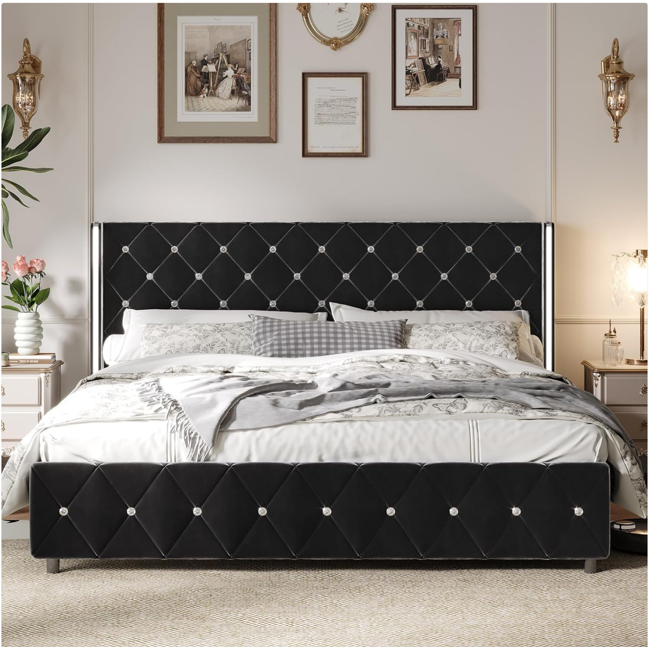
Figure 1: HOMBCK King Size Velvet Upholstered Bed Frame