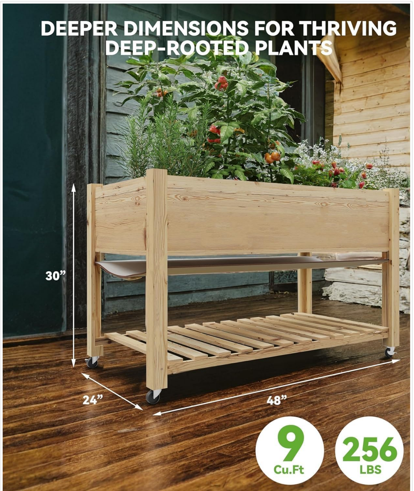
Image: Detail of the thick base and enhanced support for the planter box.