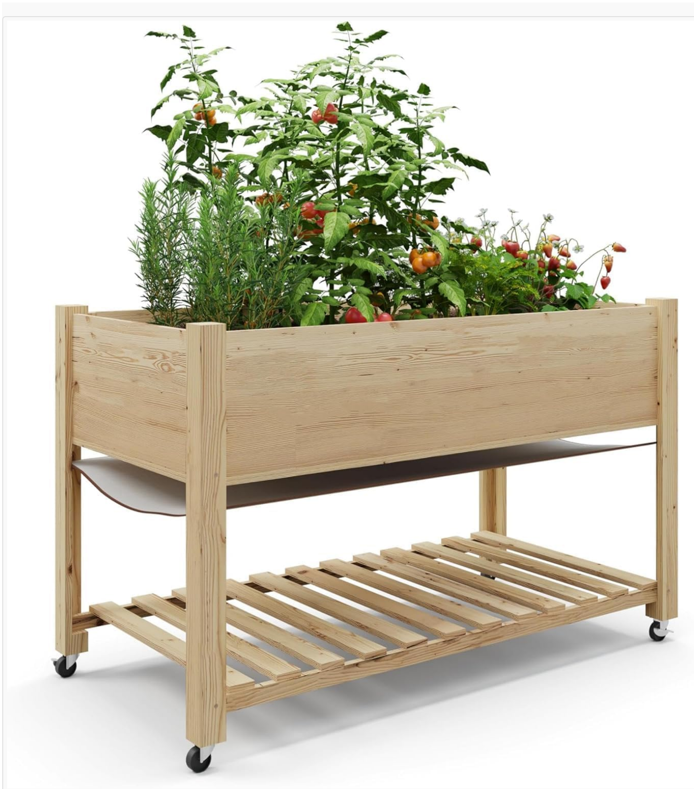
Image: A KYBOLT raised garden bed filled with thriving plants.