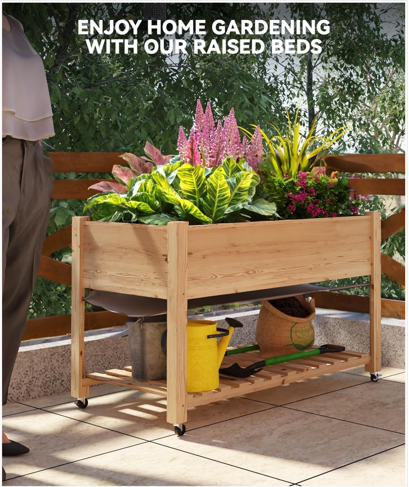
Image: Detail of the Oxford cloth liner, crucial for drainage and protecting the wood.