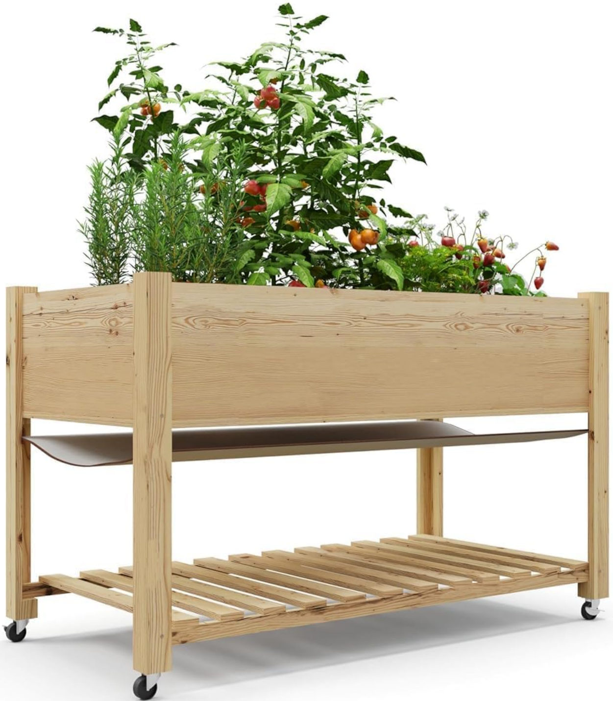
Image: Overview of key features including assembly, drainage, and plant protection.