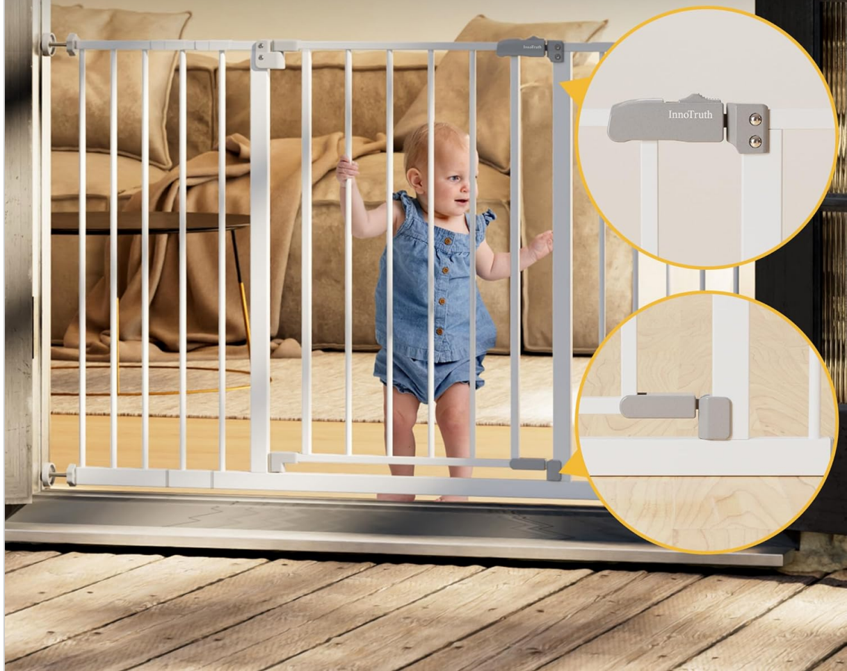
Image: A baby safely contained by the gate, with an inset showing the secure dual-lock design that prevents child opening.