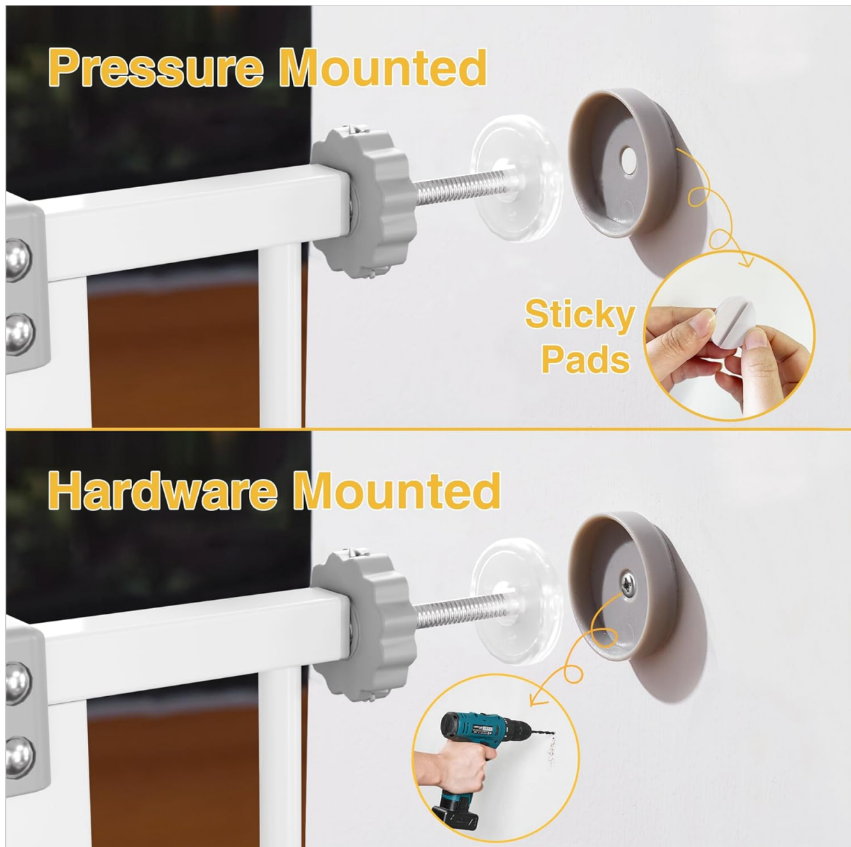
Image: Comparison of pressure mounted installation using sticky pads and hardware mounted installation requiring drilling.