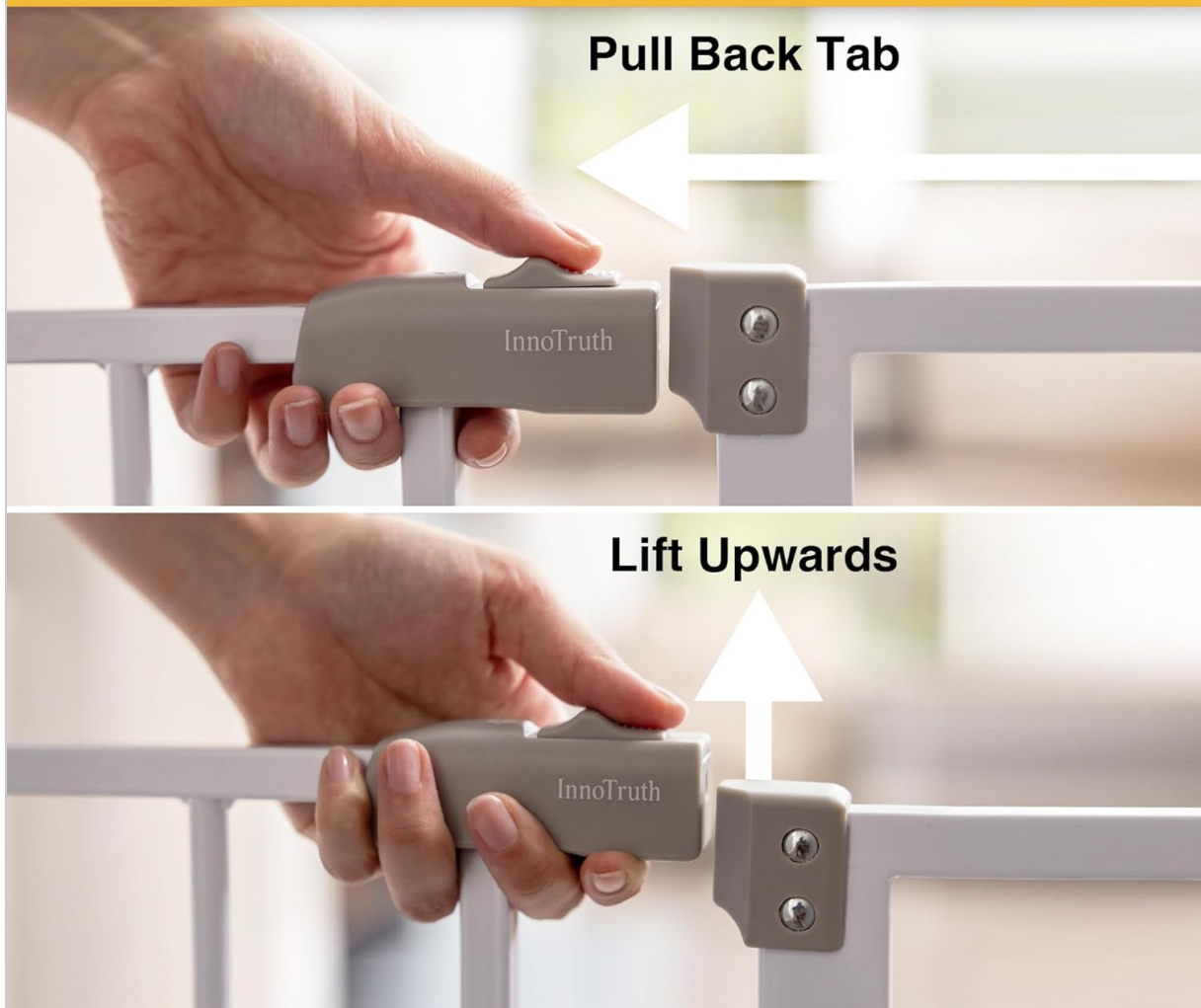
Image: Instructions for one-handed operation: pull back the tab and lift upwards to open the gate.

Video: Demonstrates the one-handed opening mechanism of the gate, showing how to slide and lift the latch.