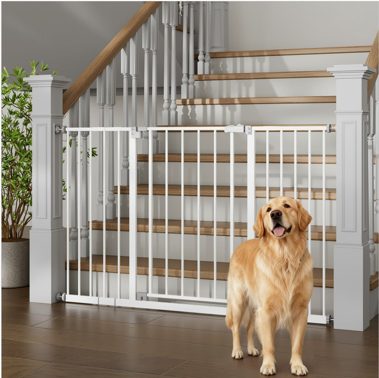
Image: The InnoTruth S3V2 Extra Wide Baby Gate installed in a doorway.