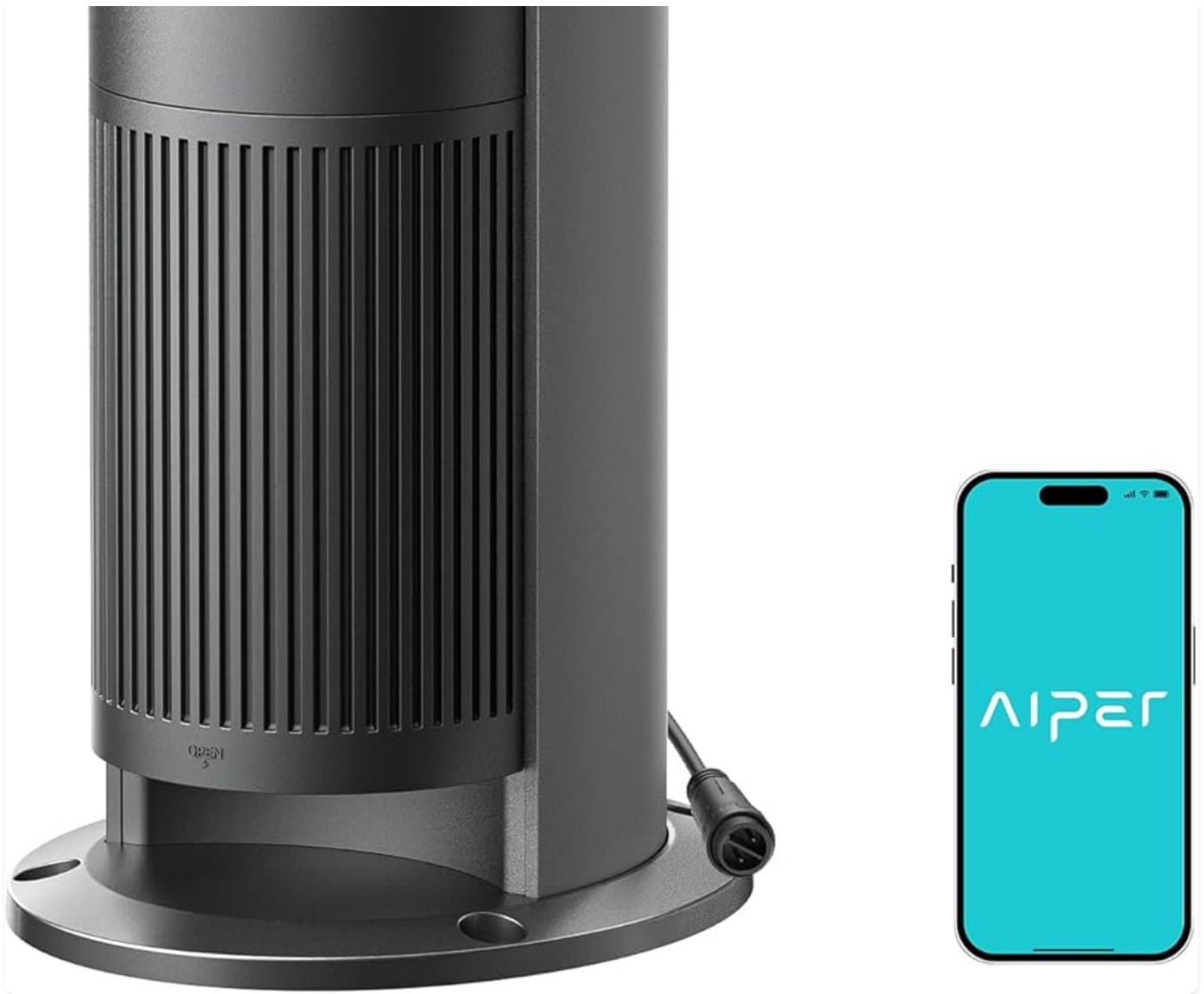
Figure 1: AIPER IrriSense Smart Irrigation System and companion app.