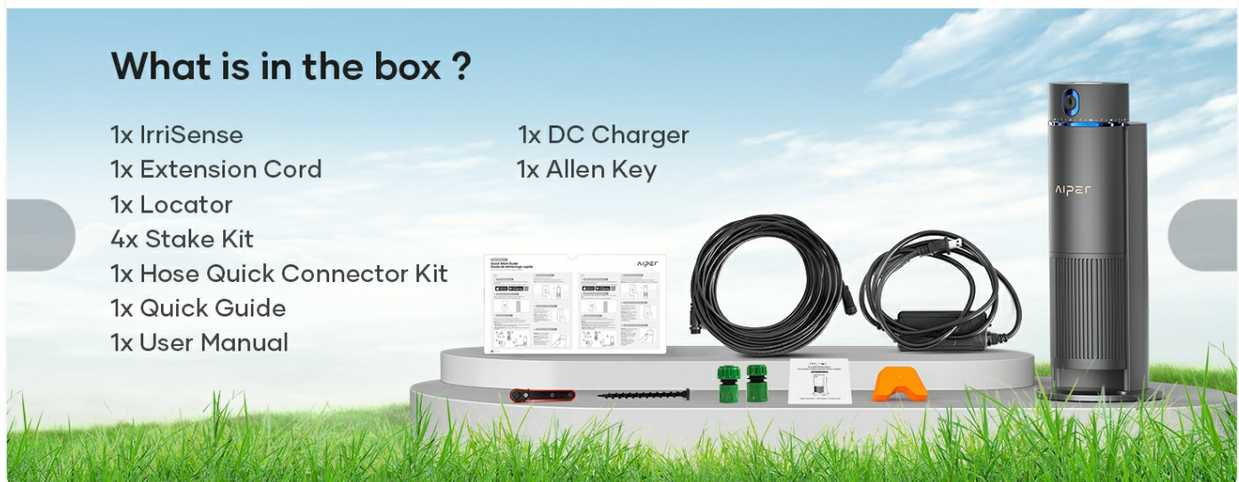
Figure 6: Box Contents.

Upon unboxing your AIPER IrriSense Smart Irrigation System, you should find the following components: