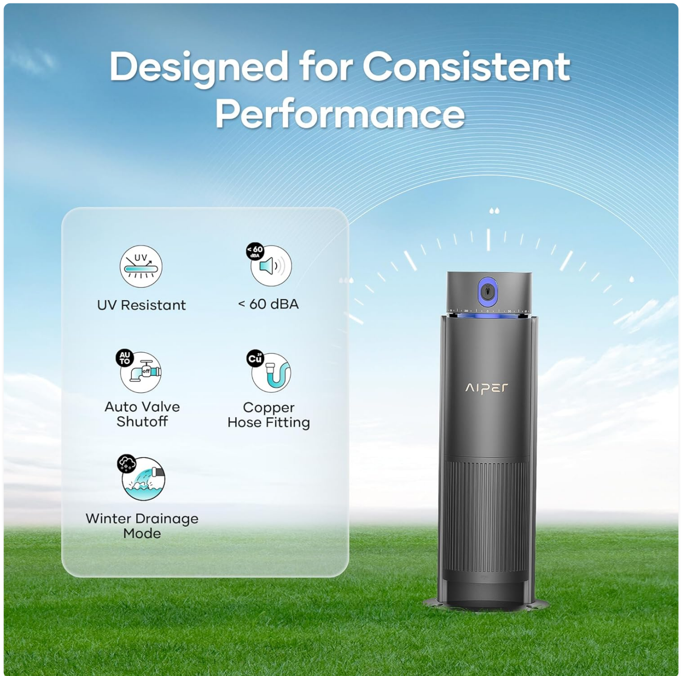
Figure 5: Designed for Consistent Performance and Durability.

manual for specific instructions on activating this mode before the first frost.