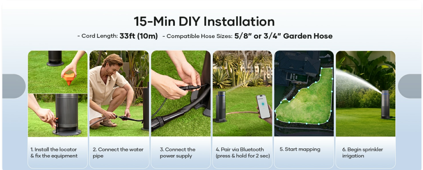
Figure 2: 15-Minute DIY Installation Guide.

The system requires a minimum water pressure of 45 PSI for optimal performance and coverage up to 4,800 sq. ft. with a 39 ft. spray range.