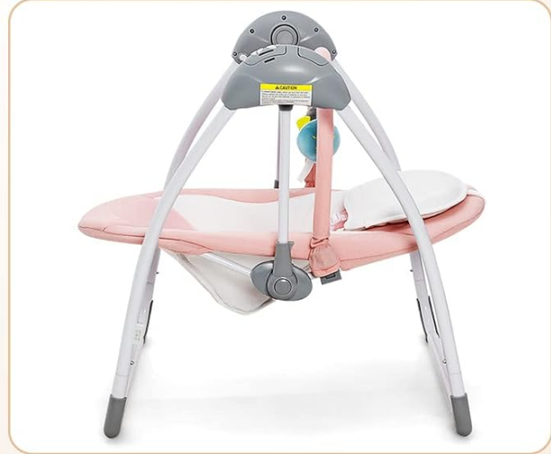
Figure 5: Adjusting Seat Position

This image demonstrates how to adjust the seat position of the INFANS Baby Swing. It shows a hand pressing buttons on the side of the seat to change its recline angle, allowing for a comfortable position for the baby.