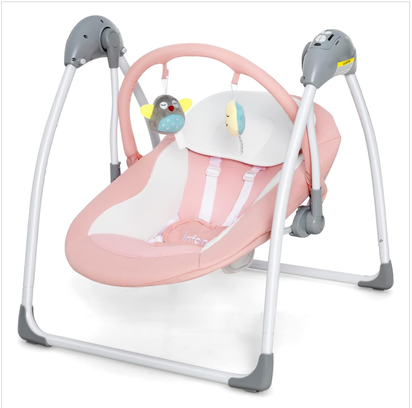
Figure 1: INFANS Baby Electric Swing and Rocker (Light Pink)

This image shows the INFANS Baby Electric Swing and Rocker in a light pink color. The swing features a comfortable seat with a headrest, a five-point harness, and an overhead toy bar with two hanging toys. The frame is white and grey, providing a stable base for the swing.