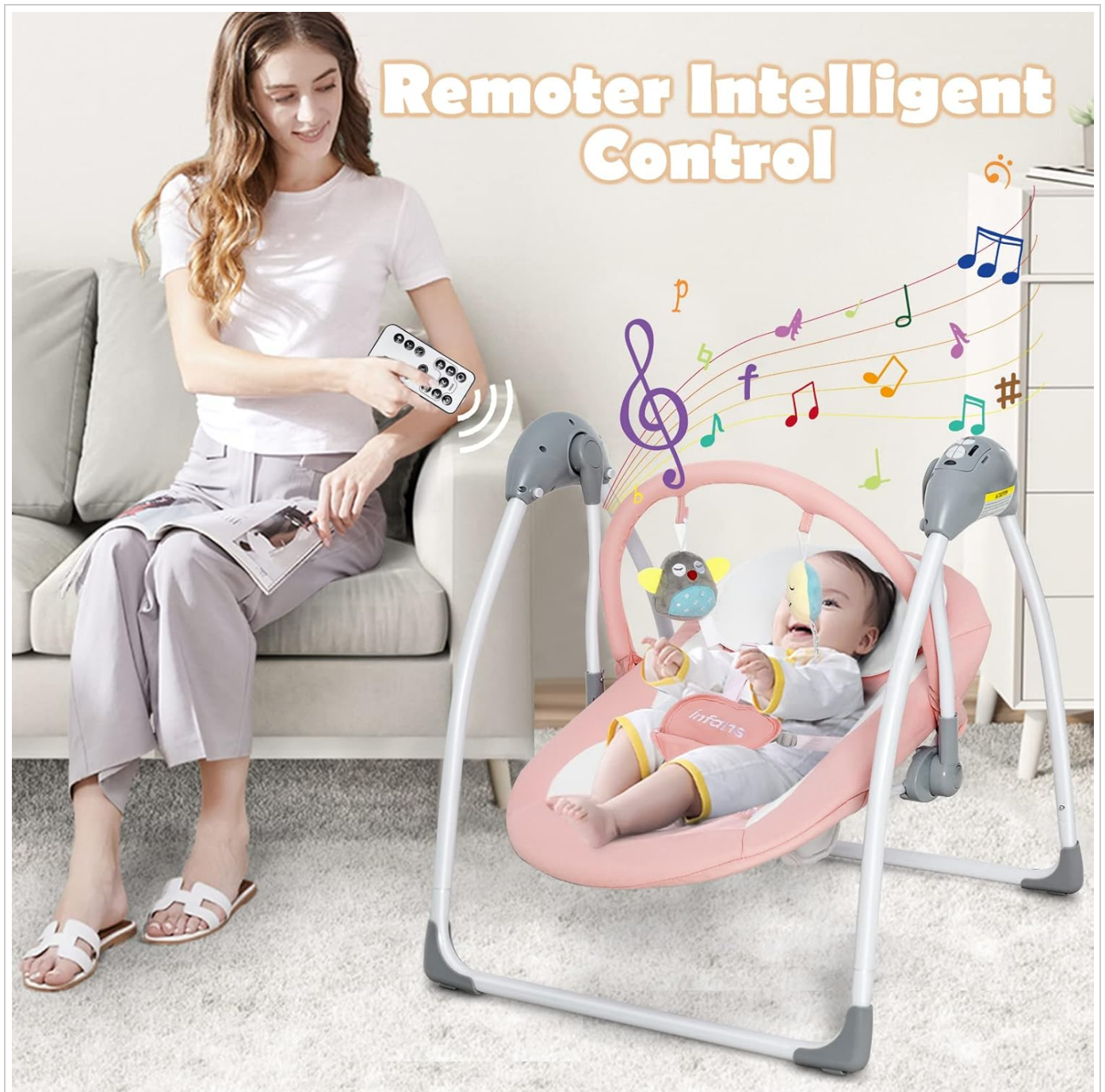
Figure 4: Remote Control Operation

This image shows a parent using the remote control to operate the INFANS Baby Swing, which is positioned next to a sofa. The remote allows for convenient adjustment of swing settings and music, enhancing user experience.