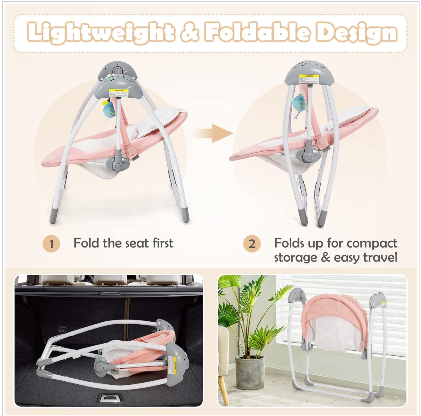
Figure 2: Foldable Design for Storage and Travel

This image illustrates the foldable design of the INFANS Baby Swing. It shows the swing in its upright, assembled position and then folded flat for compact storage or easy transport in a car trunk. This highlights the product's portability feature.