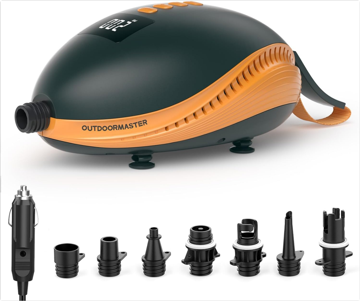
Image: The OutdoorMaster Dolphin Electric SUP Pump, its hose, 12V car connector, and a selection of nozzle attachments.