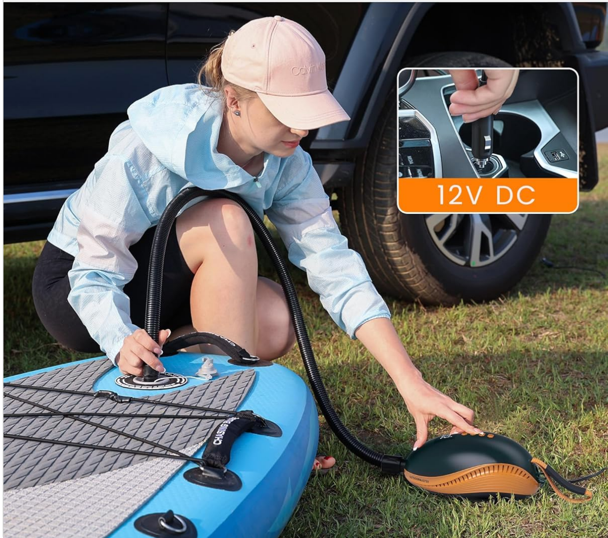
Image: Connecting the pump to a 12V DC car power source.

ENSURE THE AIR NOZZLE IS SEALED TARGET PRESSURE PROGRAMMABLE