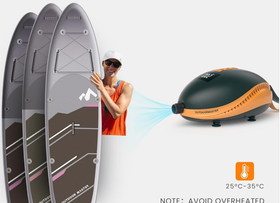
Image: The Dolphin pump demonstrating its capability to inflate multiple SUPs consecutively.