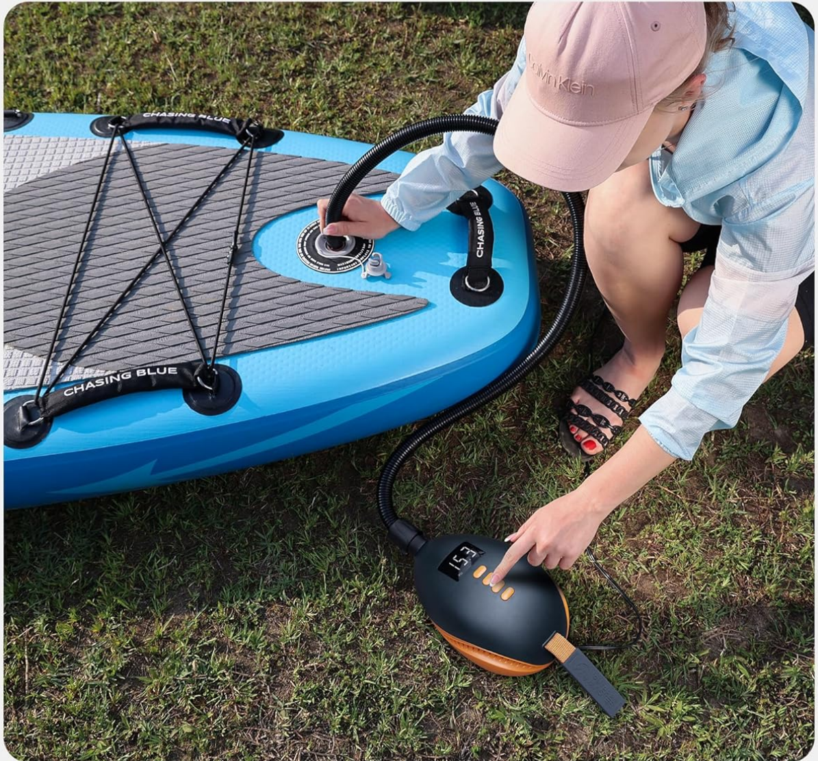
Image: Setting the desired pressure and monitoring inflation on the digital display.