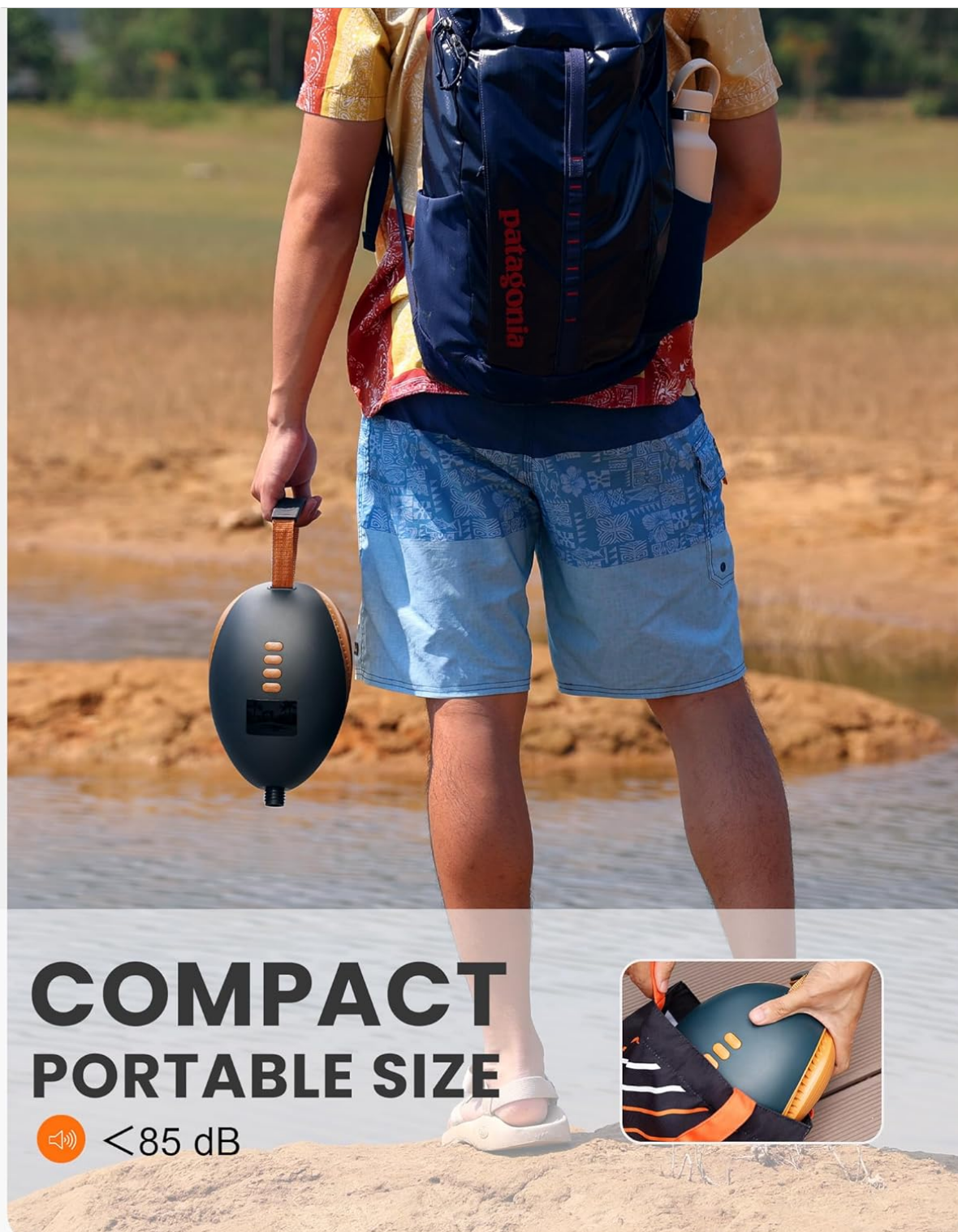
Image: The compact design of the Dolphin pump, making it easy to transport.