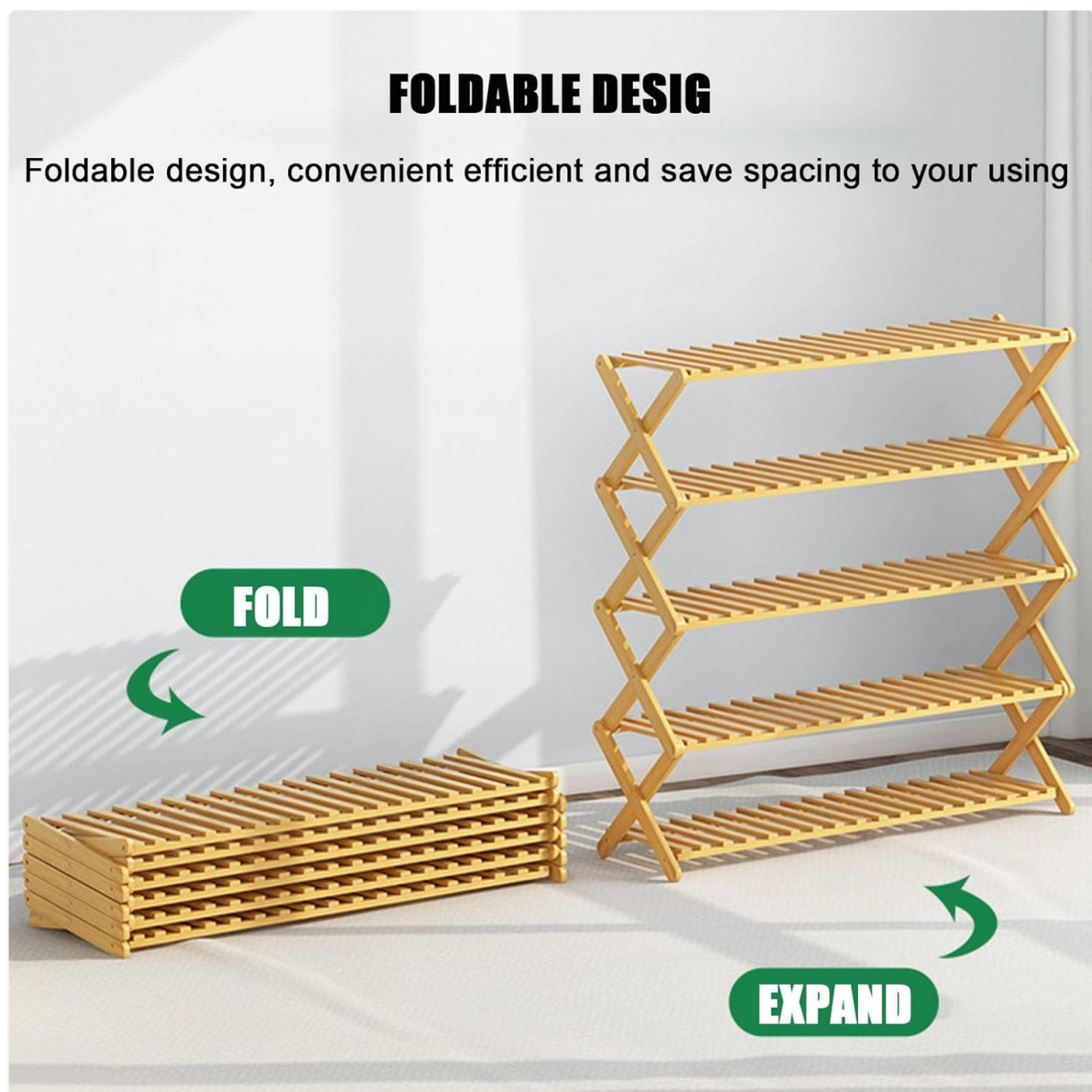
Image 4.1: Illustration of the plant stand's foldable design, showing the transition from folded to expanded.