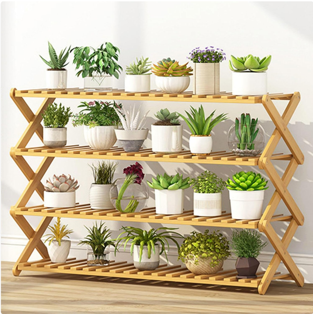
Image 1.1: The 3-Tier Foldable Bamboo Plant Stand displaying multiple potted plants.