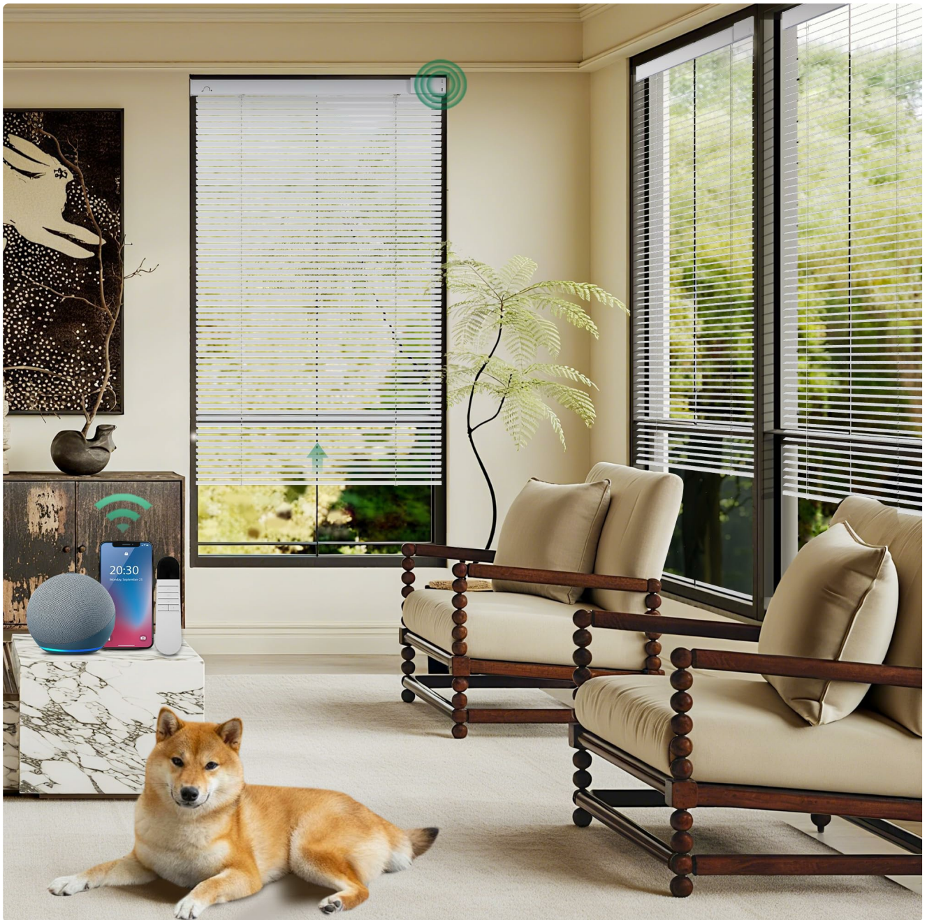
Image 1.1: Allesin Motorized Blinds, Milky White, installed in a window.