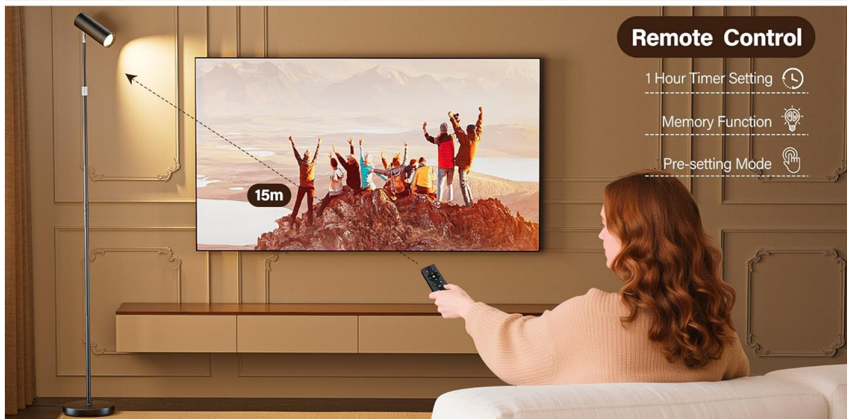
Image: Overview of touch and remote control interfaces.