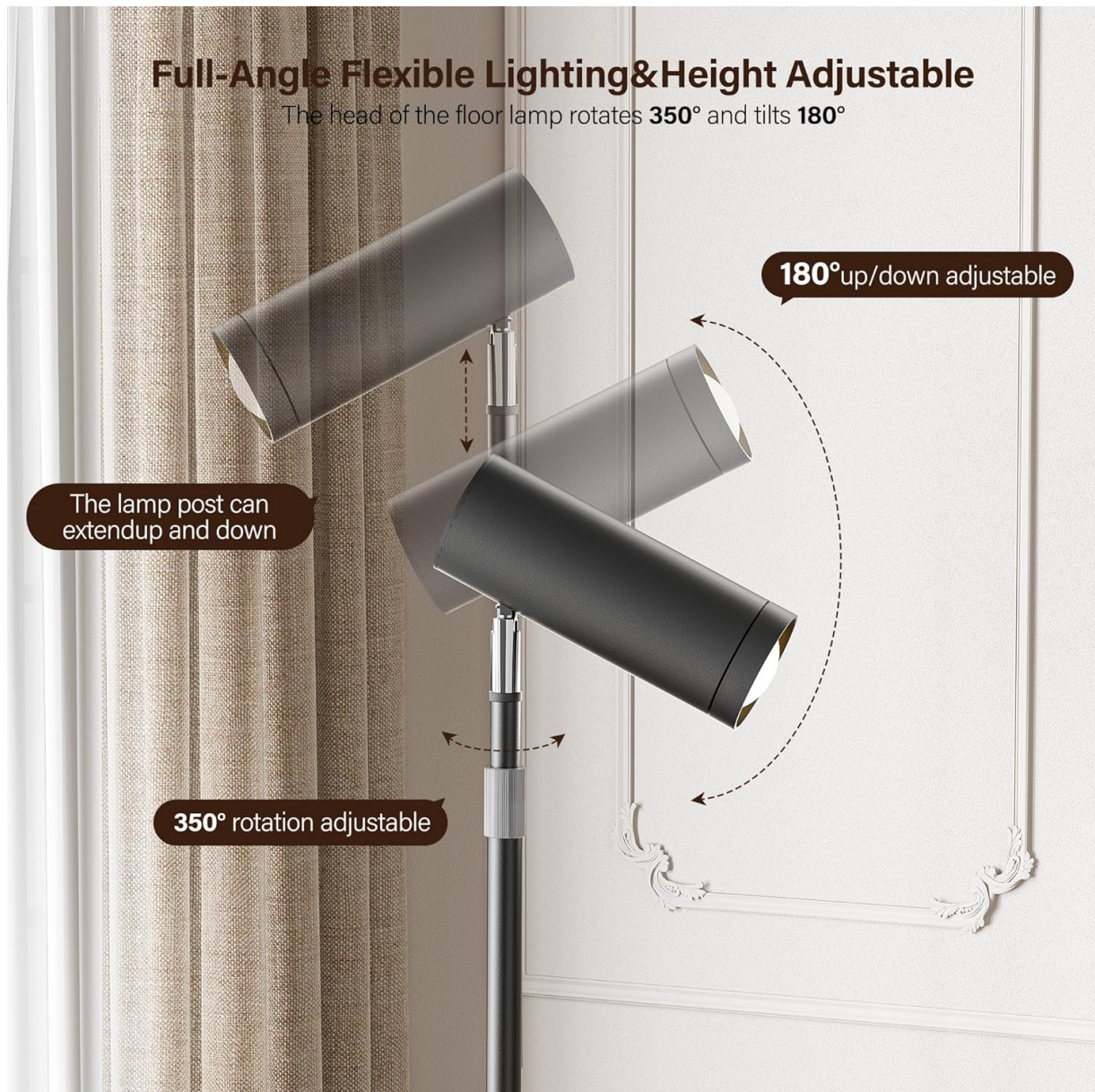
Image: Lamp head rotation, tilt, and height adjustment.

The head of the floor lamp rotates 350° and tilts 180°