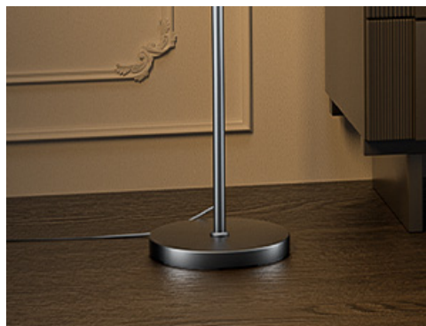
Image: The weighted metal base ensures stability.