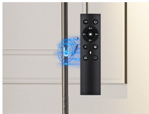
Image: The remote control features a magnetic design for easy storage on the lamp pole or other metal surfaces.