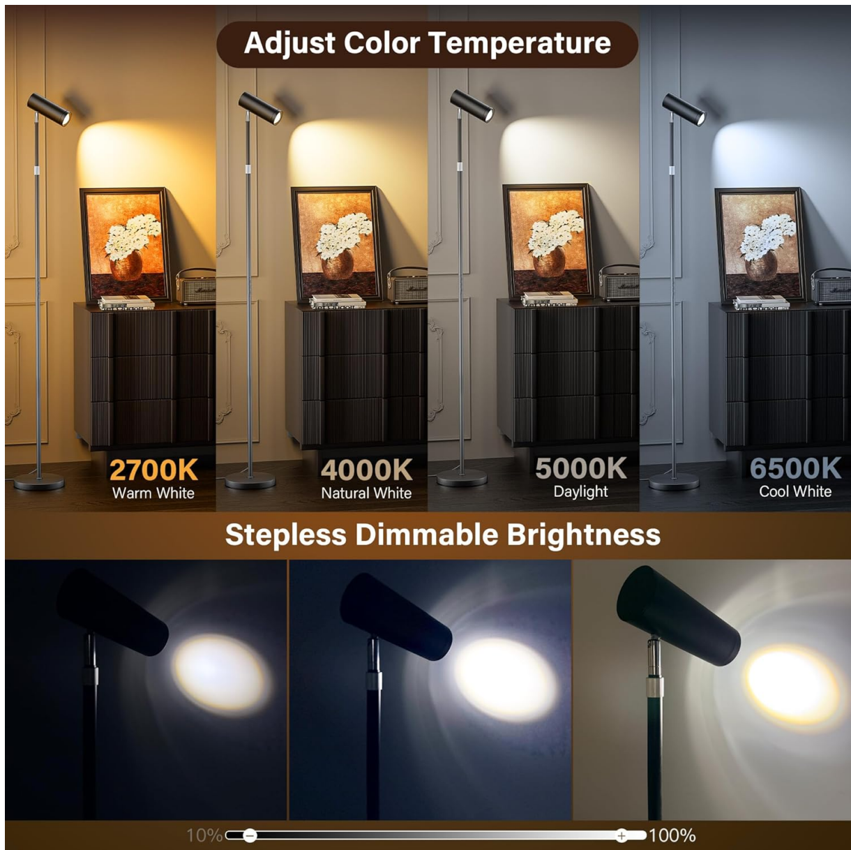
Image: Demonstrating adjustable color temperature and stepless dimming.