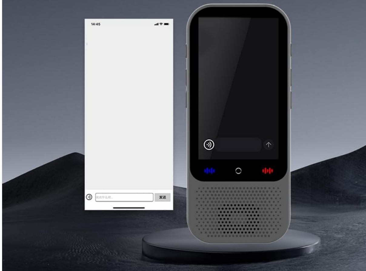
Image: The S80 Pro device next to a smartphone screen, illustrating the mobile translation feature via scan code connection.

Mobile phone scan code connection translator, communication and translation easier