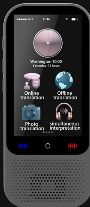
Image: The S80 Pro device screen showing the "Offline translation" option and text indicating support for 17 offline translation packages and an INMT offline engine.

Quick response to accurate translation, no network need not be afraid, go with the translation easier