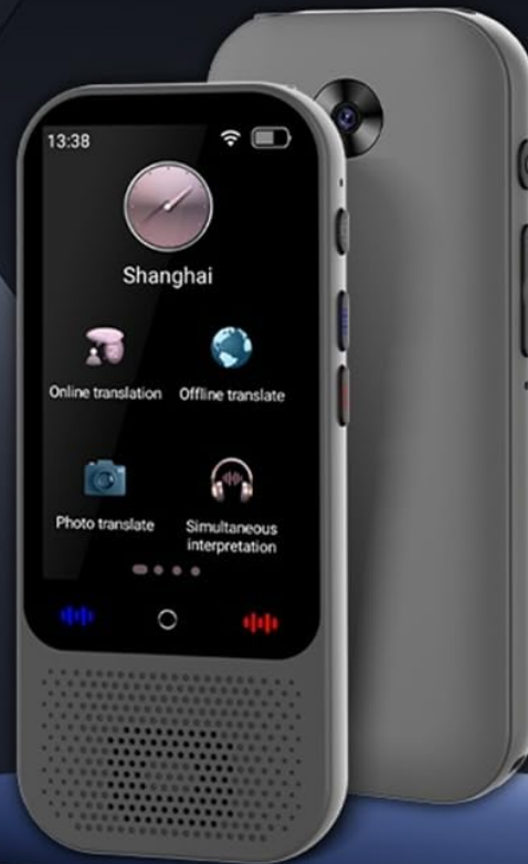
Image: The S80 Pro device displaying its main menu with options like Online Translation, Offline Translation, Photo Translate, and Simultaneous Interpretation.