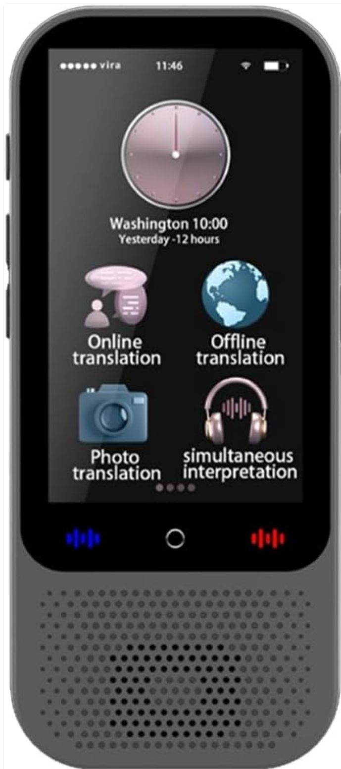
Image: Front view of the S80 Pro AI Translation Device, displaying its user interface with options for online, offline, photo translation, and simultaneous interpretation.