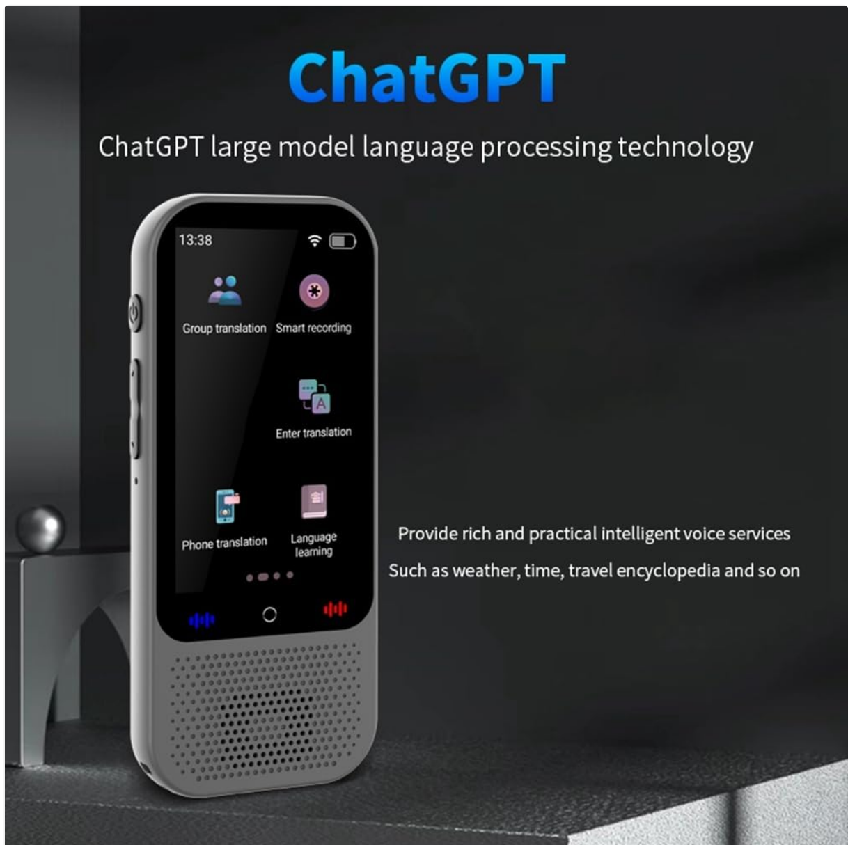
Image: The S80 Pro device screen showing "ChatGPT" and text indicating its large model language processing technology for intelligent voice services.

voice services such as weather information, time, and access to a travel encyclopedia.