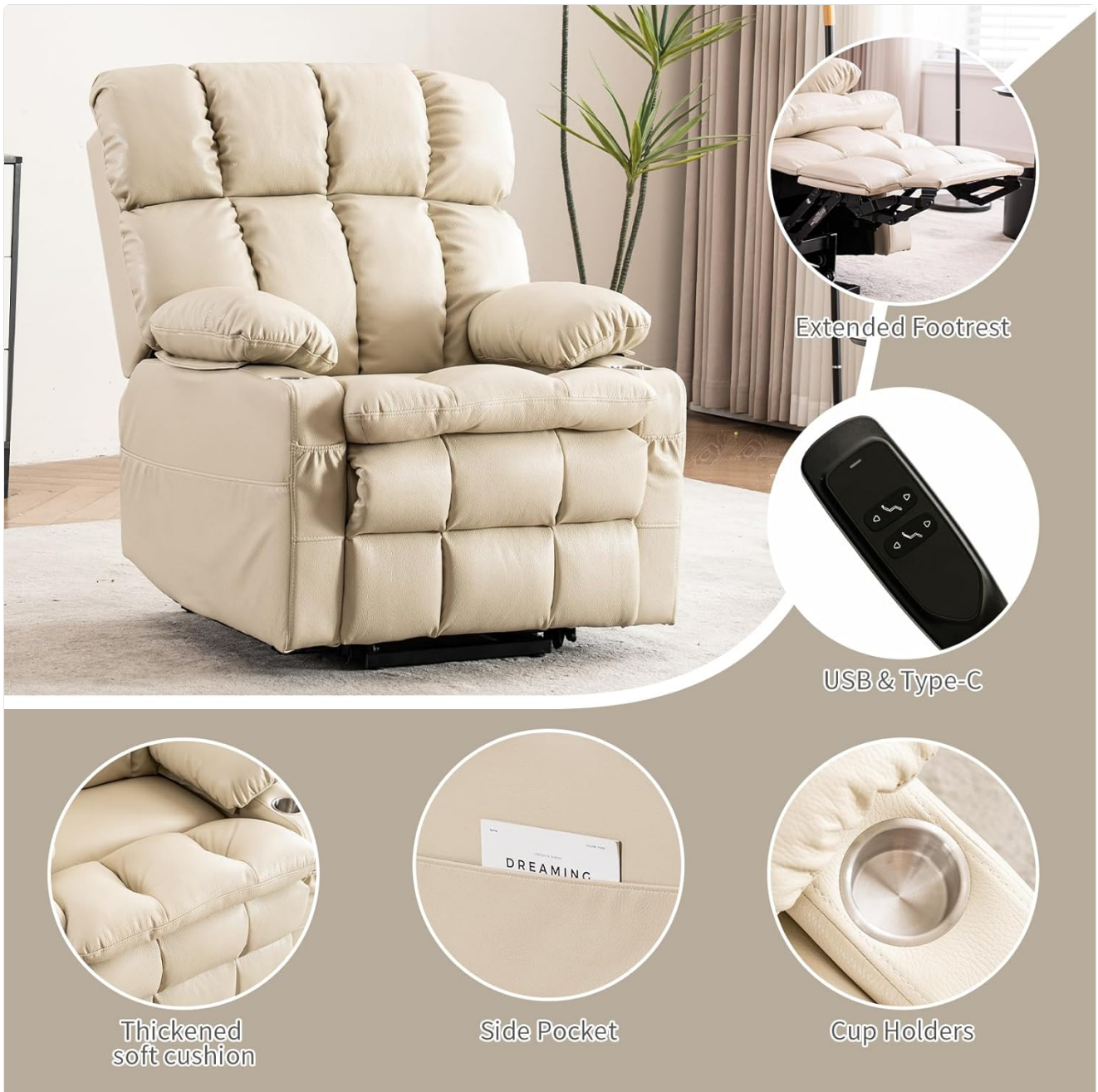
Image: Detailed view highlighting the thickened soft cushion, side pocket, stainless steel cup holders, and the USB & Type-C charging ports integrated into the remote control.