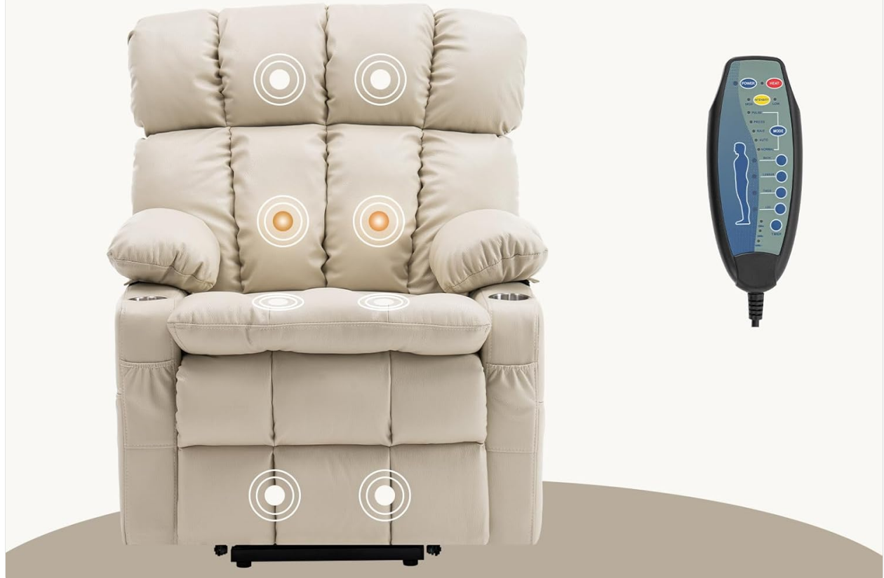
Image: Illustration detailing the 8-point massage system and lumbar heating feature, controlled by the remote.