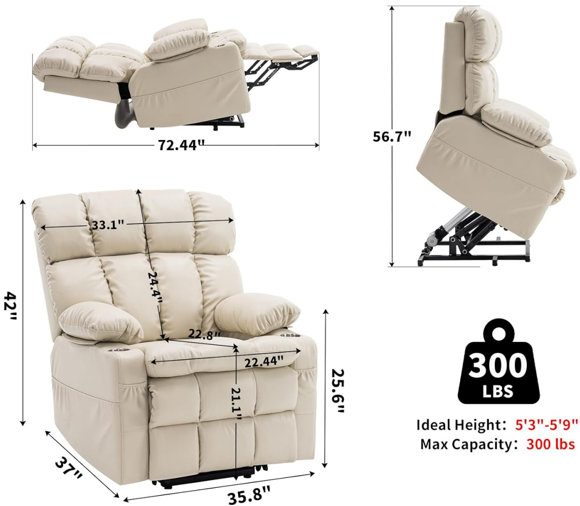
Image: Diagram showing the dimensions of the recliner chair, useful for understanding component placement.