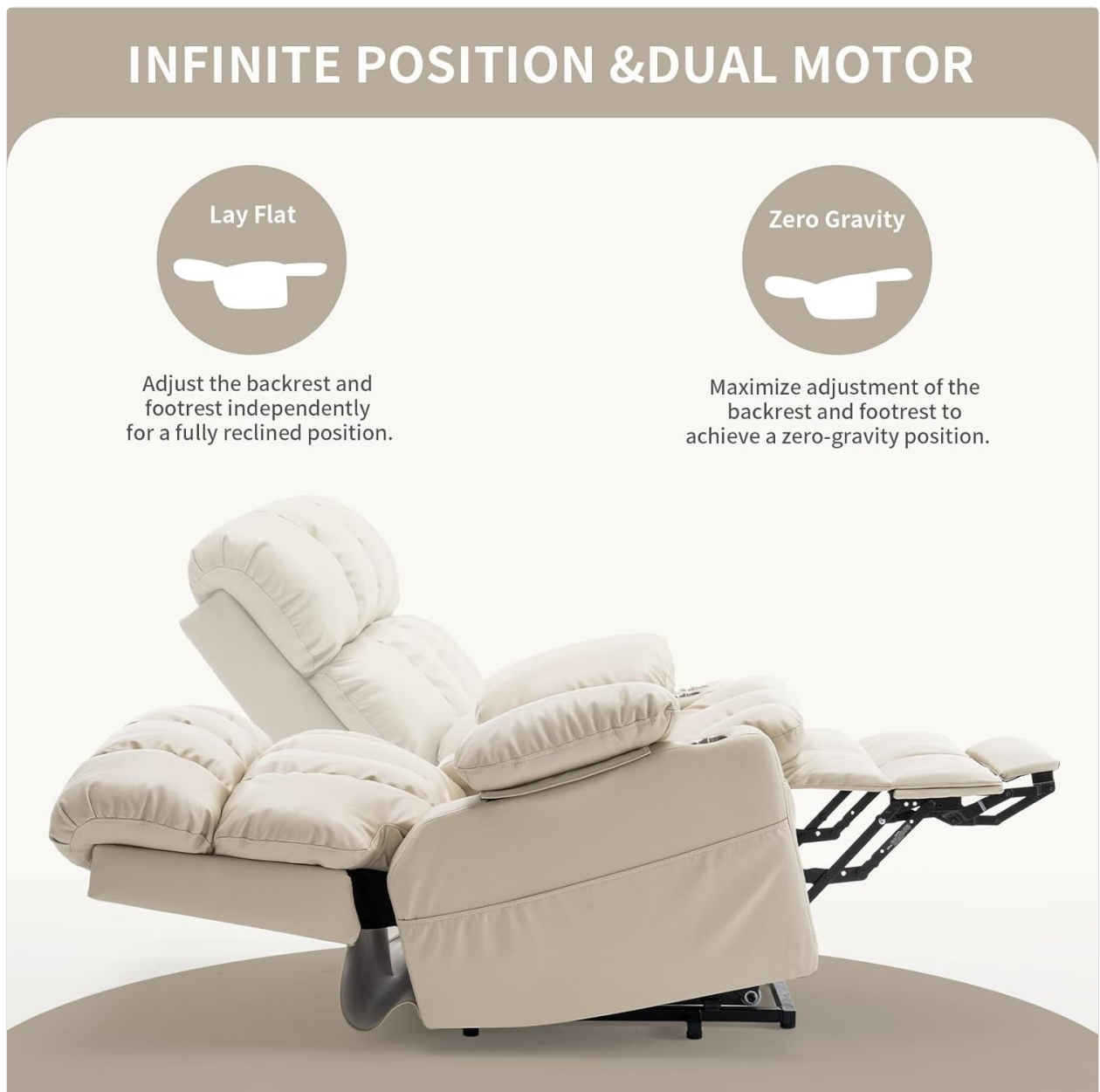
Image: Diagram illustrating the chair's ability to achieve infinite positions, including lay-flat and zero-gravity, thanks to its dual motor system.