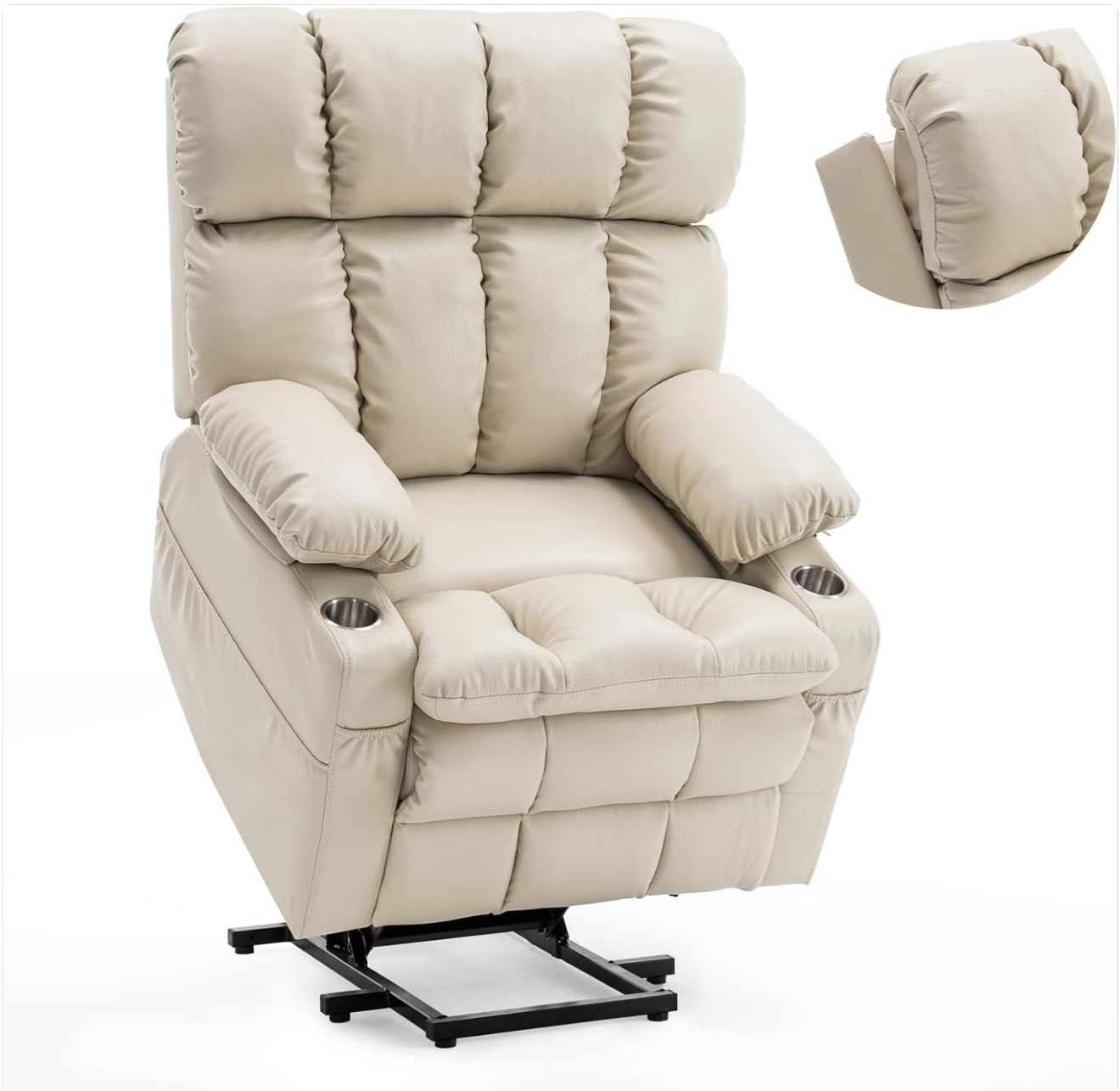
Image: The Zuacs Dual Motor Power Lift Recliner Chair in Beige, showcasing its overall design and features.