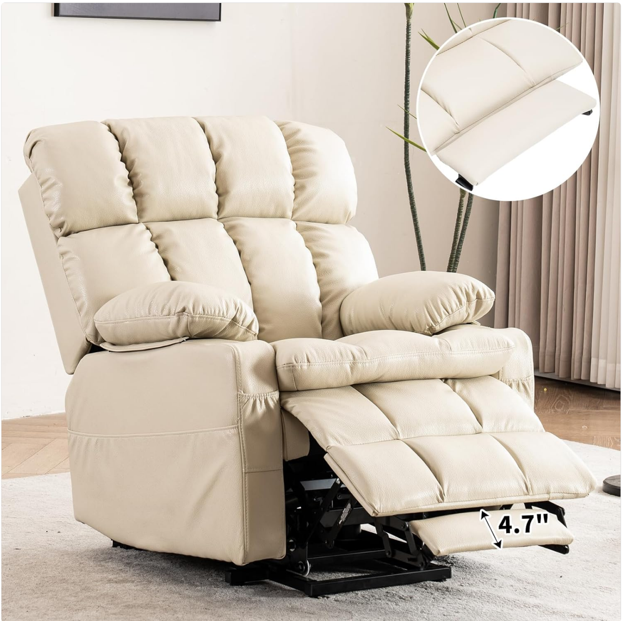
Image: The recliner chair with its footrest extended, showing the additional 4.7 inches of support.