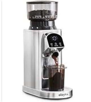
Image: Safety design illustration, demonstrating the importance of aligning the lid with the handle to avoid an E4 error and ensure safe operation.