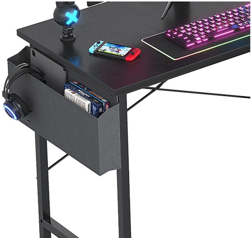
Image: Close-up view of the X-brace design on the metal frame, illustrating structural support.

Attach the metal legs to the main support bars using the provided screws and Allen wrench. Ensure all connections are secure but do not overtighten initially.