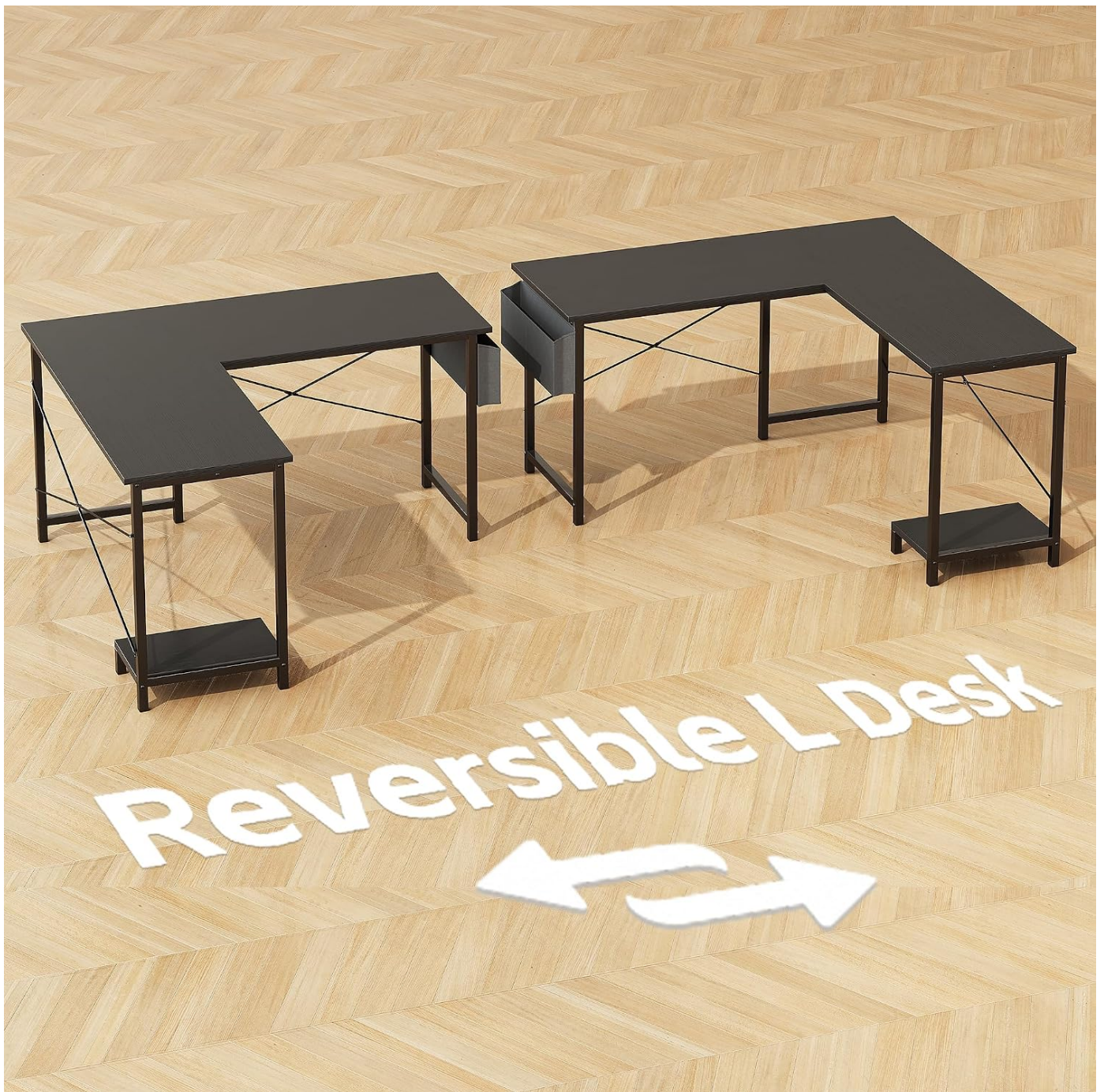
Image: The desk shown in two different L-shaped configurations, demonstrating its reversible design.