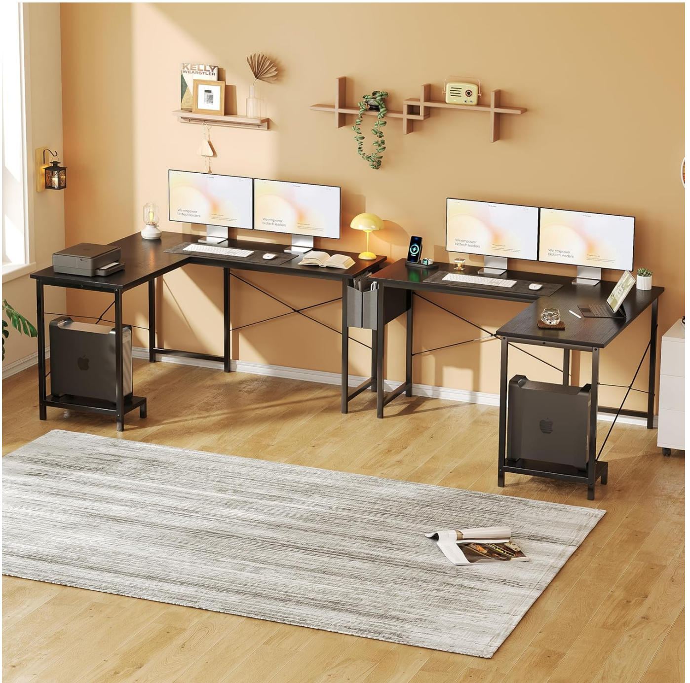
Image: A spacious office setup demonstrating the desk's ability to form a U-shape for multiple users or extensive workspace.