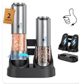
Figure 9: Removable and washable ceramic core.