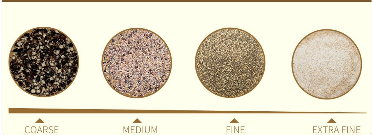
Figure 4: Adjusting the grind coarseness.