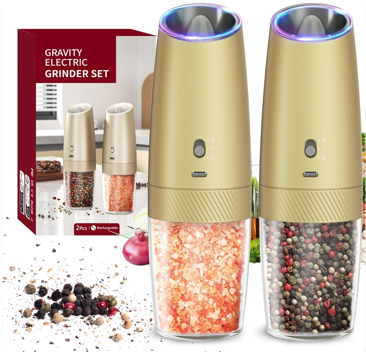
Figure 1: CIRCLE JOY Gravity Electric Salt and Pepper Grinder Set.