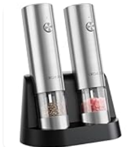
Figure 8: Washable container for easy cleaning.