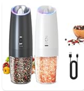
Figure 7: Bright LED light for precision.

The bright white LED light automatically activates when the grinder is tilted for use. This feature allows you to clearly see the amount of seasoning being dispensed, even in low-light conditions, preventing over-seasoning.