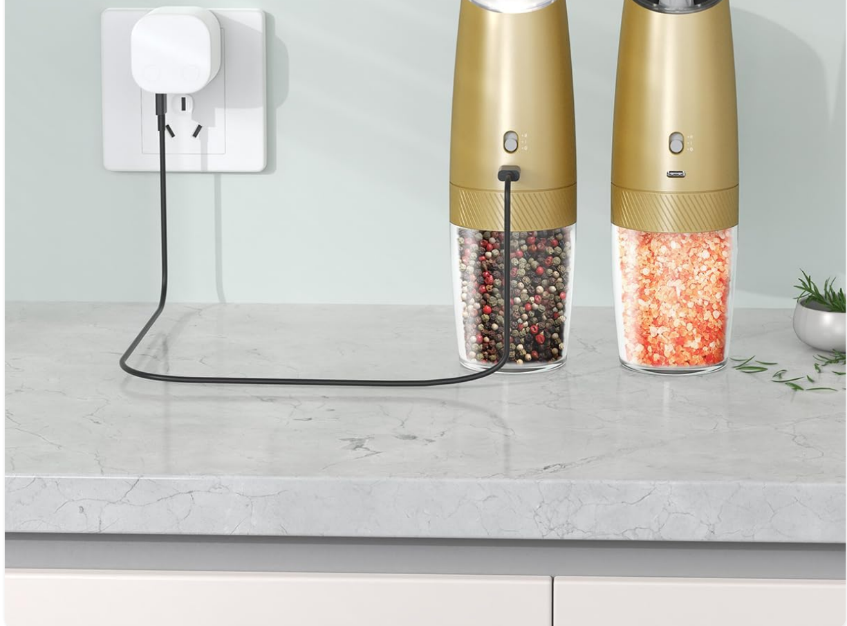
Figure 3: Charging the grinder via USB-C.