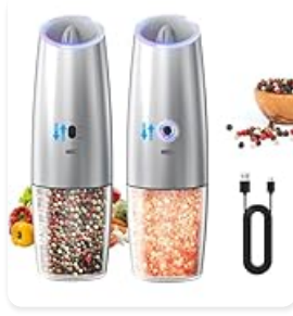
Figure 6: Speed selection switch.