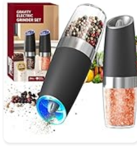
Figure 2: Overview of product features.