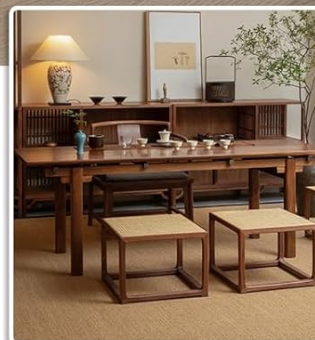
> > > Tea Room