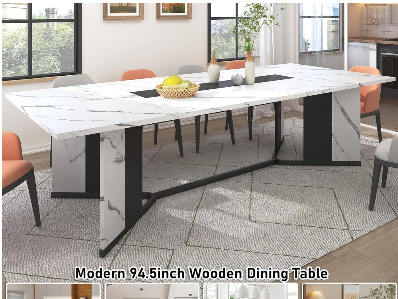
Modern 94.5inch Wooden Dining Table