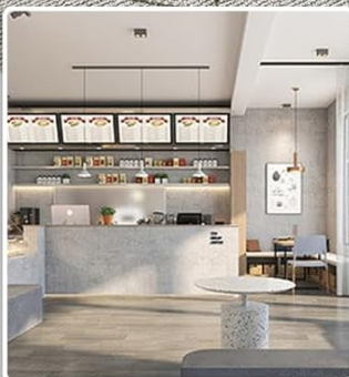
> > > Dining Room