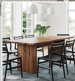
> > > Restaurant