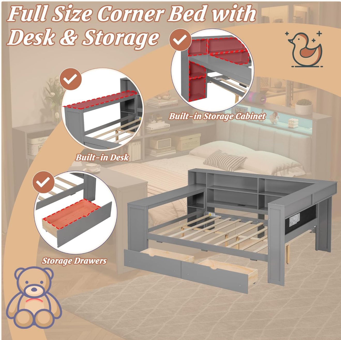
Image 4.1: Close-up views highlighting the built-in storage cabinet, integrated desk, and under-bed storage drawers, indicating their assembly points.