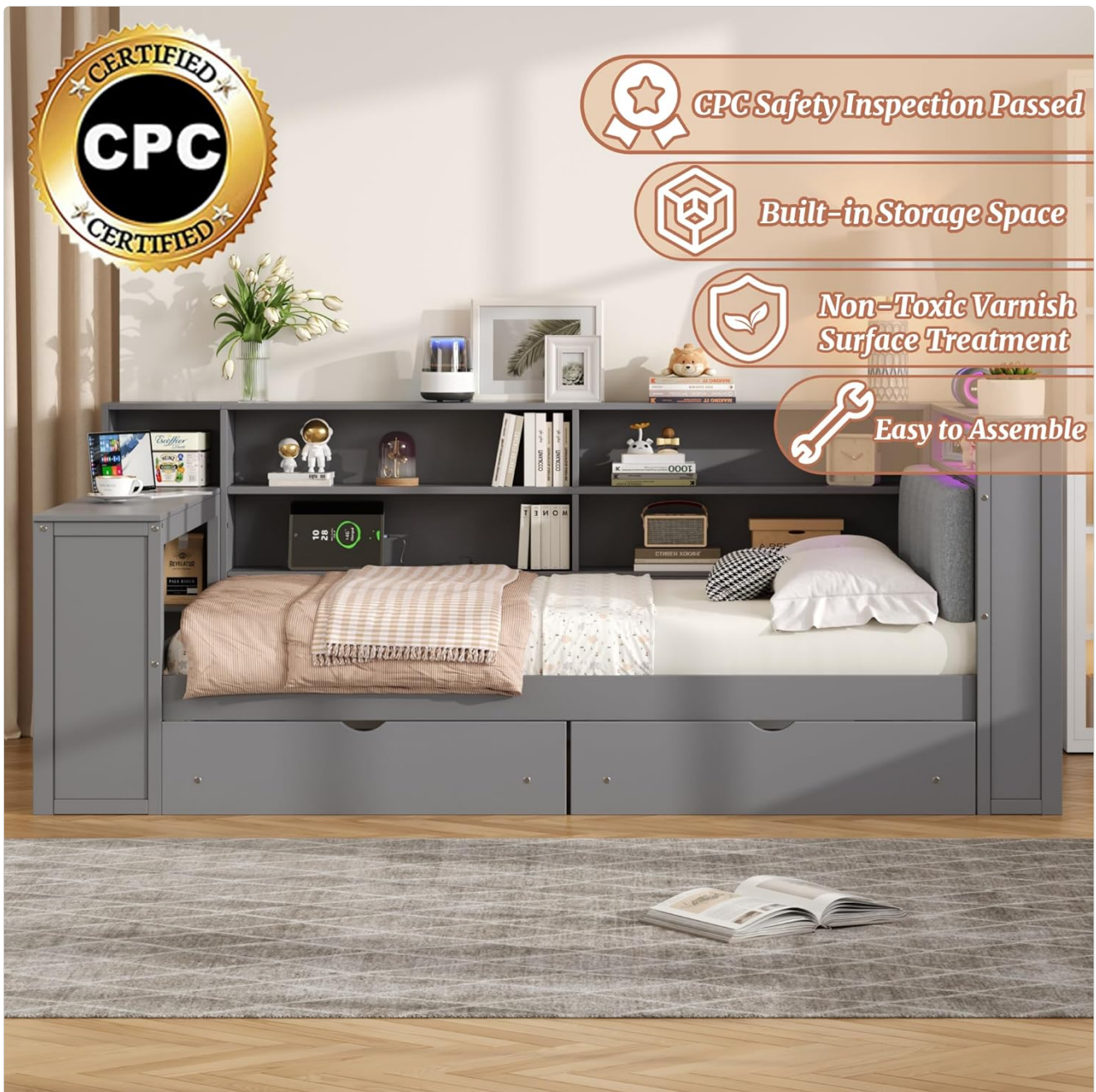
Image 2.1: Visual representation highlighting CPC Safety Inspection, built-in storage, non-toxic varnish, and ease of assembly.