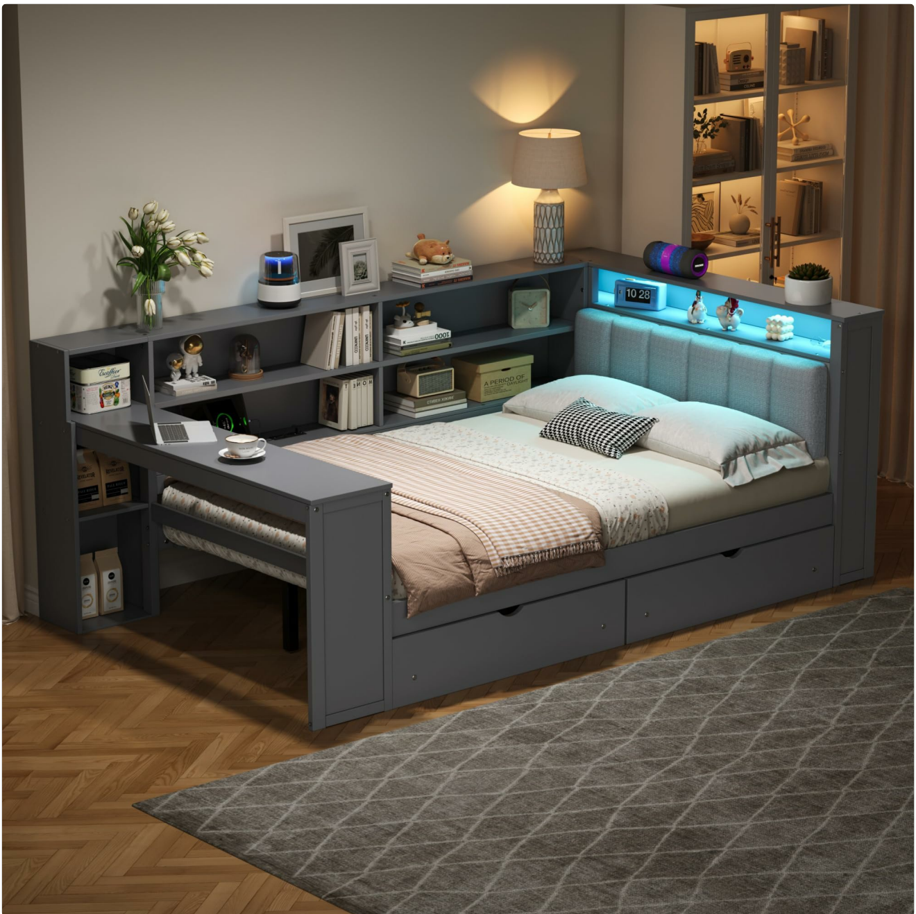
Image 1.1: Fully assembled OYUMOENTS Full Size Corner Daybed in grey, showcasing its storage shelves, desk, and upholstered headboard with LED lighting.