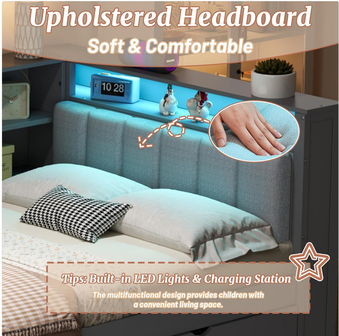
Image 5.1: A detailed view of the upholstered headboard, showing the LED lighting and the integrated charging station with power outlets and USB ports.

Important: Unplug the charging station when not in use to conserve energy and for safety.