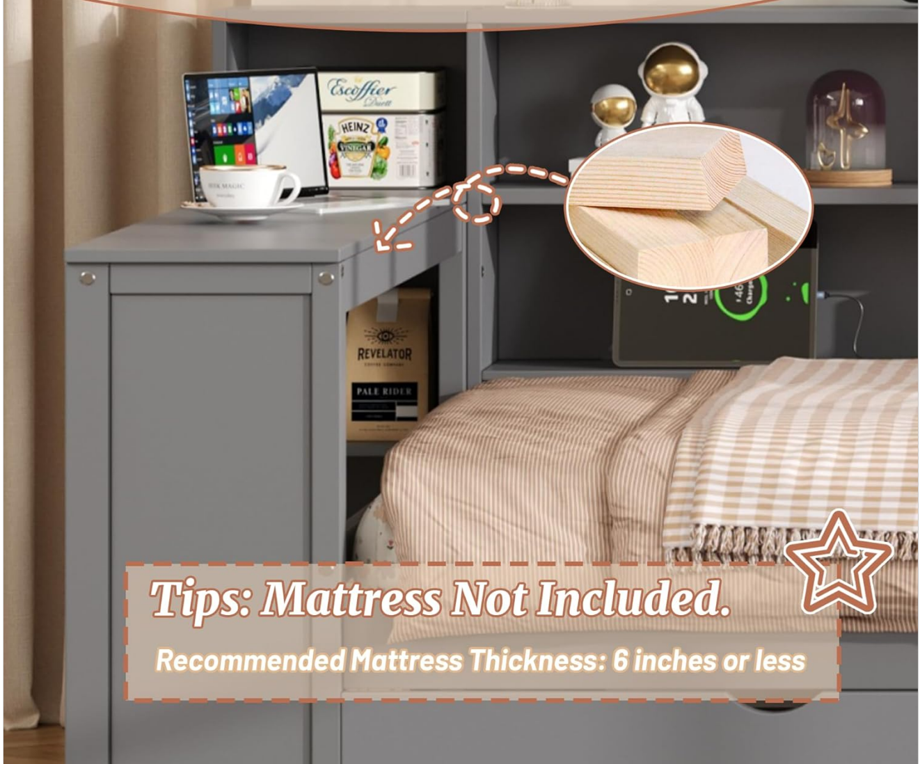
Image 8.2: Detail showing the solid wood construction and a note that the mattress is not included, with a recommendation for mattress thickness.