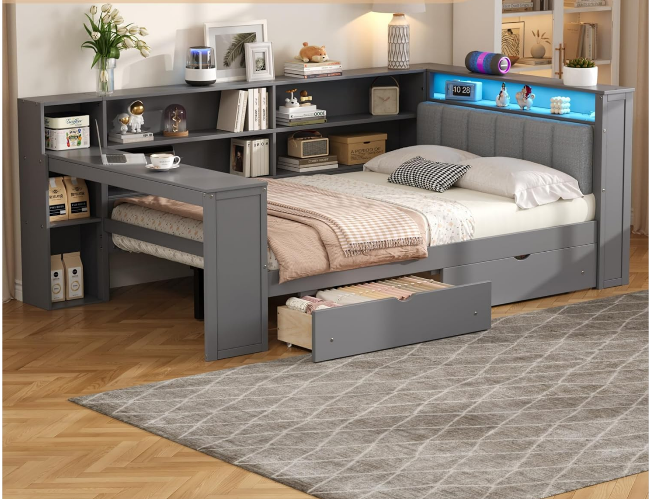
Image 5.2: The daybed with its under-bed storage drawers pulled out and items placed on the integrated shelves, demonstrating storage capacity.

This corner bed features numerous thoughtful designs tailored for Kids & Teens.