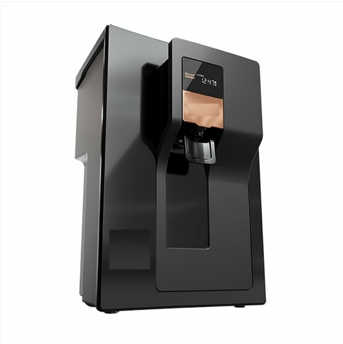
Figure 1: Eureka Aspire Nova RO UV 2X Water Purifier. This image displays the front view of the water purifier, highlighting its compact design and integrated display.