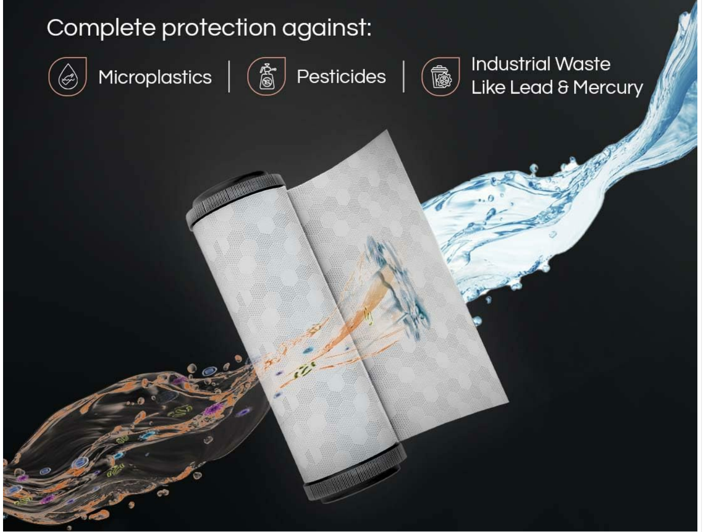
Figure 3: Nanopore Filter Technology. This image visually represents the Nanopore filter, highlighting its effectiveness against microplastics, pesticides, and industrial waste like lead and mercury.