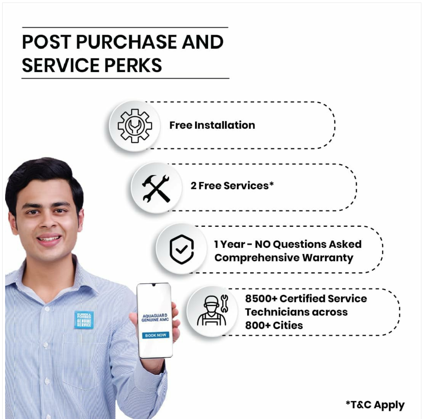
Figure 6: Post Purchase and Service Perks. This image highlights the benefits included with the purchase, such as Free Installation, 2 Free Services, a 1-Year Comprehensive Warranty, and access to a large network of certified service technicians.

The purchase includes complimentary installation and 2 free services. Eureka Forbes has a network of over 8500 certified service technicians across 800+ cities.