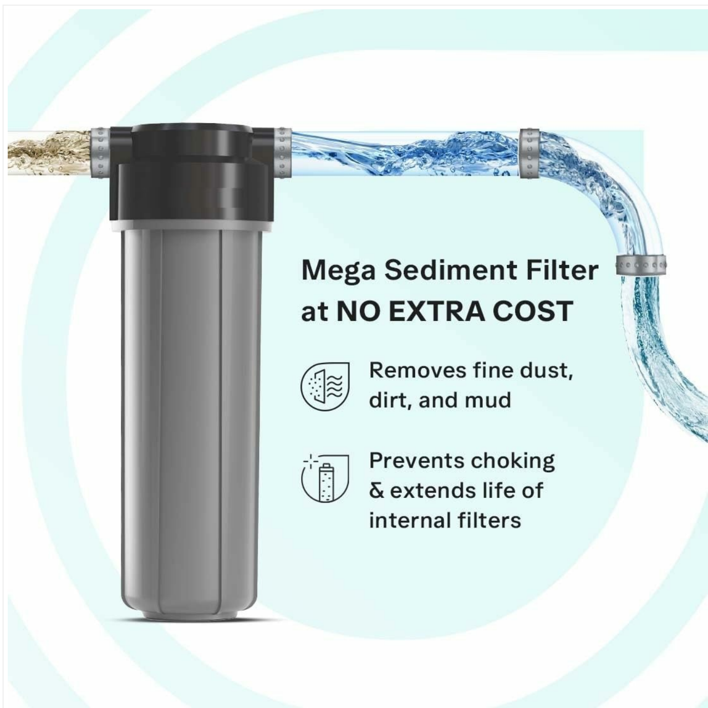
Figure 5: Mega Sediment Filter. This image shows the external Mega Sediment Filter, illustrating its function in removing fine dust, dirt, and mud particles from water, thereby preventing choking and extending the life of internal filters.