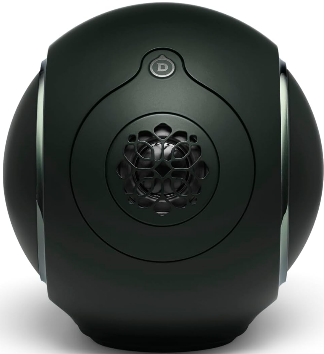
Image: Speaker with an overview of its technical specifications.