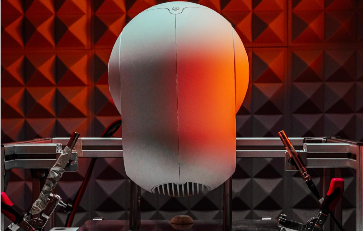
Image: Rear view of the speaker, highlighting the power input.

Designed and manufactured in France, Devialet Phantom Ultimate 98 dB speaker harmonizes cutting-edge tech and timeless craftsmanship.