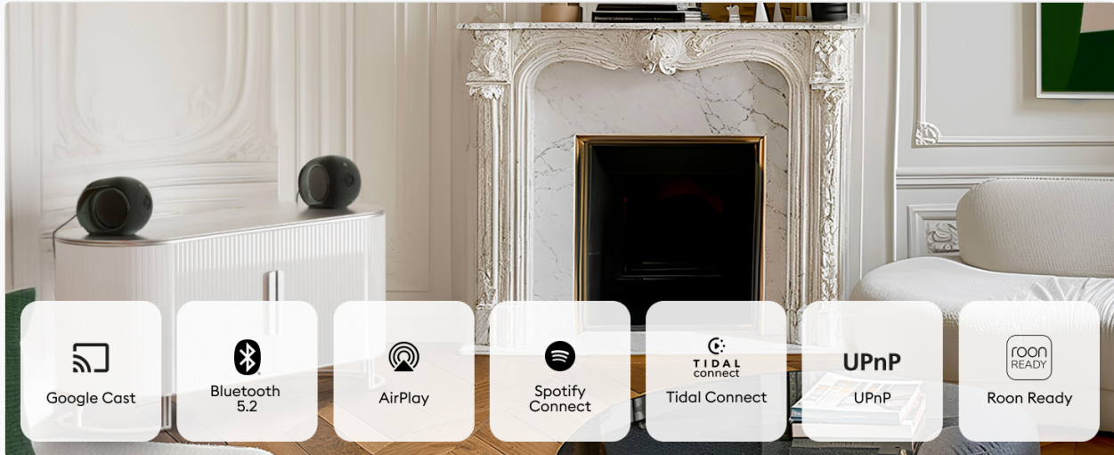
Image: Visual representation of the speaker's diverse connectivity options.