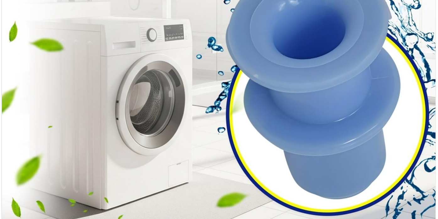
Image: The MONTERAL emergency drain plug shown alongside logos of various compatible washing machine brands and their respective original part codes, indicating broad compatibility.