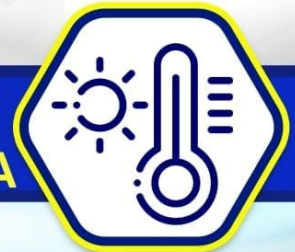
Image: A visual representation of the drain plug, emphasizing its robust construction from resistant plastic and its resilience against humidity, household chemicals, and temperature changes.