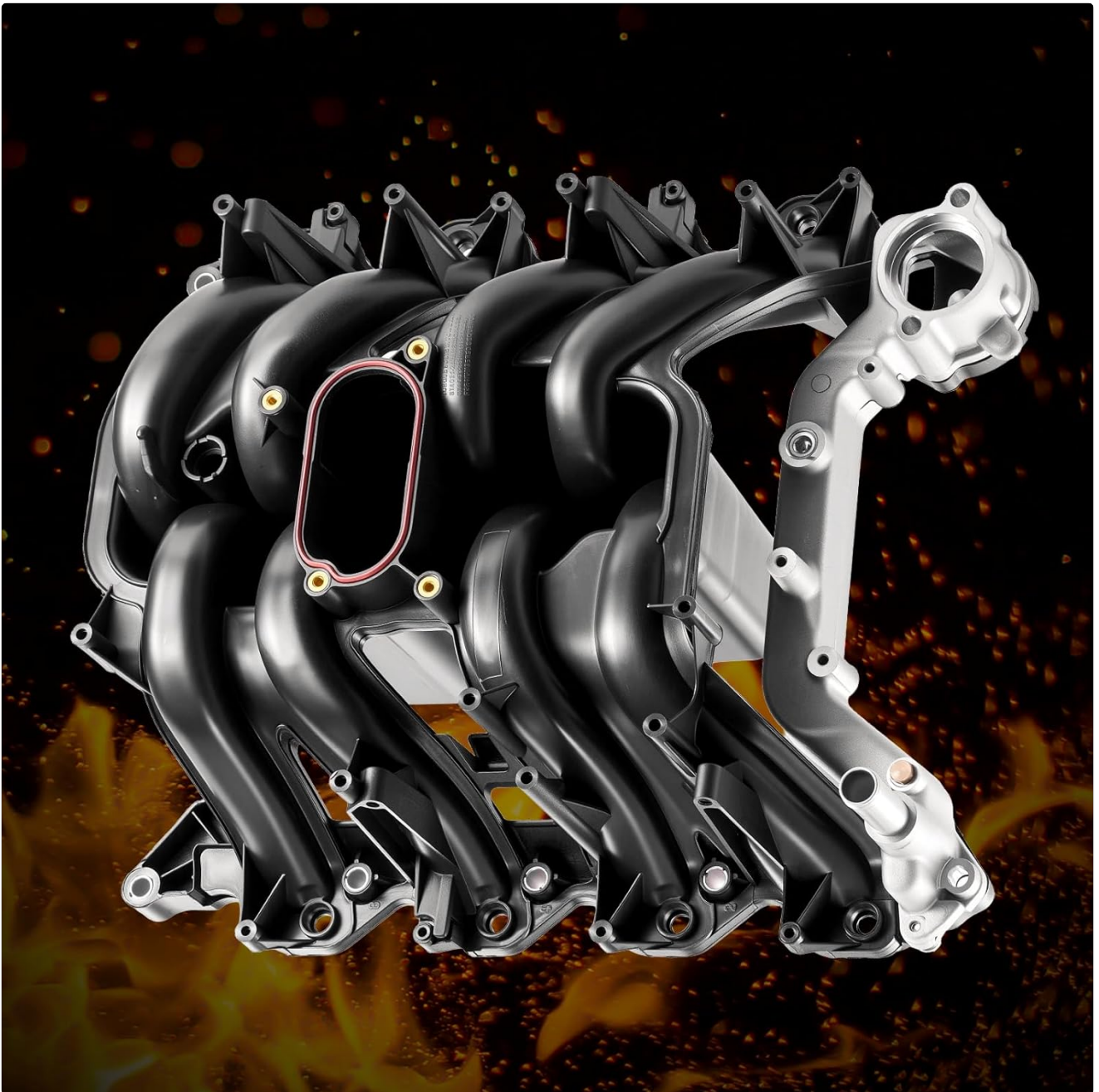
Image: Dimensional view of the VEVOR Intake Manifold.