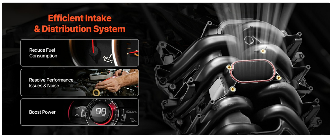
Image: Visual representation of symptoms indicating potential intake manifold issues.