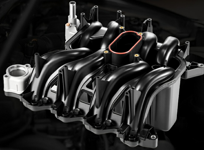
Image: Vehicle compatibility details and corresponding OE numbers for the VEVOR Intake Manifold.