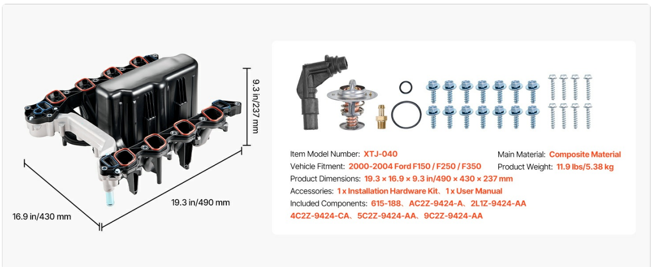
Image: The included thermostat, designed for coolant regulation.