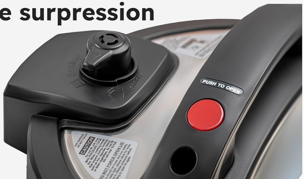
Image: Close-up view of the Saaf Multicooker's inner pot and the pressure release valve on the pressure cooker lid. The inner pot features measurement markings.