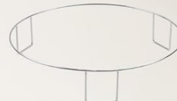
7. Porte-couvercle pour friteuse sans huile