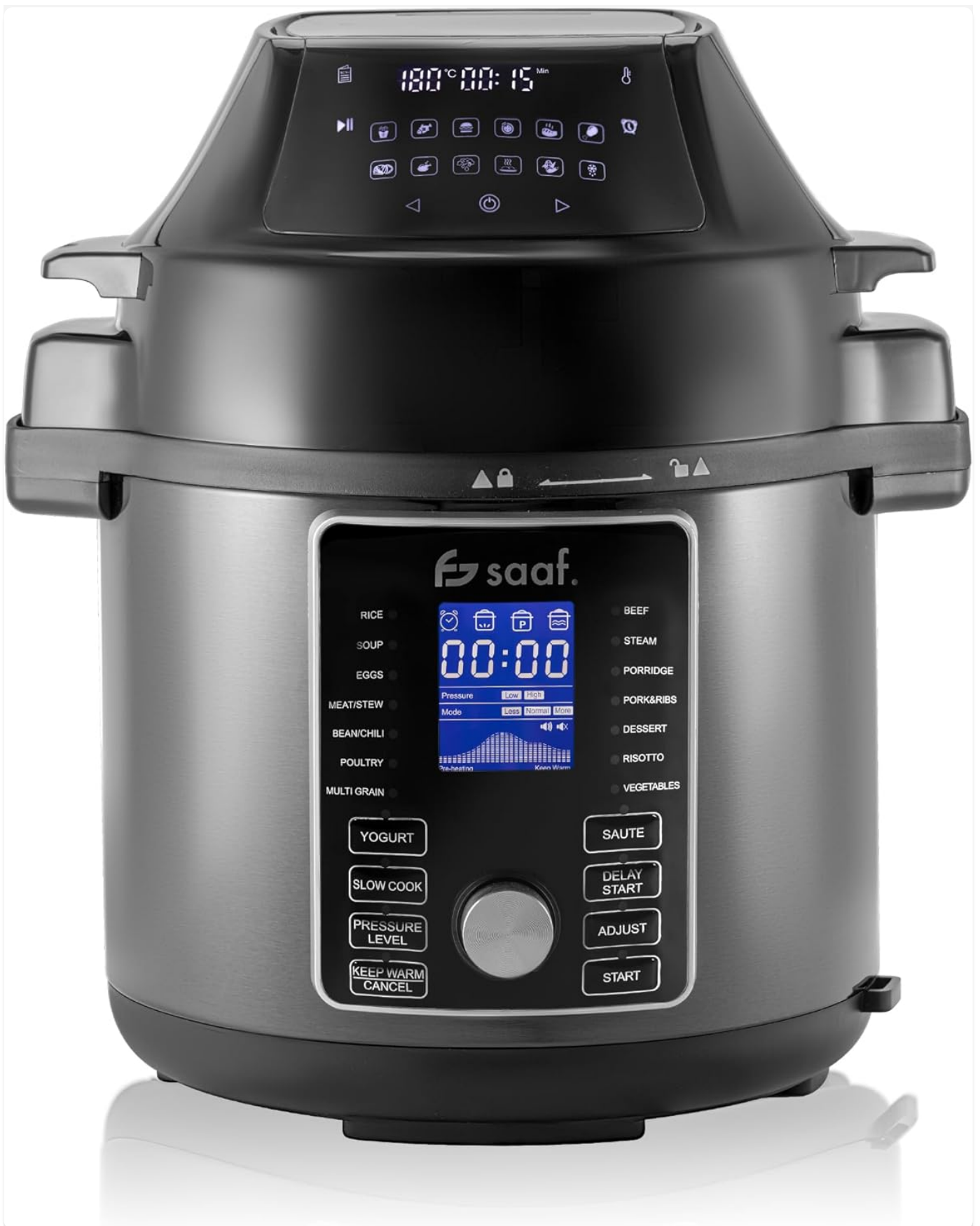
Image: Front view of the Saaf Multicooker with the Airfryer lid securely attached. The digital control panel is visible, displaying time and temperature settings.