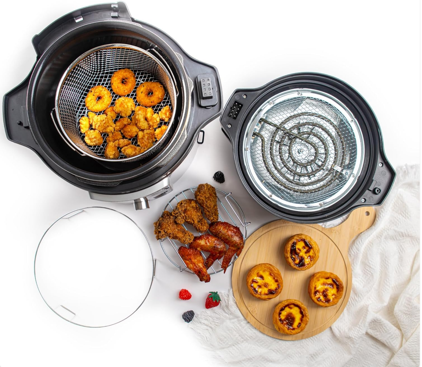
Image: The Saaf Multicooker with the Airfryer lid open, revealing the frying basket filled with food (e.g., chicken wings, pastries). This demonstrates the air frying capability and the use of the included accessories.