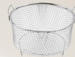
5. Panier pour friteuse sans huile