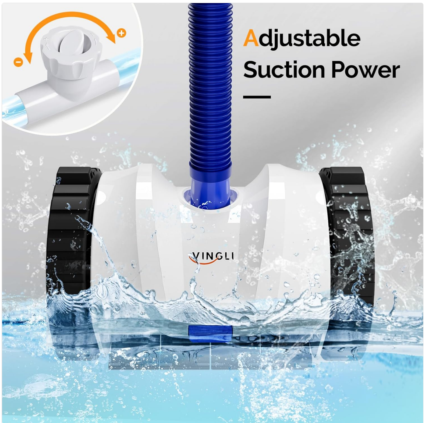
Image: Close-up of the VINGLI Pro Auto Pool Cleaner's adjustable suction power valve. The image highlights the white valve with a blue cap, showing '+' and '-' indicators for increasing or decreasing suction.