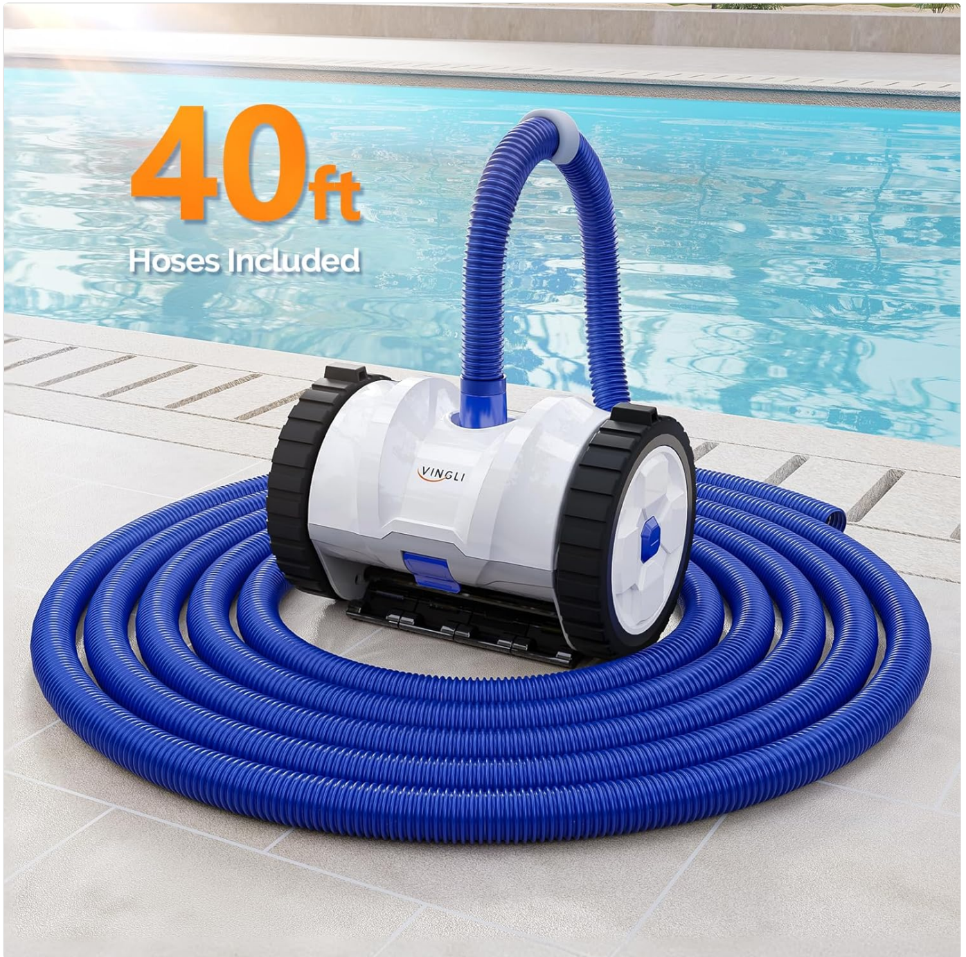
Image: VINGLI Pro Auto Pool Cleaner and its accessories, including 12 hose segments, a regulator valve, and various connectors. The image shows the main cleaner unit, 12 blue hose segments (3.3 ft each), a hose weight, a C-clip, a flow regulator, and various hose adapters and connectors.

Verify that all components are present and undamaged upon opening the package. If any parts are missing or damaged, contact customer support.