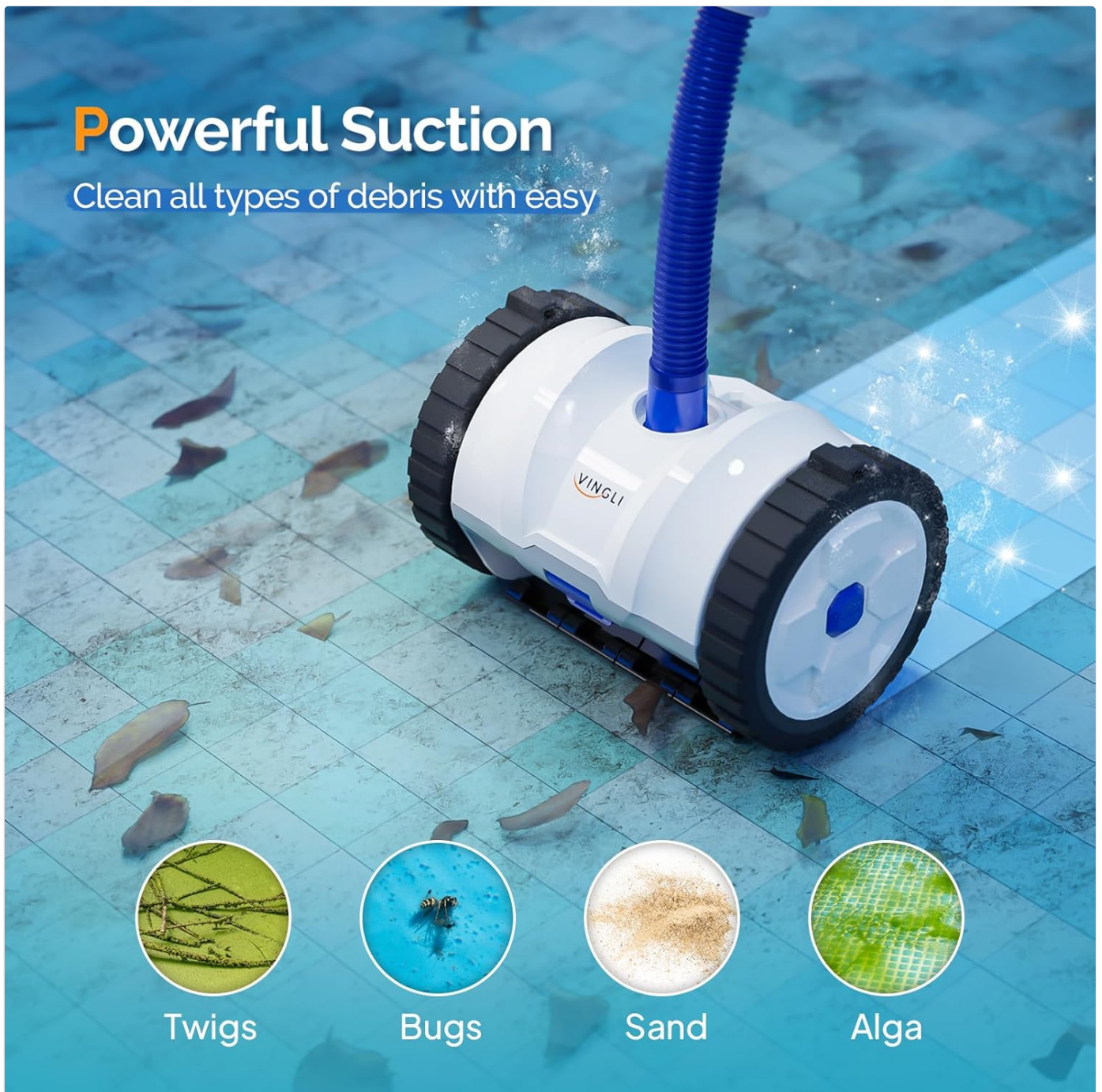
Image: The VINGLI Pro Auto Pool Cleaner positioned on the pool floor, illustrating its ability to clean various types of debris including twigs, bugs, sand, and algae. The cleaner is white and blue, with black wheels, and is shown in a clean pool environment.