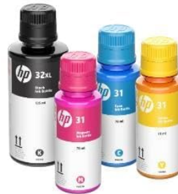
Original HP 32XL Black Ink Bottle Original HP 31 Cyan Ink Bottle Original HP 31 Magenta Ink Bottle Original HP 31 Yellow Ink Bottle

The spill-free refill system allows for easy replenishment of ink by simply inserting the color-matched ink bottle into the tank.