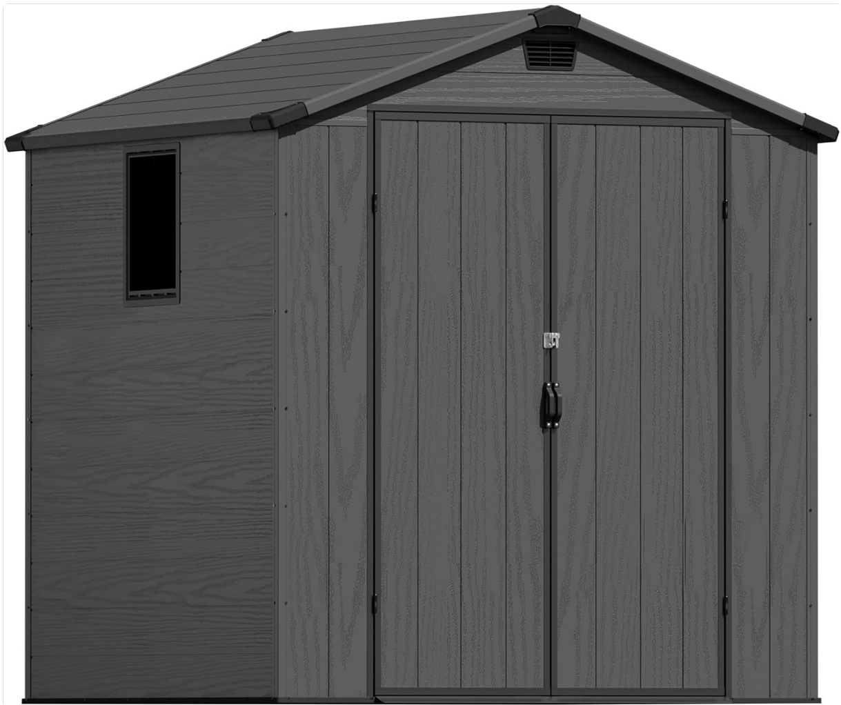
Image 1.1: Front view of the Greesum 6x6FT Plastic Outdoor Storage Shed.