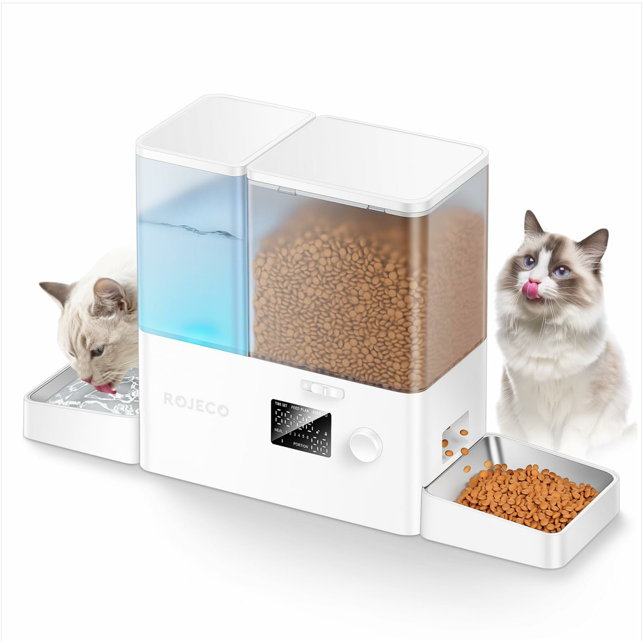
Figure 1: Rojeco PTM-30A3 Automatic 2-in-1 Pet Feeder and Water Dispenser. This image shows the complete unit with separate food and water compartments, an LED display, and feeding bowls.