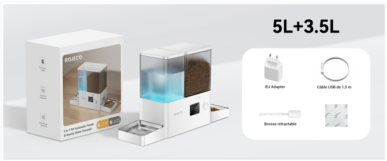
Figure 2: Overview of the Rojeco PTM-30A3 components, including the main unit, food and water tanks, bowls, power adapter, cable, and cleaning brush.