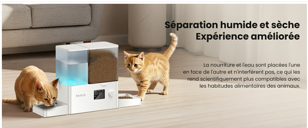
Figure 7: Diagram illustrating the separate compartments for wet (water) and dry (food) zones, designed to prevent cross-contamination and maintain food quality.

The 2-in-1 design ensures that dry food and water are kept separate, preventing the kibble from getting wet and preserving its freshness and nutritional value.