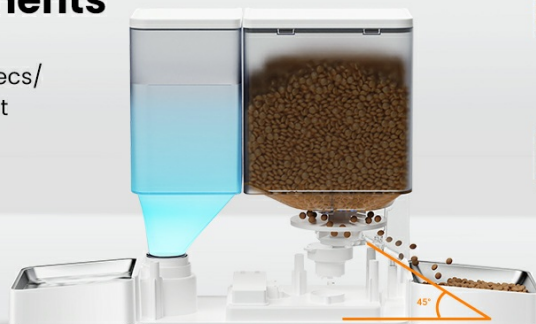
Figure 8: Image highlighting the stable and anti-tipping design of the feeder, featuring a wide base and anti-slip pads to prevent accidental spills.

Prend en charge les aliments secs/lyophilisés de 2 à 18 mm, évitant ainsi les obstructions