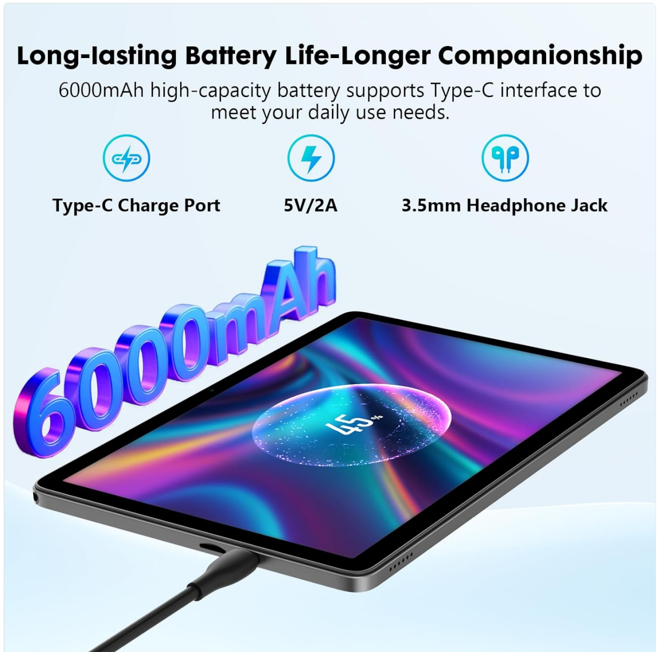
Image: The tablet screen displaying a charging animation with a large '6000mAh' text, indicating its battery capacity and current charging status.

Before first use, fully charge your tablet. Connect the USB-C cable to the tablet's USB-C port and the power adapter, then plug the adapter into a wall outlet. The battery indicator on the screen will show charging status.