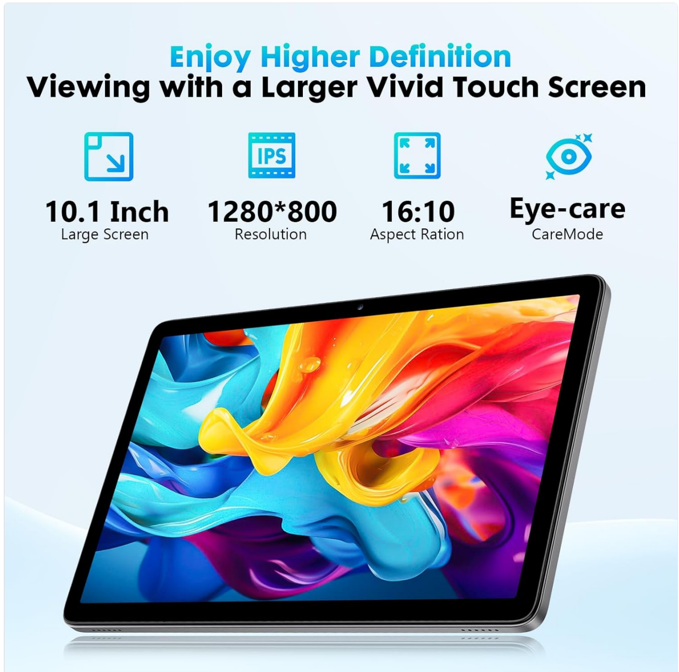
Image: The tablet screen showcasing a colorful, high-definition image, emphasizing its 10.1-inch IPS display with 1280x800 resolution and 16:10 aspect ratio for optimal viewing.