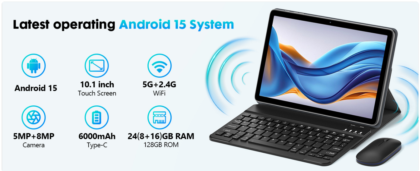
Image: An overview of the Aobante 10-inch Android tablet, highlighting its core specifications including Android 15, 10.1-inch HD display, T615 Octa-Core processor, 6000mAh battery, 24(8+16)GB RAM, 128GB ROM, 5MP+8MP cameras, and Type-C charging.

Detailed technical specifications for the Aobante 10-inch Android 15 Tablet.