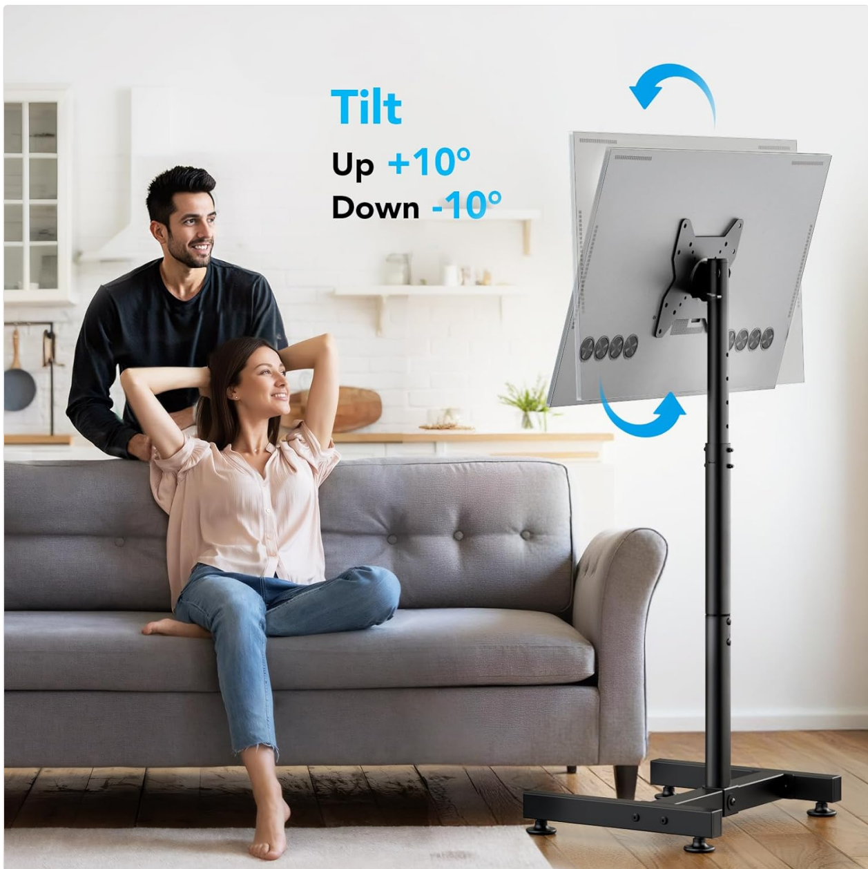
Figure 7: Visual guide for adjusting the TV's tilt angle.