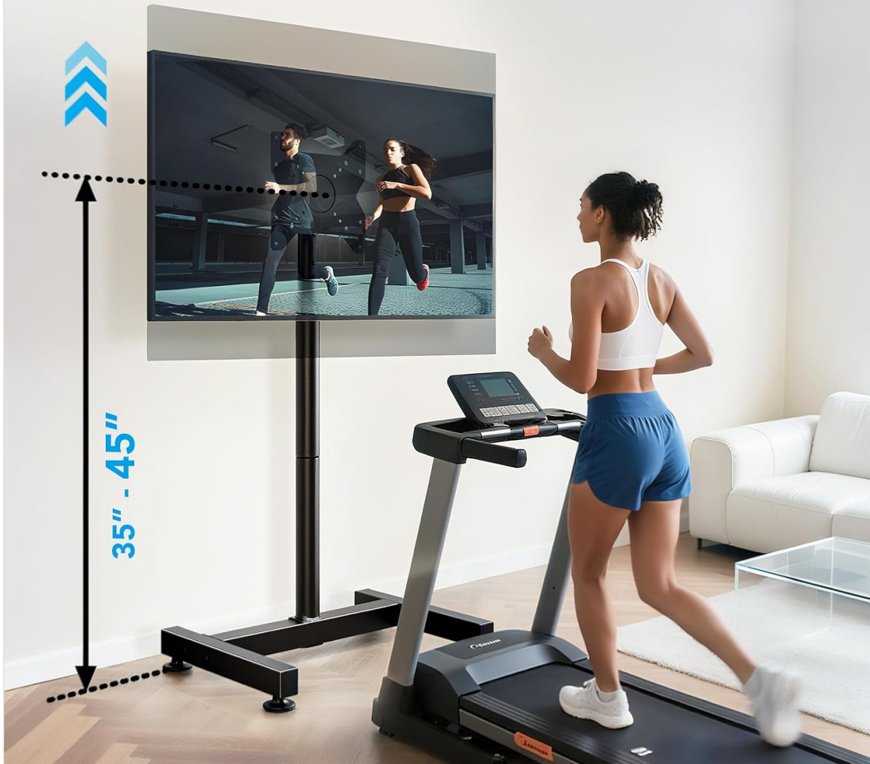
Figure 6: Illustration of the stand's height adjustment capability.