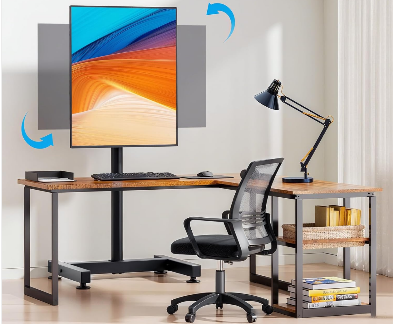
Figure 8: Demonstrating the landscape to portrait rotation feature.