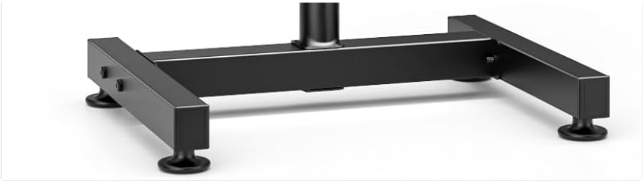
Figure 1: Overview of the AX WABER Floor TV Monitor Stand AX01WG02.