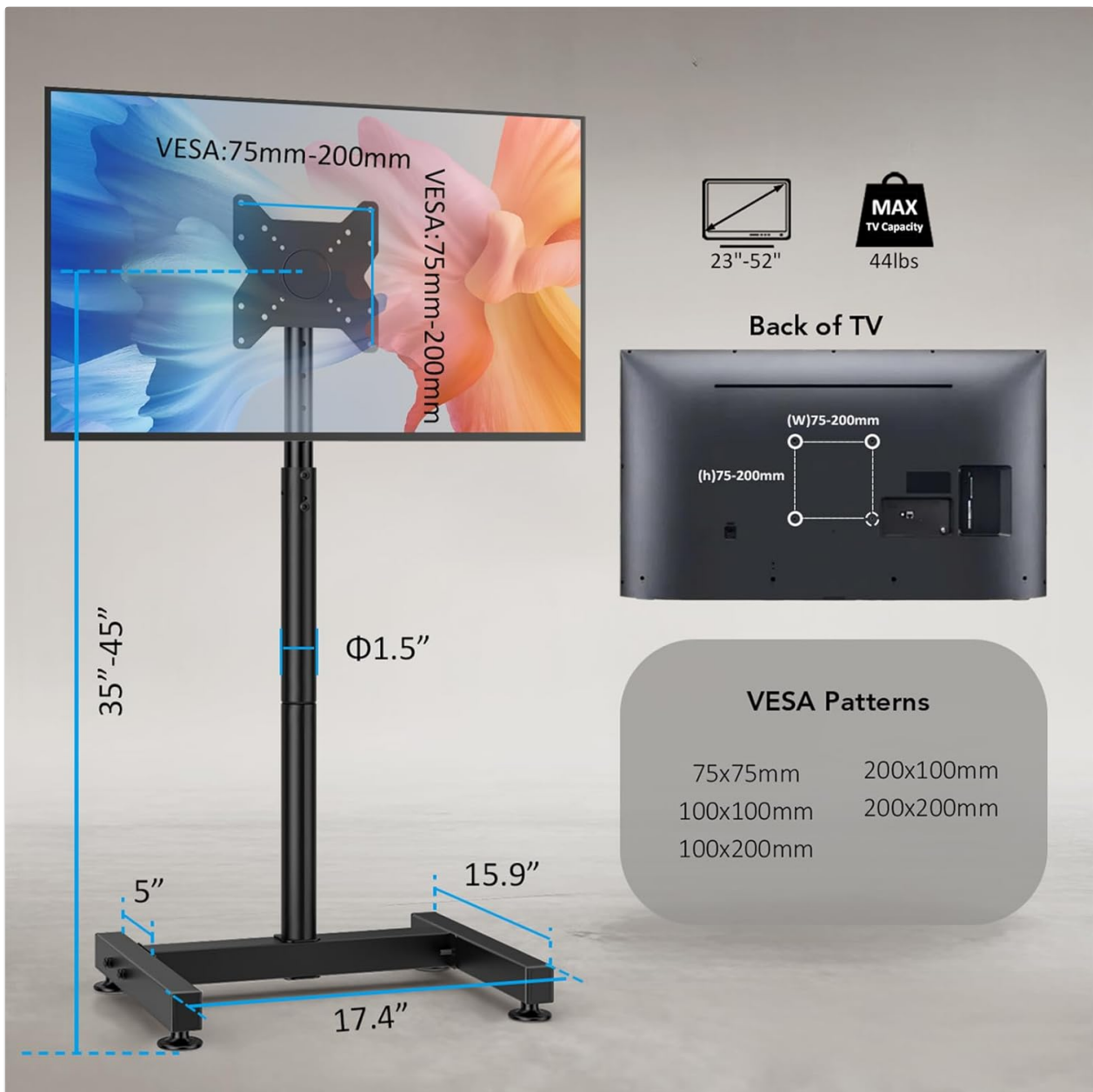
Figure 4: Rear view illustrating the mounted TV and cable management options.