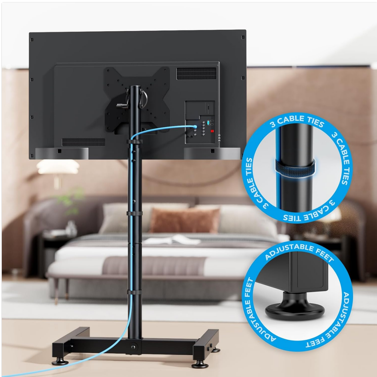
Figure 5: Close-up of cable management ties and adjustable feet.