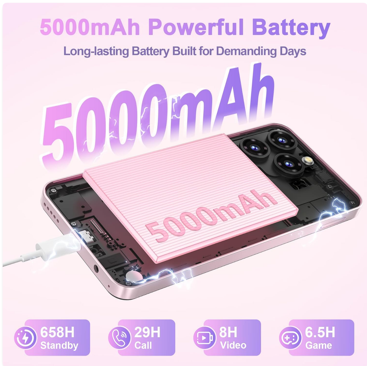
Image 4.3: Visual representation of the 5000mAh battery capacity and its long-lasting performance.