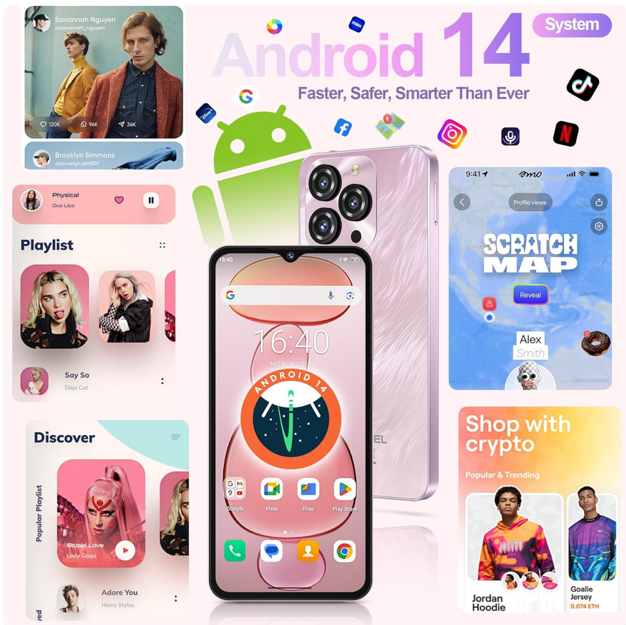
Image 4.1: OUKITEL C3 showcasing the Android 14 interface with various apps and system features.