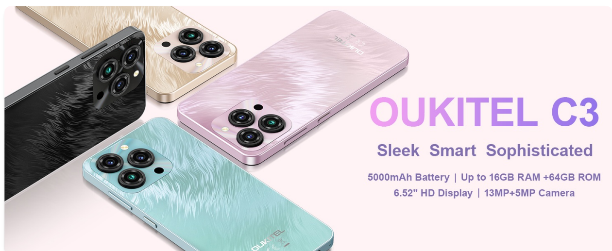
Image 4.4: OUKITEL C3 highlighting its 16GB RAM (4GB fixed + 12GB virtual) and 64GB ROM, expandable to 1TB.

Your device comes with 64GB of internal storage, expandable up to 1TB with a TF card. Regularly check your storage usage in Settings > Storage and clear unnecessary files to maintain optimal performance.