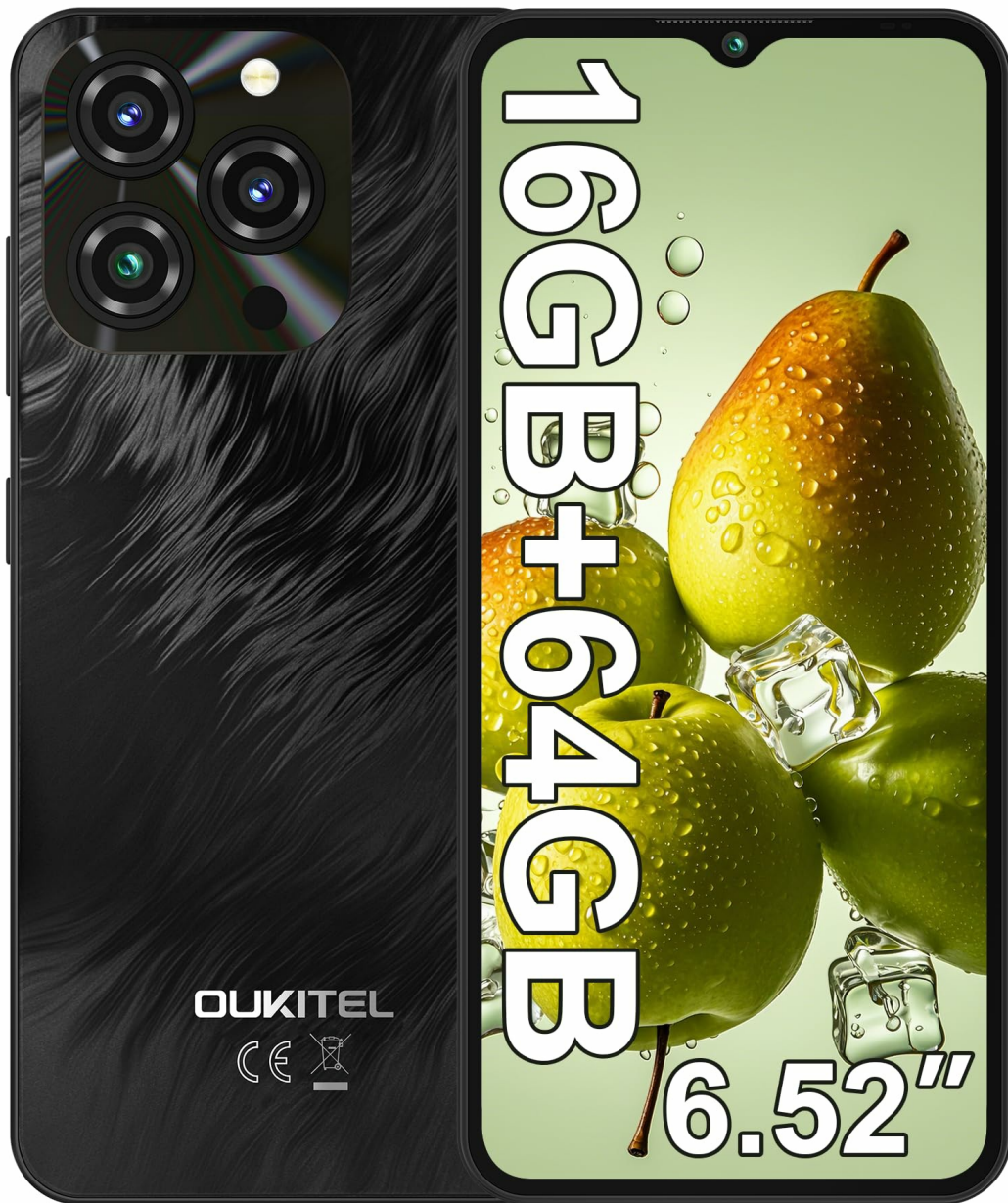
Image 1.1: OUKITEL C3 Smartphone in Grey. This image showcases the overall design of the phone.