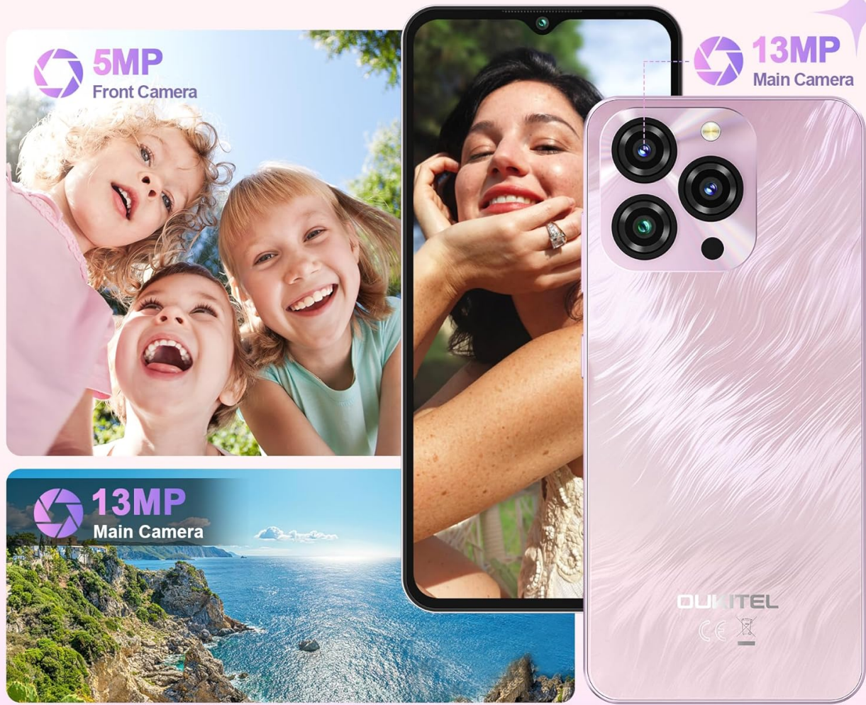
Image 4.2: Details of the 13MP main camera and 5MP front camera, highlighting their capabilities for photos and video calls.

Powered by the S5K3L8 sensor, the 13MP main camera tells a clear story every photo and 5MP front camera look your best in selfies and video calls.