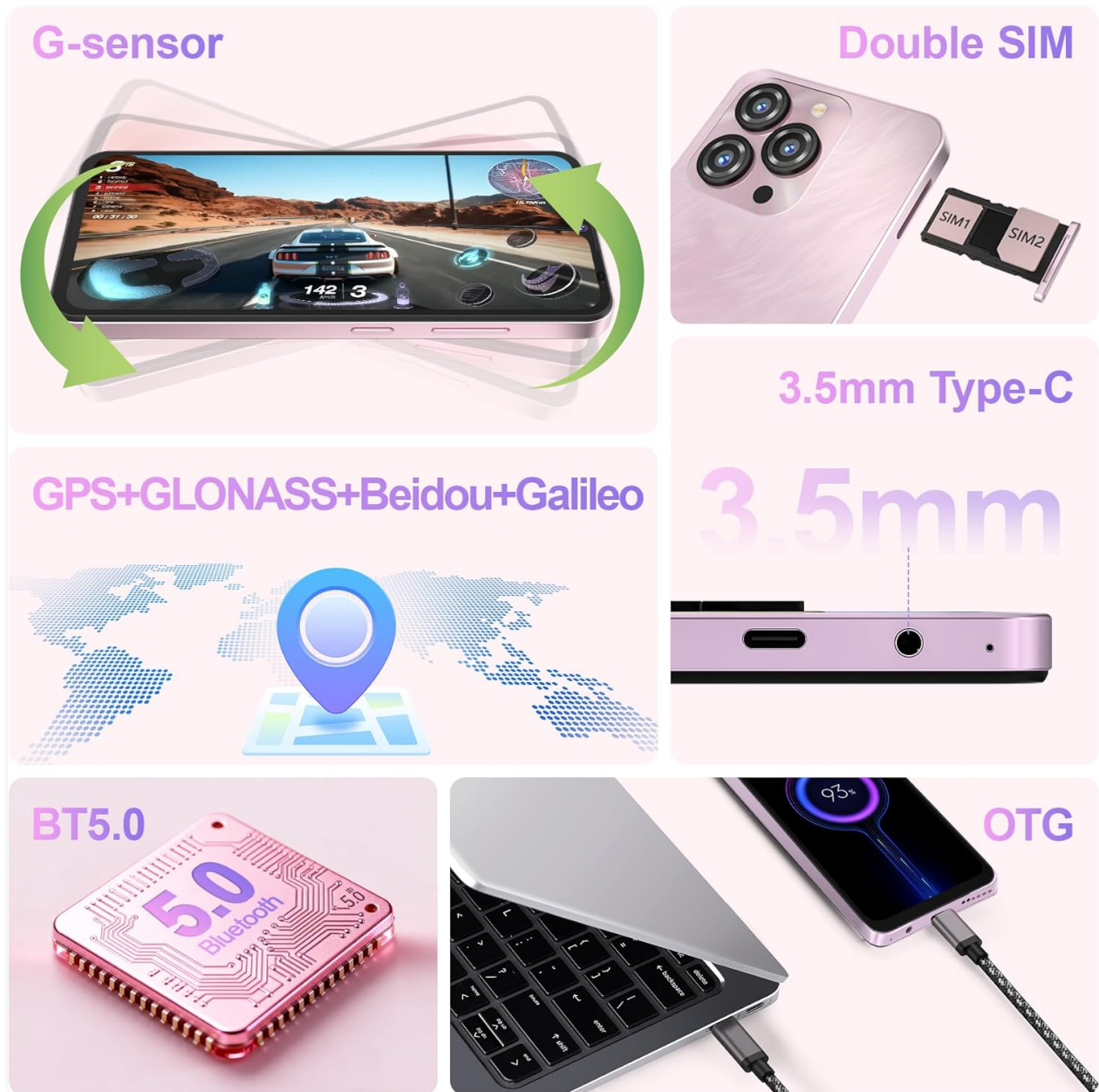
Image 3.1: Illustration of SIM card tray and other features like OTG, GPS, and Bluetooth. The SIM tray supports two Nano-SIMs or one Nano-SIM and one TF card.