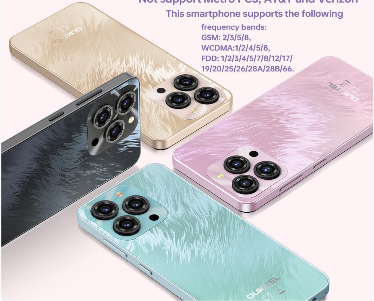
Image 3.3: OUKITEL C3 highlighting its T-Mobile carrier compatibility and supported frequency bands.

FDD: 1/2/3/4/5/7/8/12/17/ 19/20/25/26/28A/28B/66.