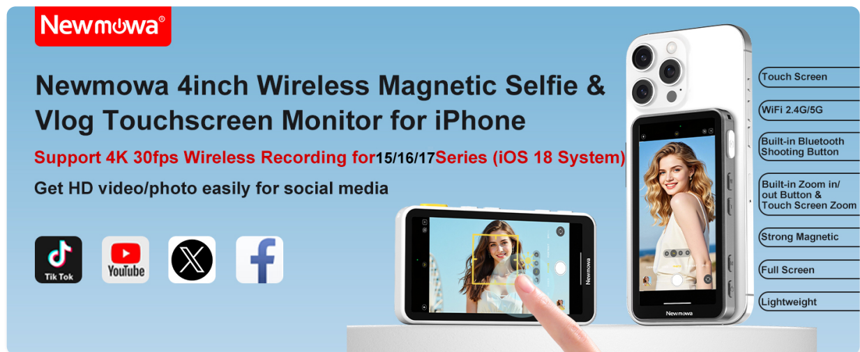
Image: The Newmowa Magnetic Vlog Selfie Monitor Screen demonstrating single-finger touch control for phone operation.

The Newmowa Magnetic Vlog Selfie Monitor Screen is designed to enhance your iPhone content creation by providing a real-time, interactive display for your rear camera. This device features a 4-inch touchscreen, magnetic attachment, and wireless connectivity, allowing for precise control and improved framing during vlogging, selfies, and video recording.