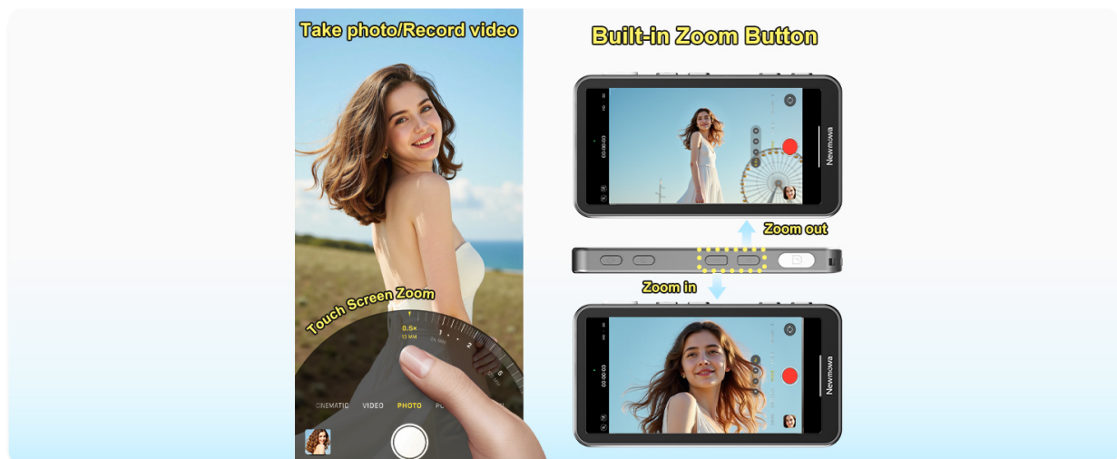
Image: Demonstrates touchscreen zoom and the ability to view photo albums directly on the monitor.