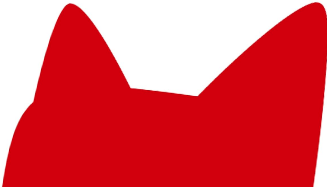
Figure 6: The Cow Tonie character and its associated tracklist.

Squeeze an ear and get ready for songs, stories and more