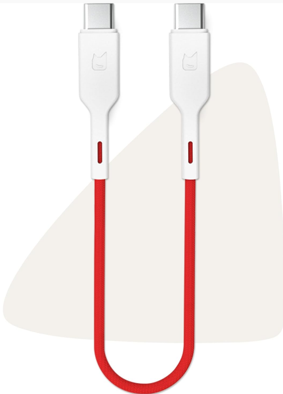
Figure 4: The included 22cm USB-C charging cable, designed for child safety.