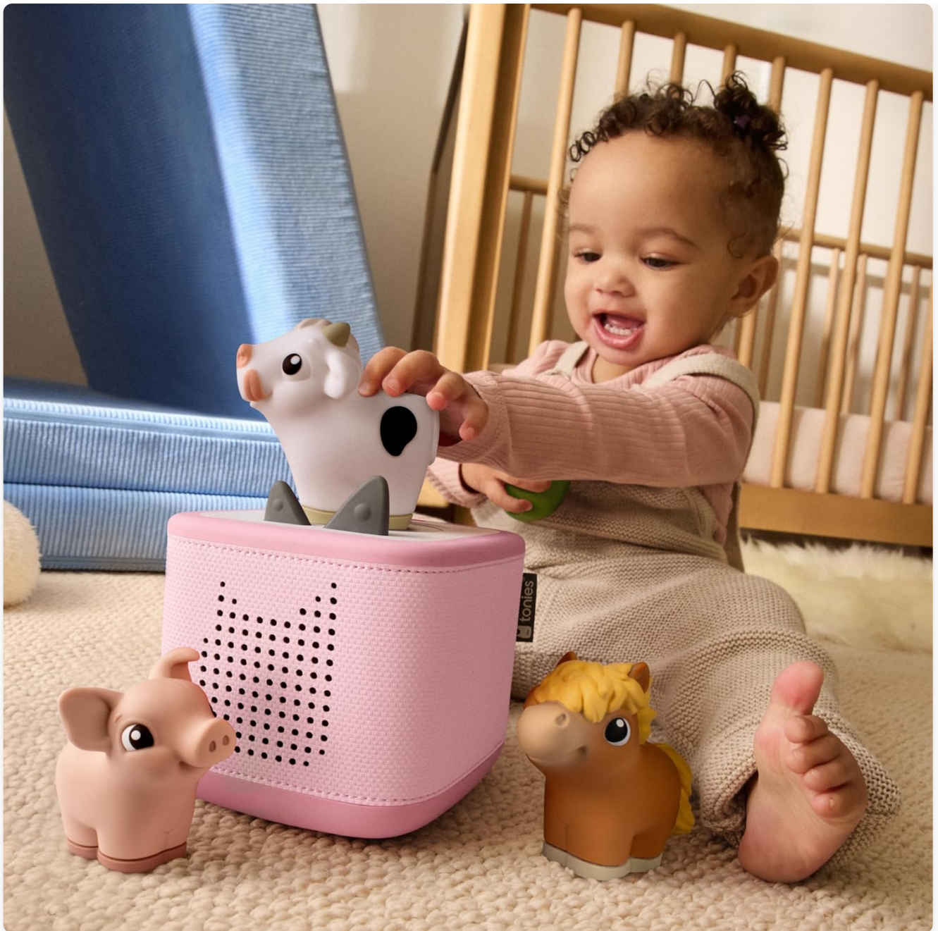
Figure 5: A child independently placing a Tonie character on the Toniebox 2 to initiate audio playback.