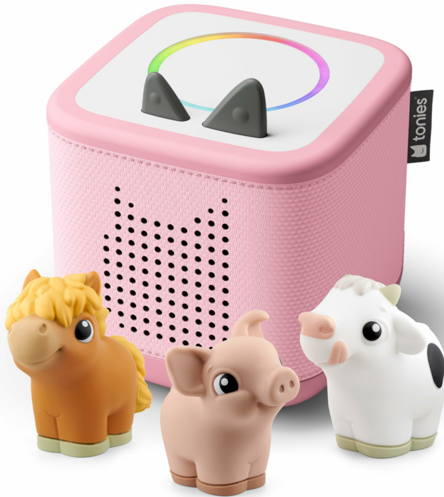
Figure 1: The Toniebox 2 in Cloud Pink with the My First Farm Bundle, featuring the Cow, Horse, and Pig Tonies.