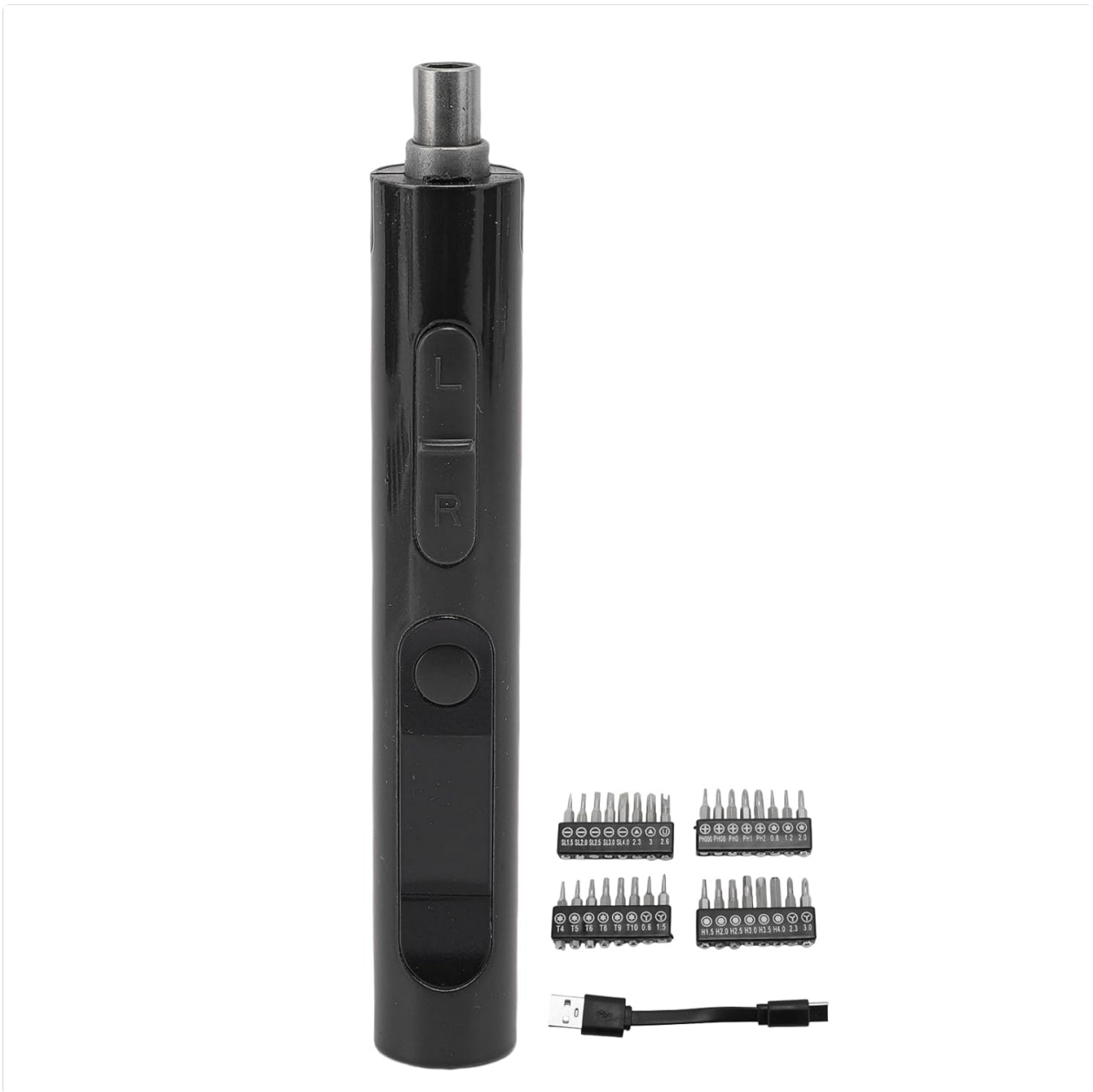
Image 1.1: The WOHPNLE Electric Screwdriver Set, including the main screwdriver unit, 32 screw bits, and a charging cable.