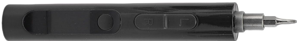
Image 6.1: The electric screwdriver being used for precision repair work.

Featuring an advanced torsion function, this mini electric screwdriver offers precise control, allowing users to avoid over tightening or under tightening screws, thus ensuring optimal performance and protecting.