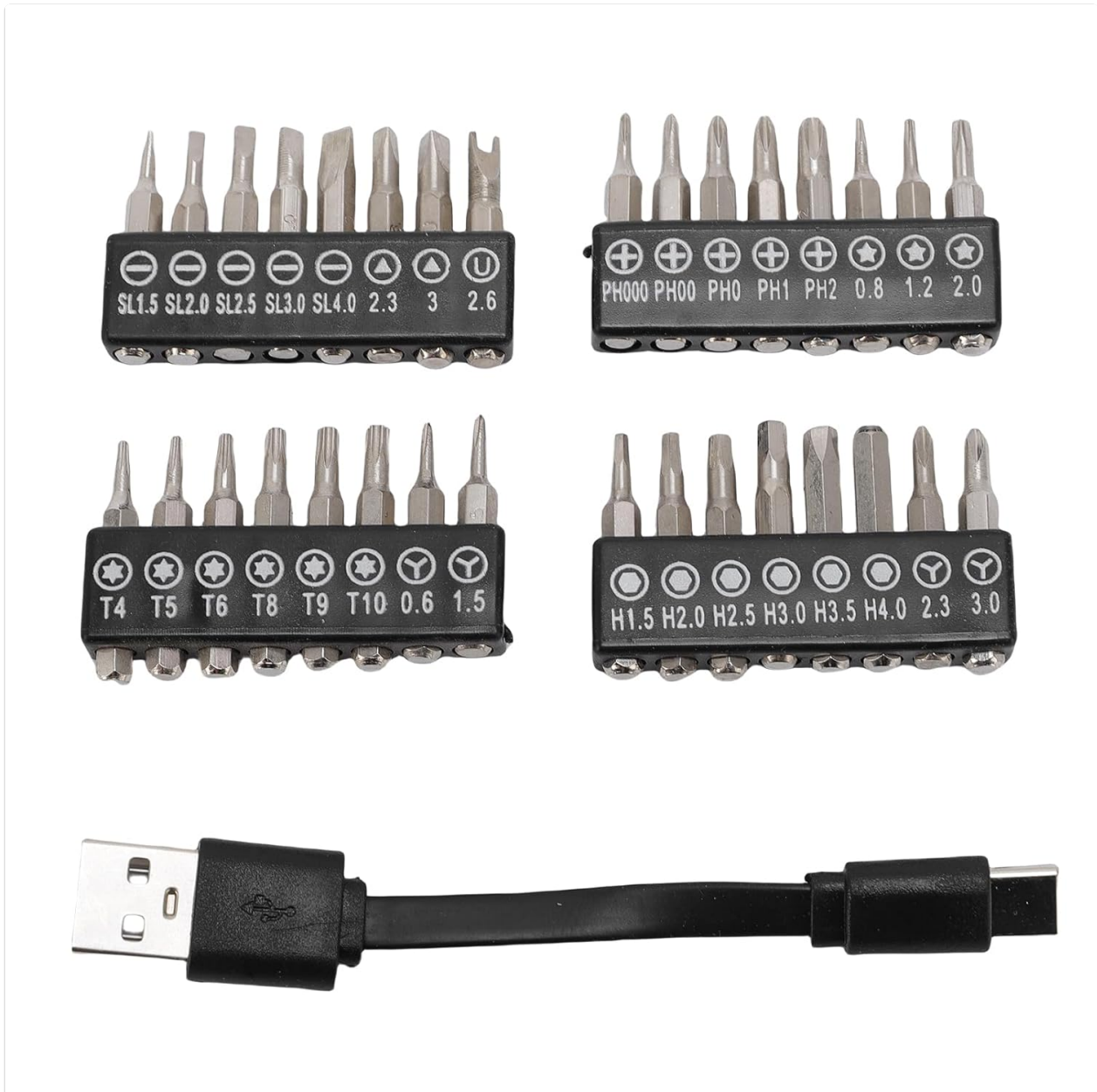
Image 3.1: The comprehensive set of 32 screw bits and the Type-C charging cable.