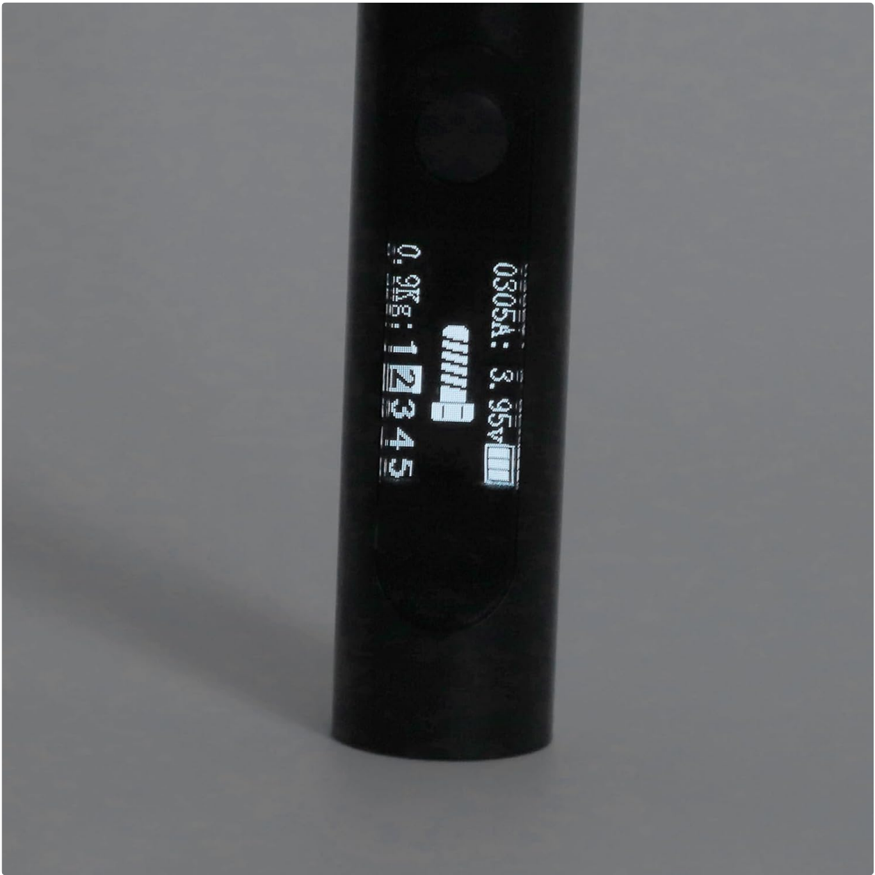
Image 4.2: The ultra-clear display indicating battery status and voltage.