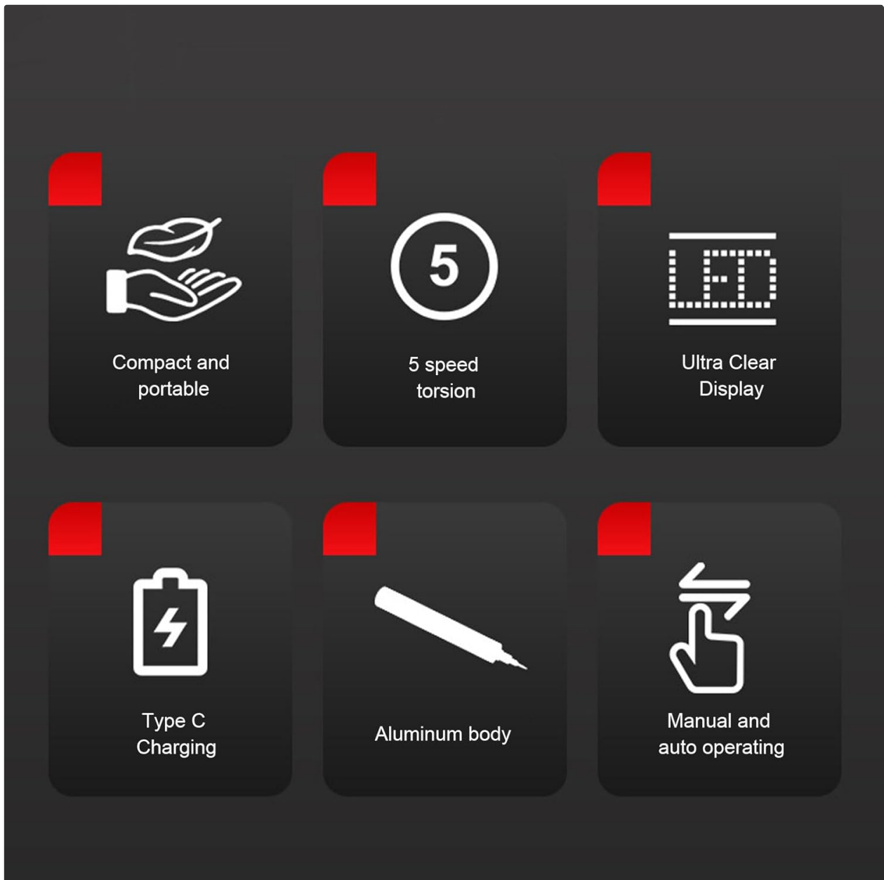
Image 4.1: Visual representation of the screwdriver's main features.