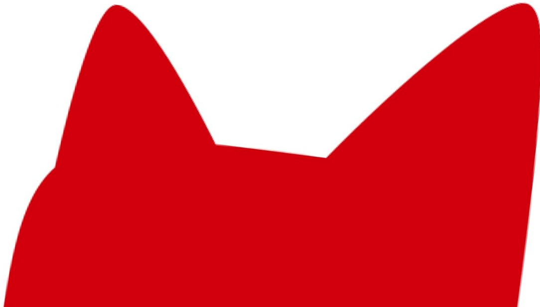
Image: Simple steps for independent play with the Toniebox 2.

Squeeze an ear and get ready for songs, stories and more