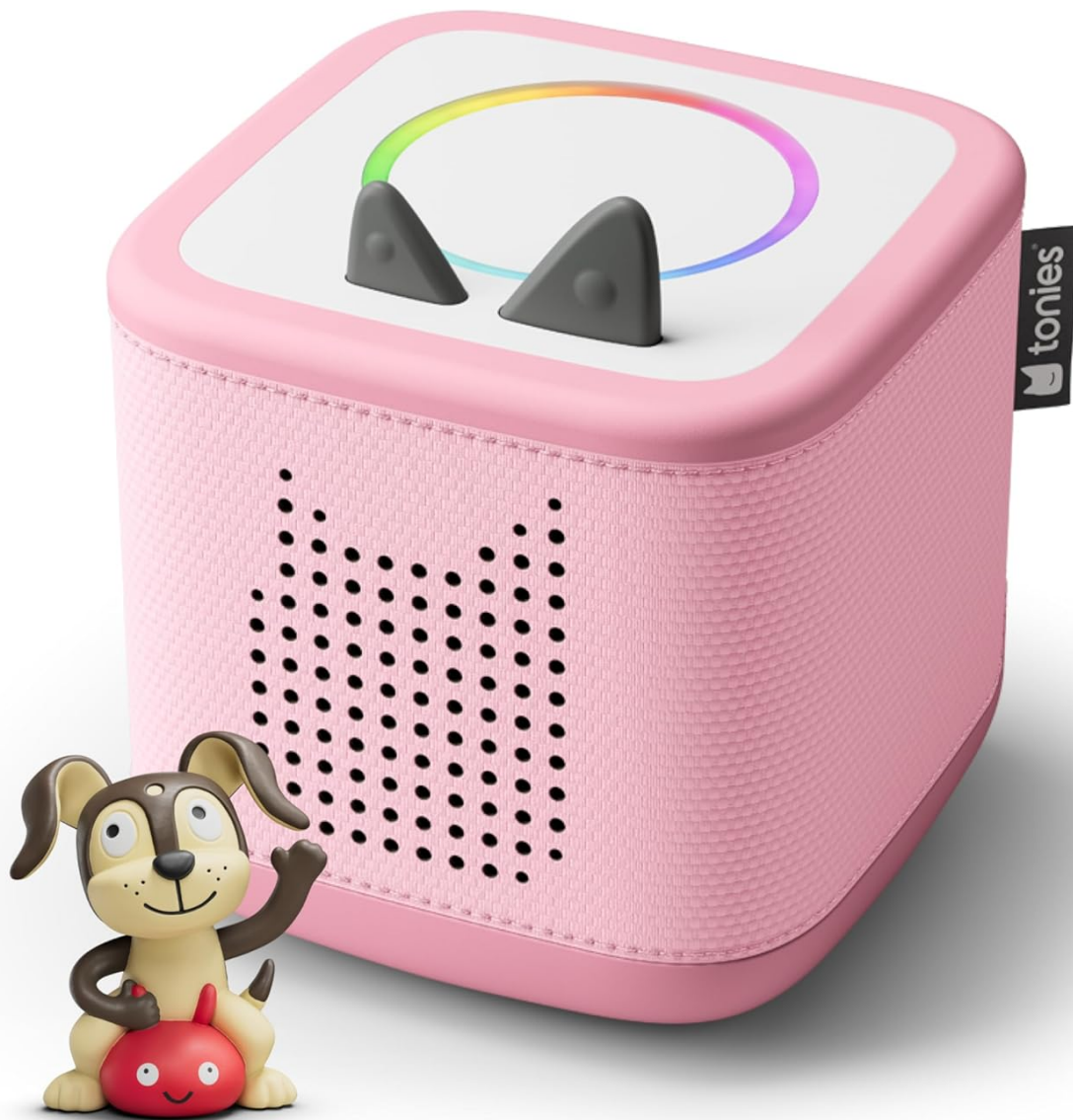
Image: The Tonies Toniebox 2 in Cloud Pink, accompanied by the Playtime Puppy Tonie.