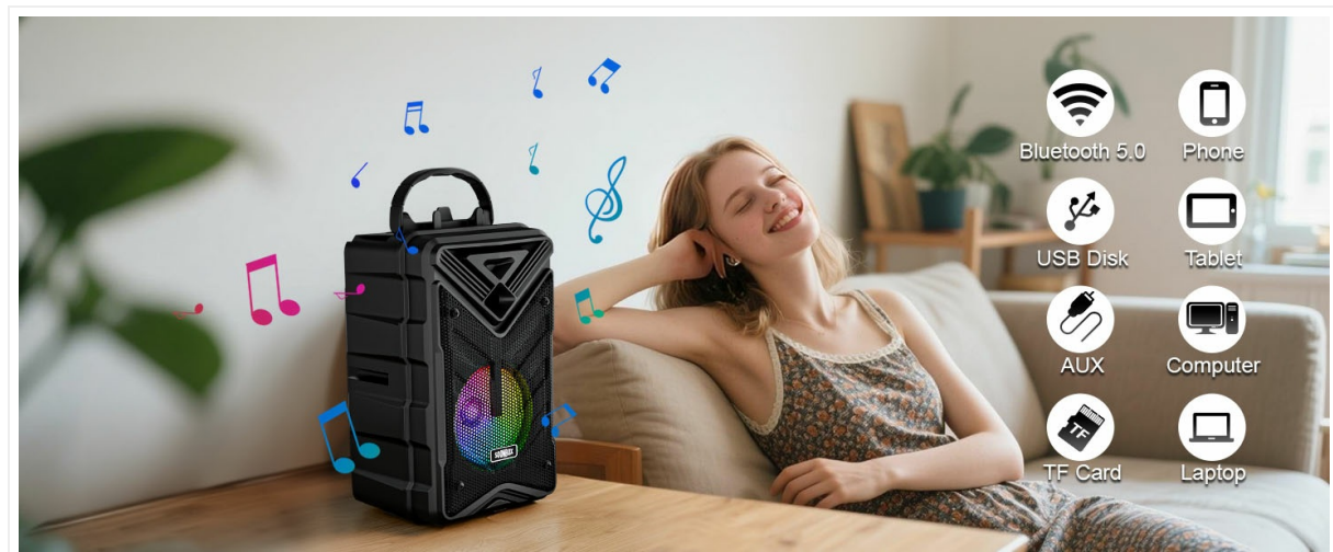
Image: People enjoying music with the speaker's dynamic LED light show.

The speaker features colorful RGB lights. Press the Light Mode button (refer to product diagram for exact location) to cycle through different lighting effects or turn them off.