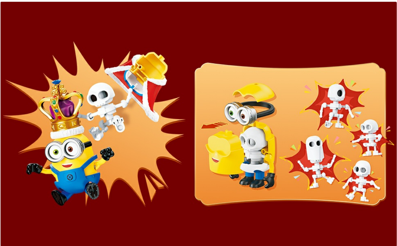
Image 4.2: Instructions for assembling the bonus skeleton figure and placing it inside the Minion figure.