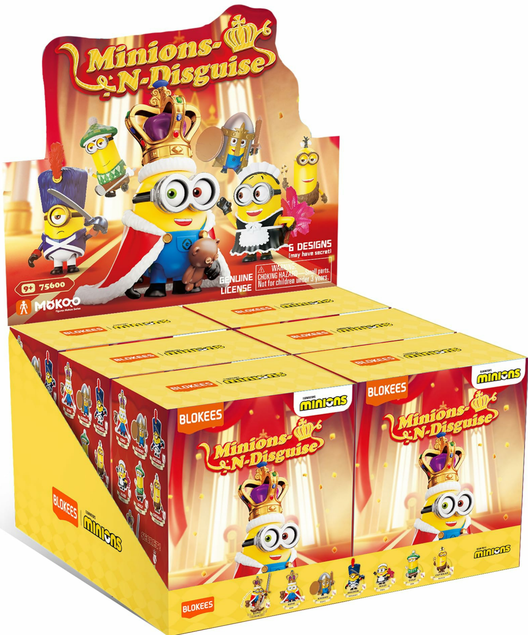
Image 1.1: The BLOKEES Minions Mokoo Series - 01 N-Disguise figure, featuring King Bob with his crown, cape, sword, rocking horse, and teddy bear accessories.