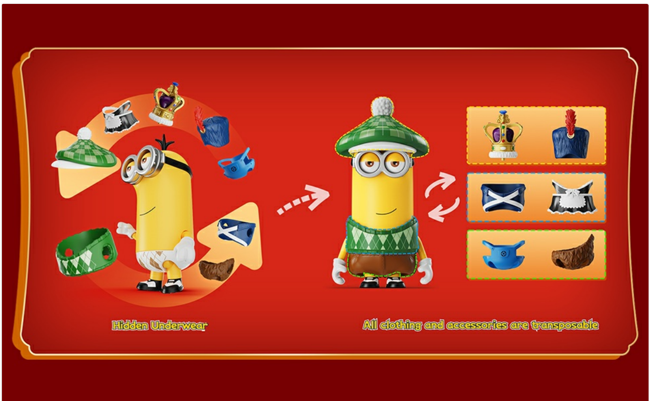
Image 4.1: Illustration demonstrating the transposable nature of all clothing and accessories on the Minion figure, revealing the hidden underwear base.