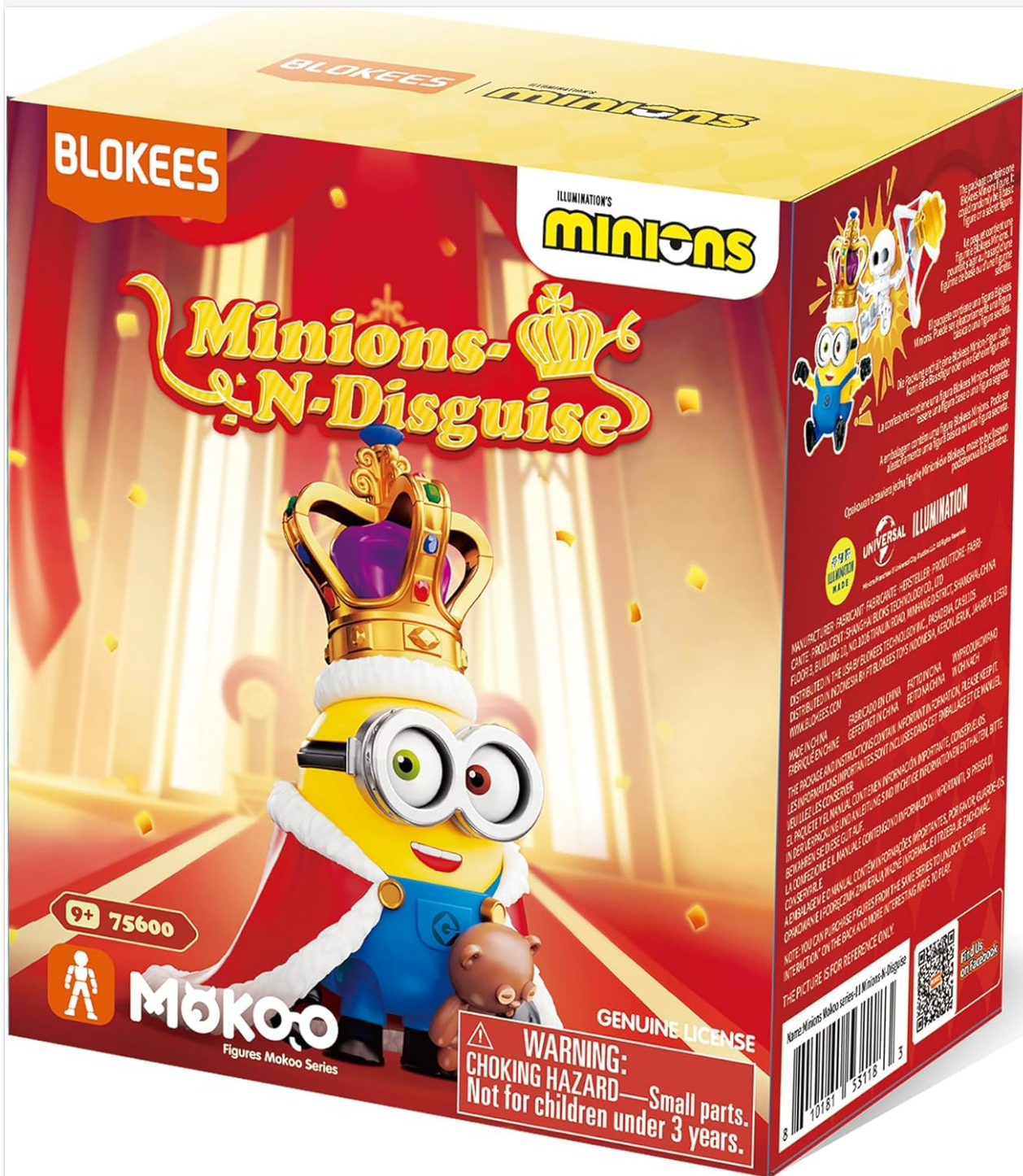
Image 3.1: The BLOKEES Minions Mokoo Series - 01 N-Disguise product packaging.