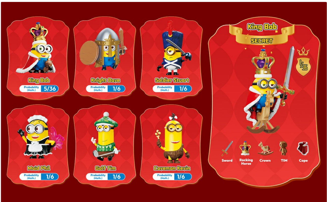
Image 3.2: An overview of the various Minion characters and their accessories available in the Mokoo Series - 01 N-Disguise collection.