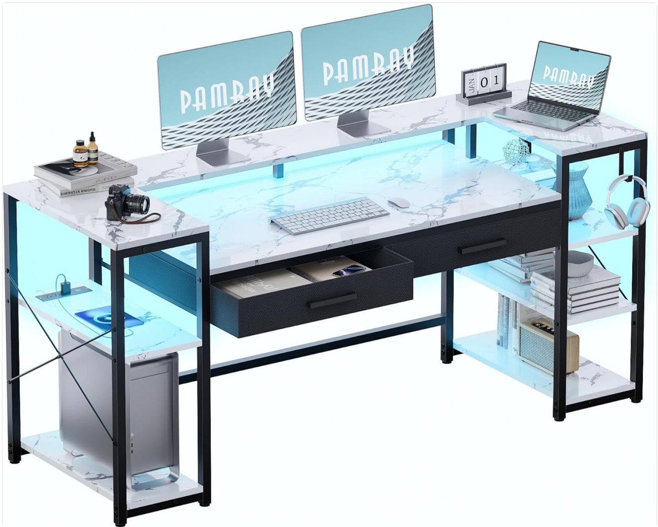
Image: The desk illuminated by RGB LED lights, with an illustration of the smartphone app control interface.