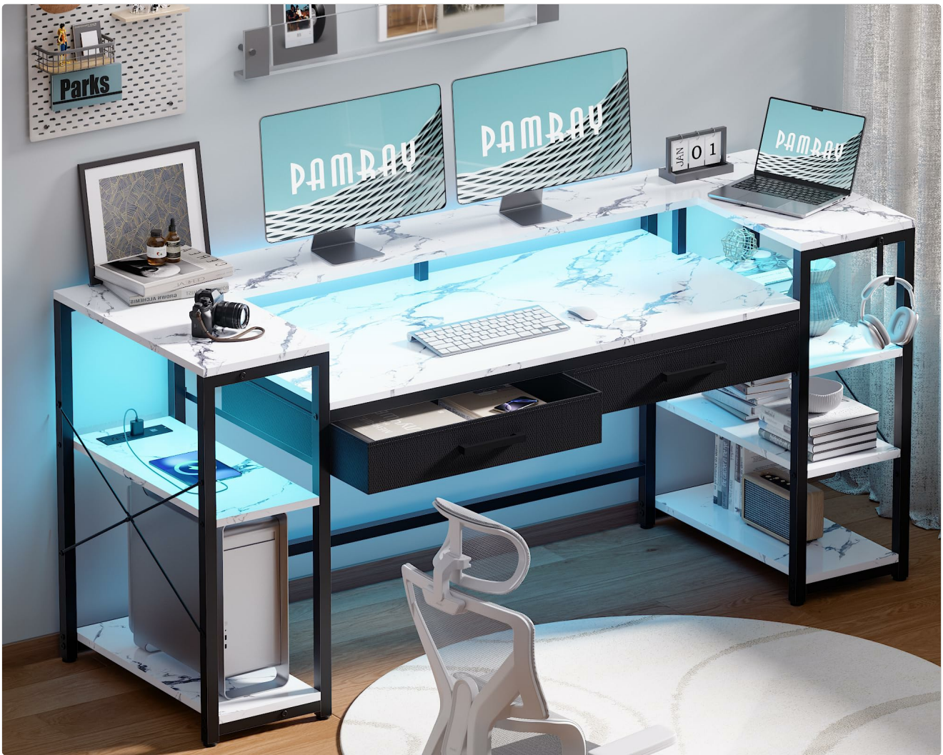
Image: Fully assembled Pamray S15 Marble 58-inch Computer Desk, showcasing its design and features.