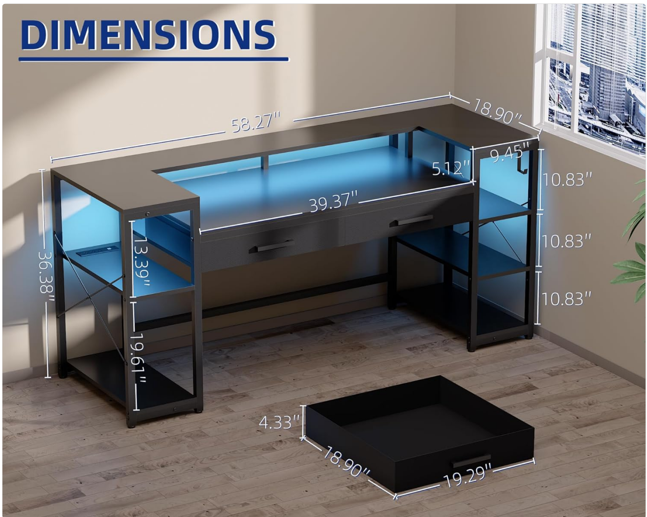
Image: Technical drawing illustrating the precise dimensions of the desk components.