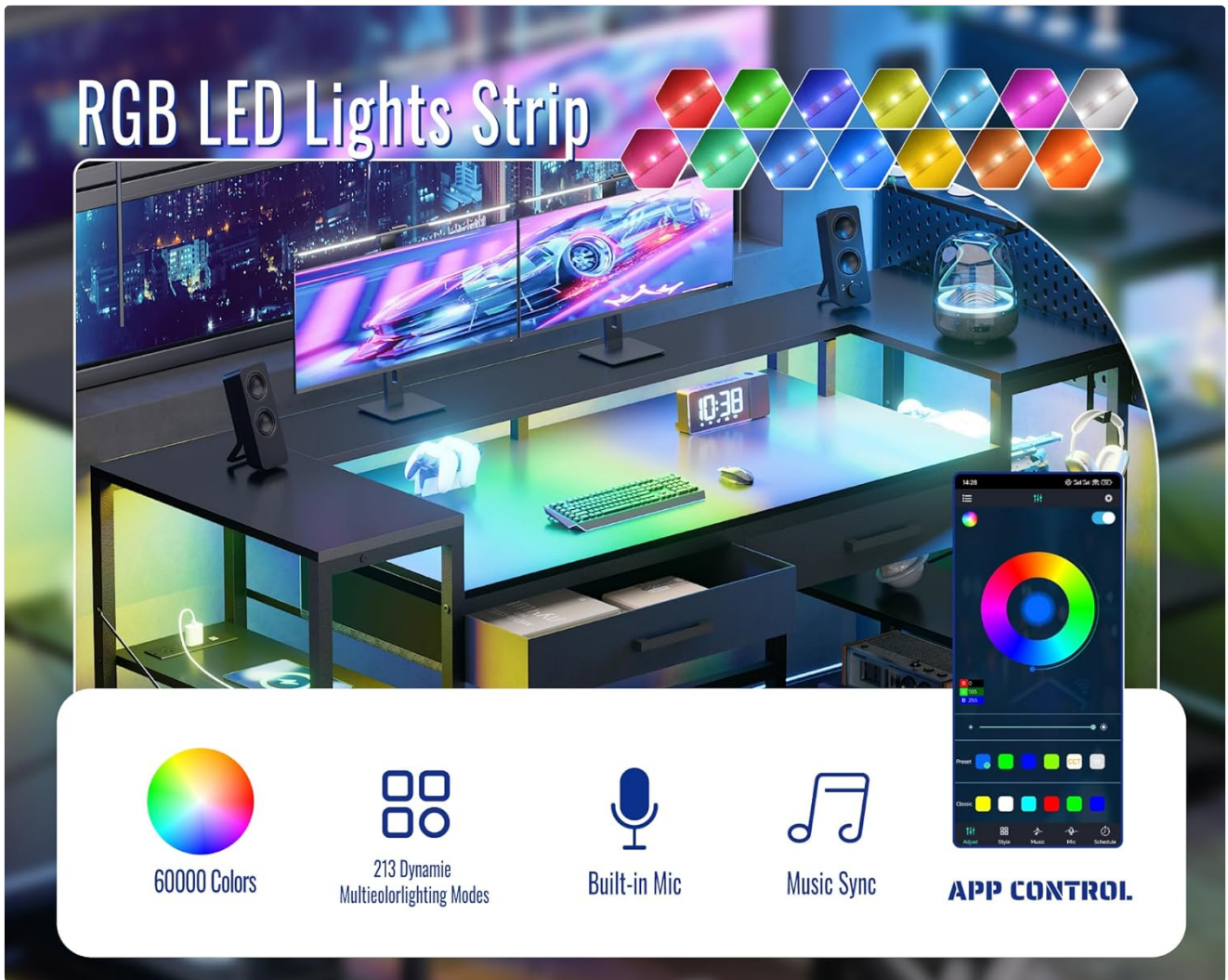
Image: The U-shaped monitor stand integrated into the desk, designed to maximize workspace.