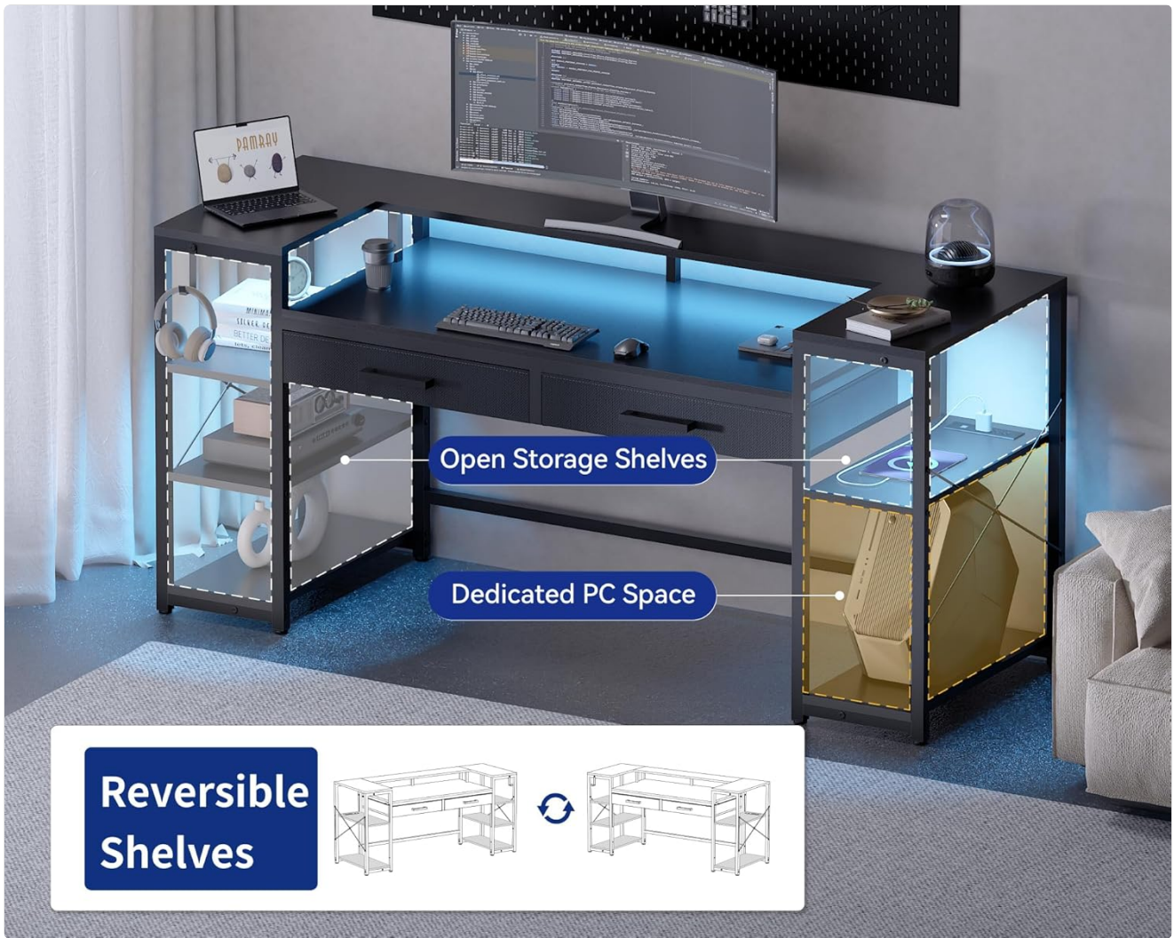
Image: Illustration of the desk's open storage shelves and a dedicated space for a PC tower.