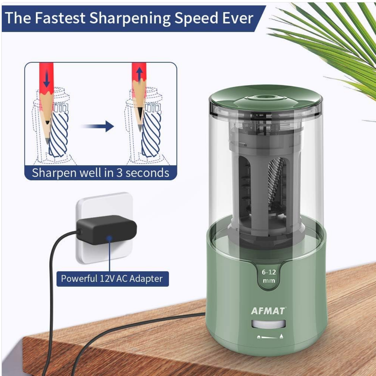
Image: The AFMAT Electric Pencil Sharpener connected to its 12V AC power adapter, ready for use.