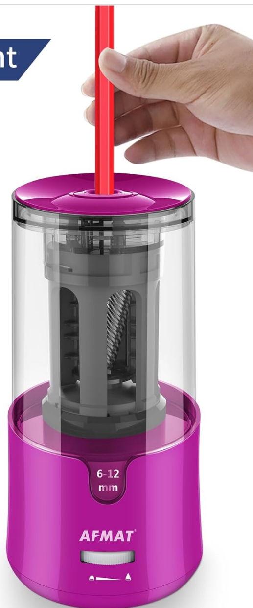
Image: The sharpener's auto-stop feature is shown, indicating it stops when sharpening is complete. It also highlights the automatic exclusion of broken lead.

The sharpener is designed to automatically exclude broken lead, preventing jams and ensuring consistent performance.