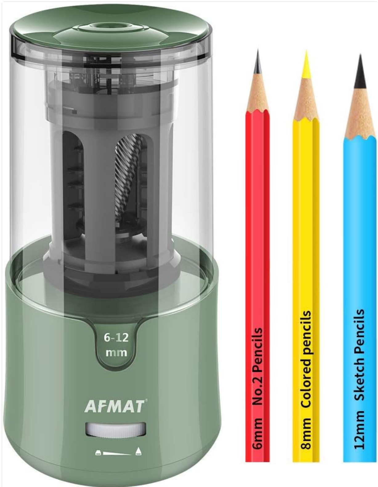
Image: AFMAT Electric Pencil Sharpener (Green) demonstrating compatibility with various pencil diameters.

The sharpener accommodates pencils with diameters ranging from 6mm to 12mm, including standard No.2 pencils, colored pencils, and jumbo sketch pencils.