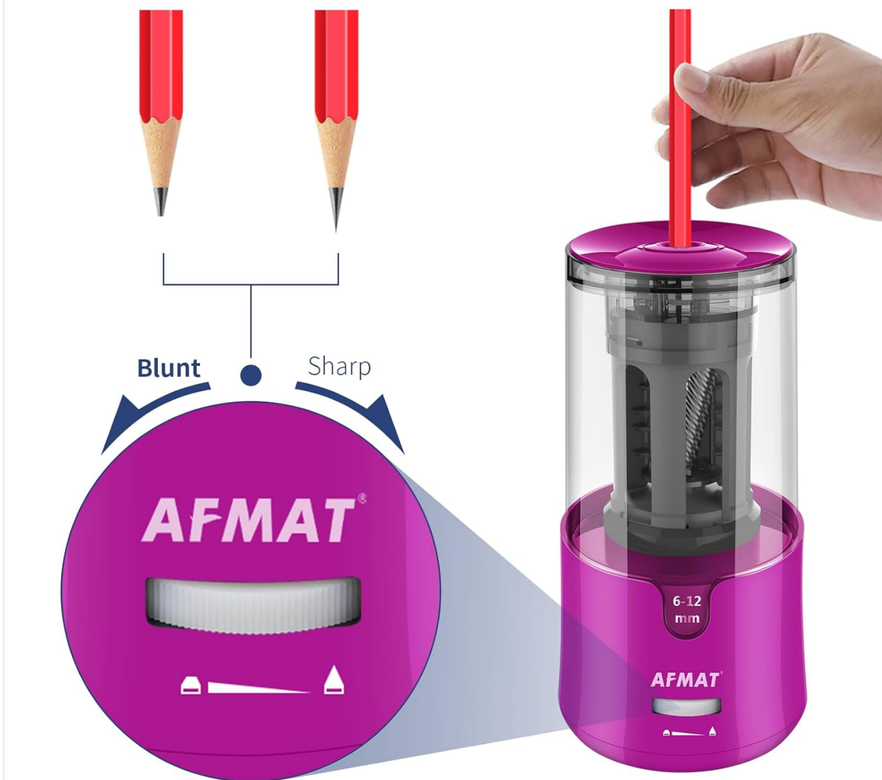
Image: Close-up of the AFMAT sharpener's dial for selecting between blunt and sharp pencil points, with visual examples of each.