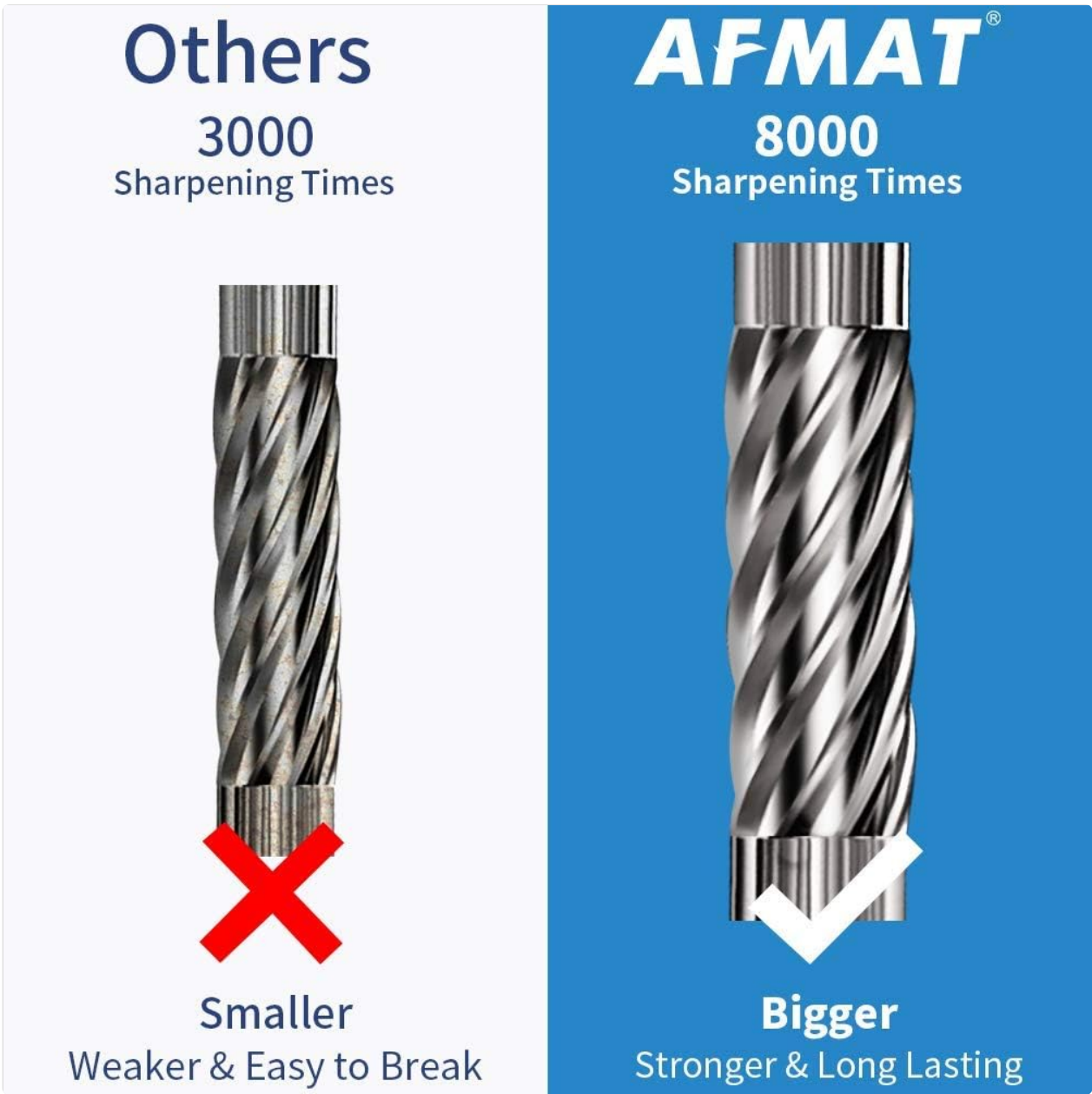
Image: A visual comparison showing the AFMAT sharpener's cutter, designed for 8000 sharpenings, next to a smaller, less durable cutter.