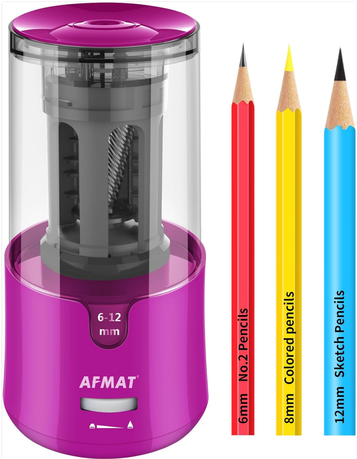
Image: AFMAT Electric Pencil Sharpener (Purple) showing compatibility with 6mm No.2 pencils, 8mm colored pencils, and 12mm sketch pencils.