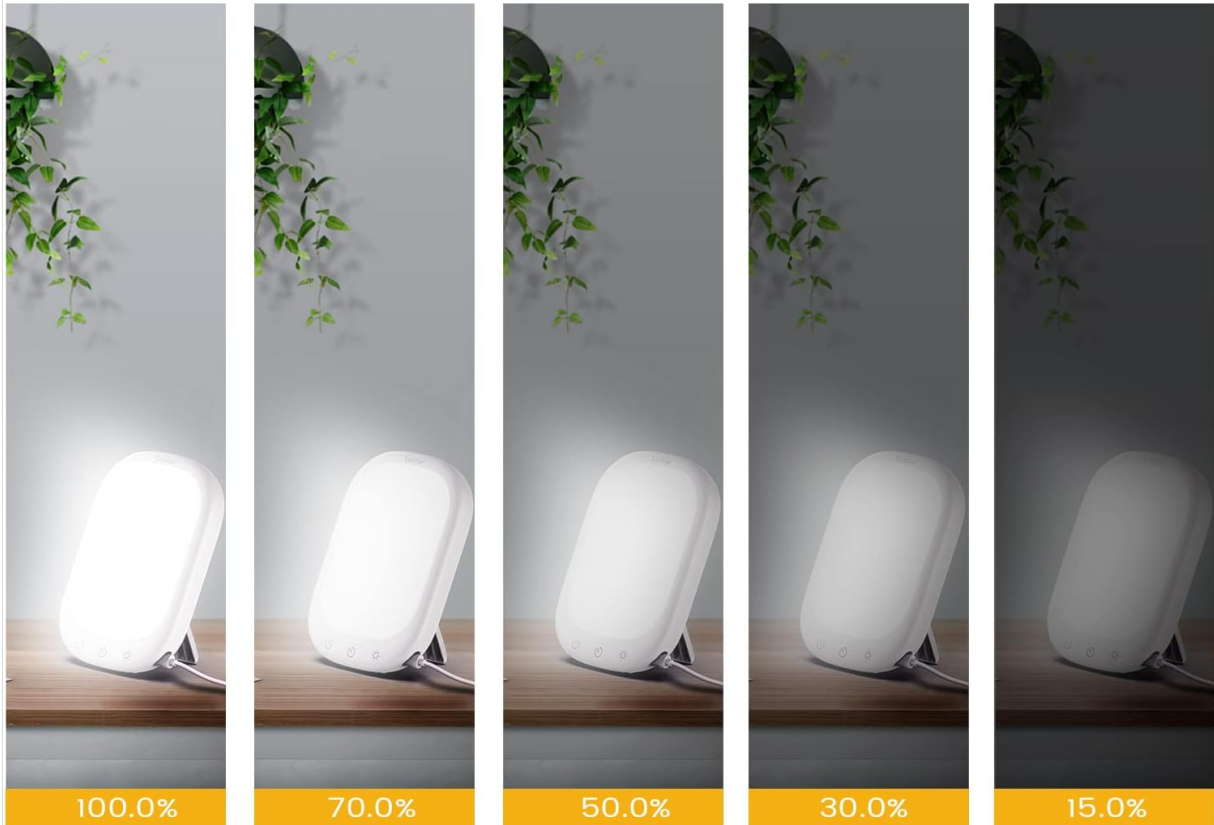
Image: Front view of the LASTAR Light Therapy Lamp showing the power, timer, and brightness control buttons, and the adjustable stand.