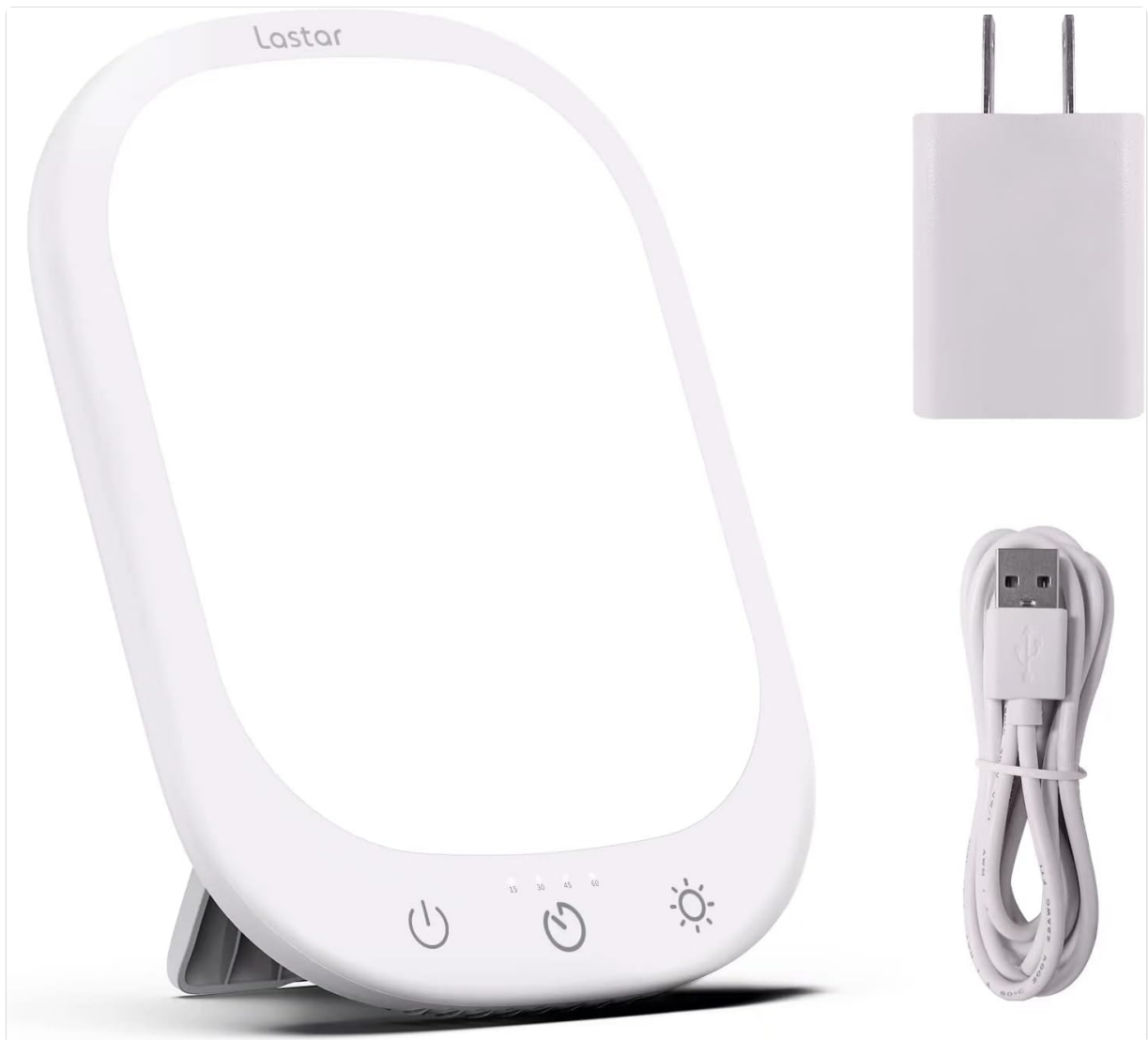
Image: LASTAR Light Therapy Lamp, USB-C cable, power adapter, and wall mounting hardware.