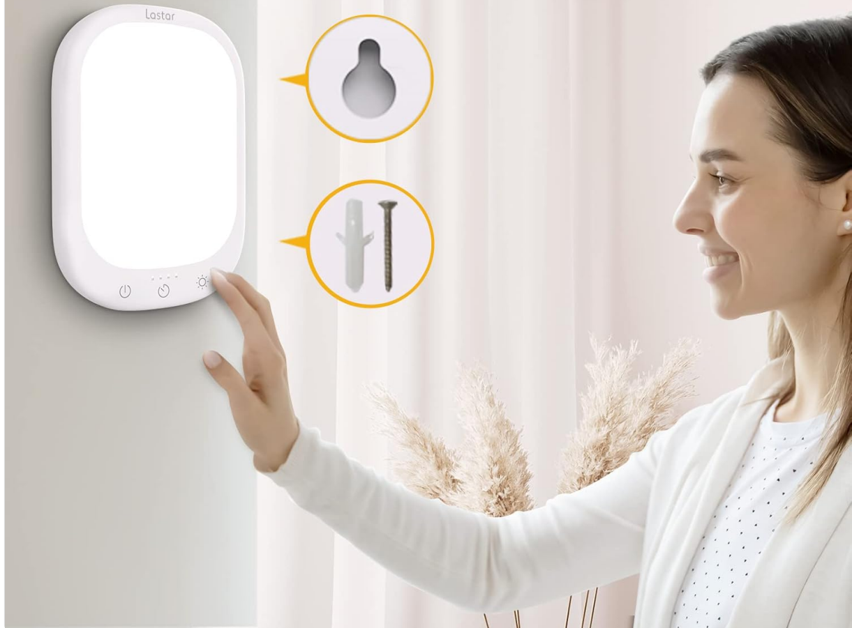
Image: A person demonstrating wall mounting of the LASTAR Light Therapy Lamp, showing the hanging hole and included screws.

There is a hanging hole on the back for hanging on the wall and includes a pack of blasting screws.