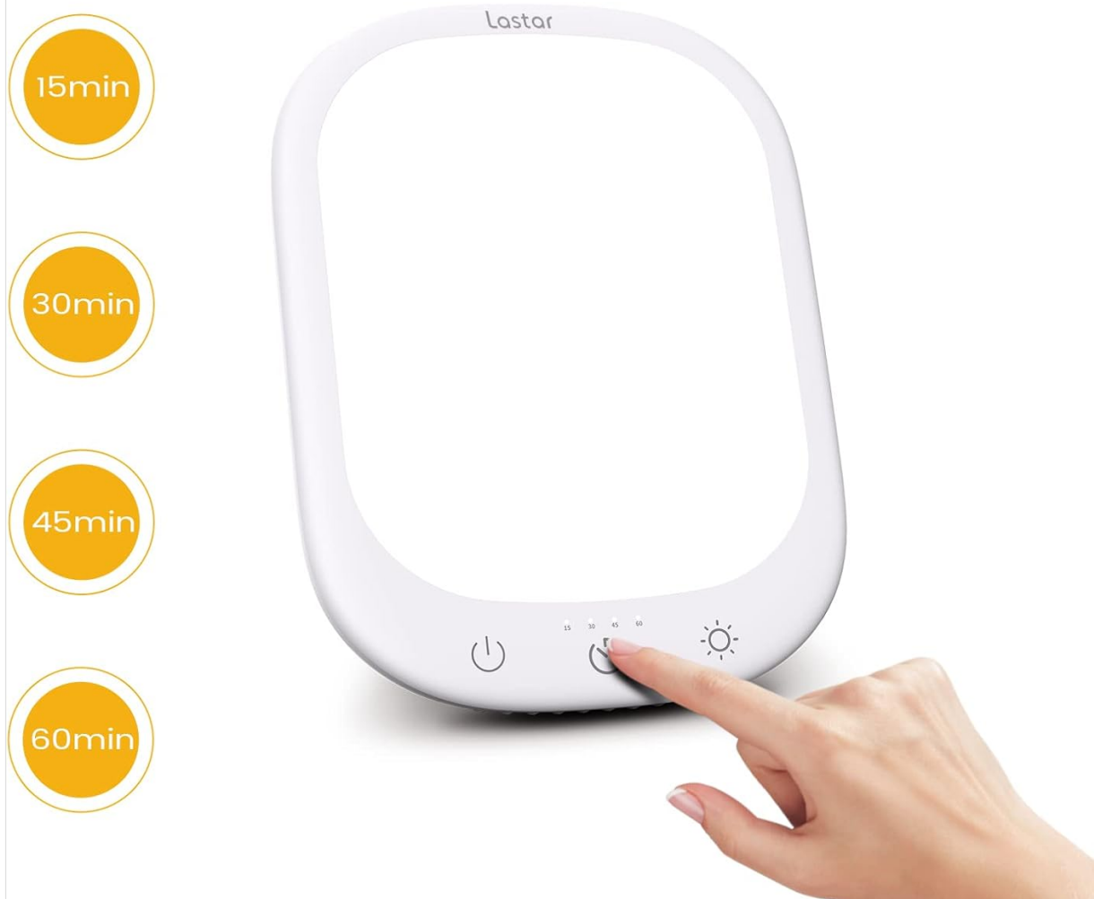
Image: A hand pressing the timer button on the LASTAR Light Therapy Lamp, with indicators for 15, 30, 45, and 60-minute settings.

Timing selection of different time periods to customize your phototherapy in a scientific way